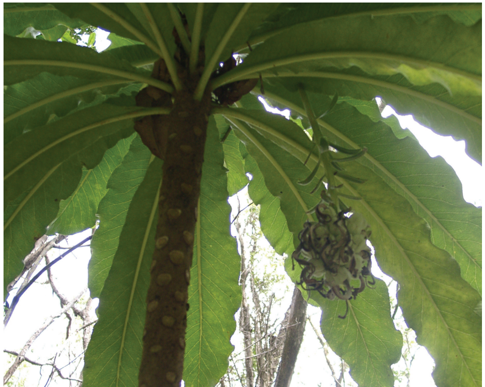
Cyanea superba is an endangered, palm-like tree crowned by a rosette of leaves.