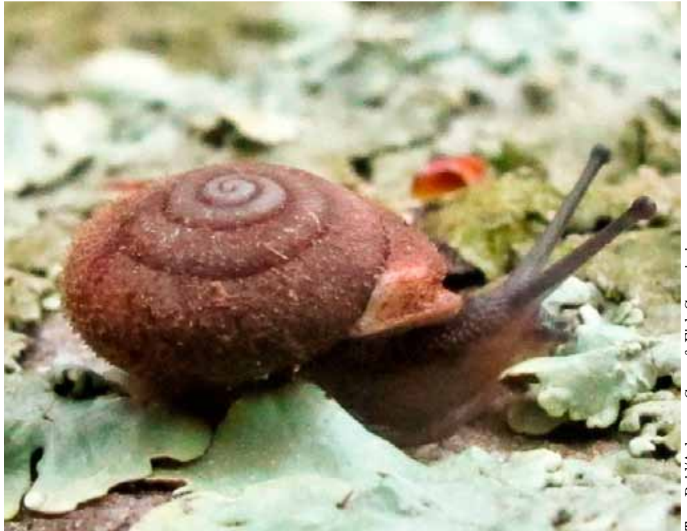
Trey Reid/Arkansas Game & Fish Commission

The Magazine Mountain shagreen snail became the first invertebrate to be recovered and removed from federal protection in 2013.