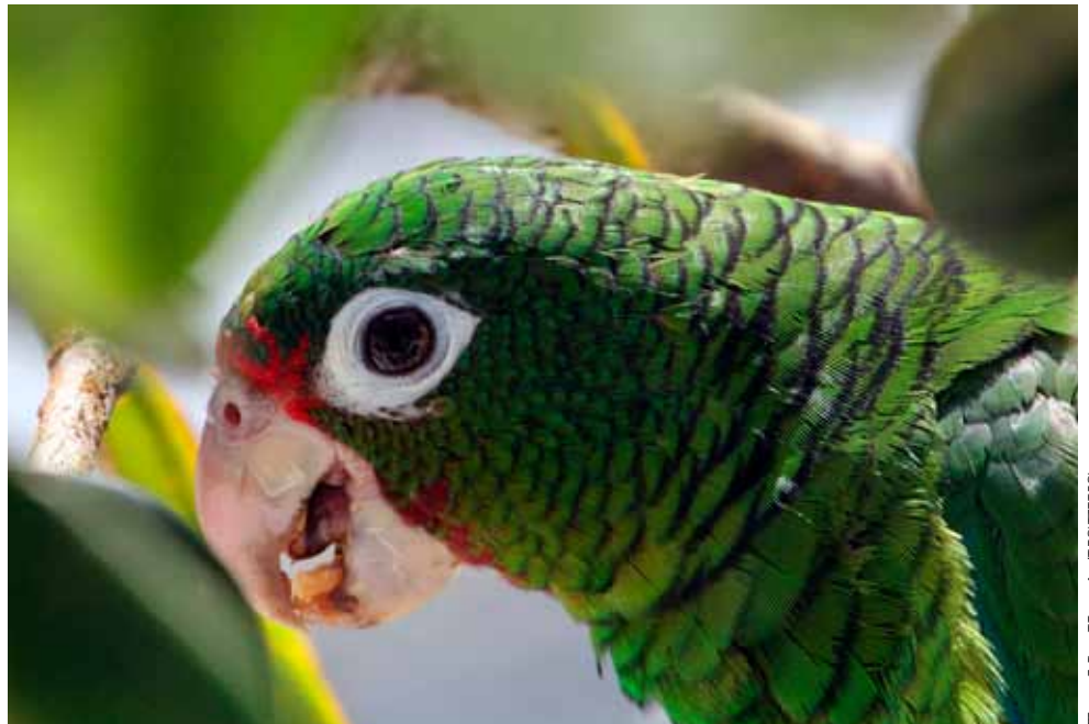
For the first time in 100 years, two endangered Puerto Rican parrots born in the wild fledged the nest successfully in 2014.