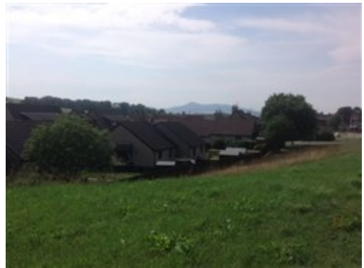
Aerial View of Barra Hill

(57.33224; -2.31862) https://w3w.co/guides.grudge.unguarded In 200 m, or so, from taking the path off the minor road, you will have arrived back at the cul-de-sac on Millbank Road where you started the walk. (7.2 km)