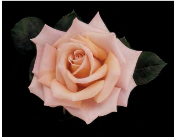
SUNSET CELEBRATION Hybrid tea, creamy apricot amber blend, AARS