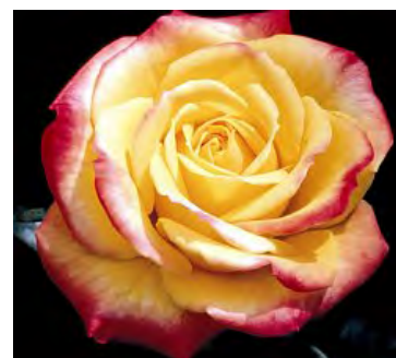
Rainbow's End - a highly rated yellow and red blend miniature

2009 Rose Collection is $48.00, payable to your individual Club Rose Chairman. Expected delivery is mid-March 2009.