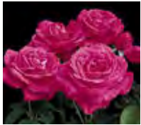
Miss All American Beauty

'Morden Blush' light pink modern shrub rose that looks like an Old Garden Rose