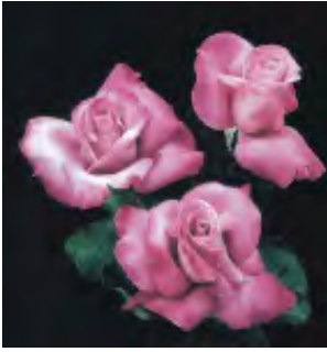
Fragrant Plum - a highly fragrant lavender Hybrid Tea