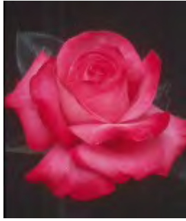
Elizabeth Taylor - a flashy hot pink blend Hybrid Tea with exhibition form