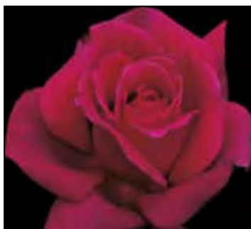
Firefighter - a highly fragrant red Hybrid Tea