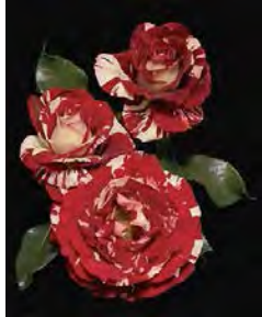
Rock n Roll Grandiflora Burgundy and cream striped bicolor