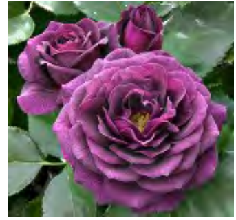
Ebb Tide - a powerfully perfumed purple Floribunda