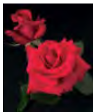
Let Freedom Ring

'Melody Parfume' Deep Plum Grandiflora, maturing to lavender; very fragrant