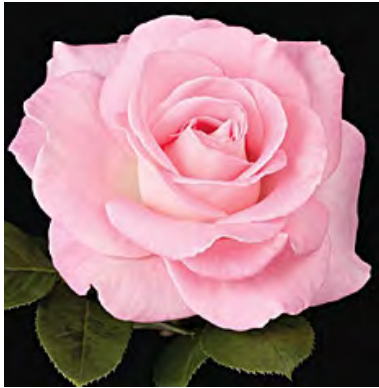
Falling in Love

Fragrant, warm pink and porcelain white Hybrid Tea