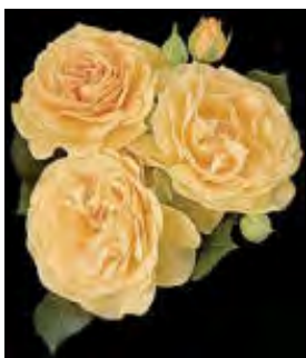
Julia Child - a disease resistant yellow Floribunda