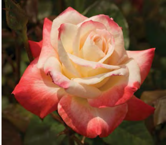
GEMINI - SUNSET CELEBRATION Hybrid tea, cream and coral All-American Rose Selection (AARS)

Ordering information available through individual Member Club Rose Chairmen