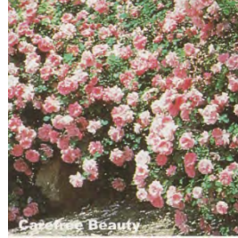
Carefree Beauty Shrub Rose Clear pink