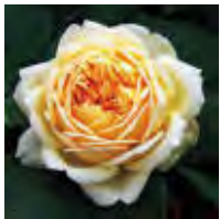
Jude the Obscure

'Jude the Obscure' bloom with medium yellow petals on the inside and paler yellow on the outside