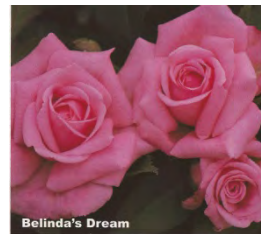
Belinda's Dream Floribunda Even medium pink