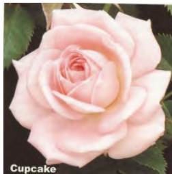
Cupcake Miniature Perfect pure pink