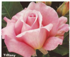
Tiffany Hybrid Tea Phlox pink with a yellow base AARS