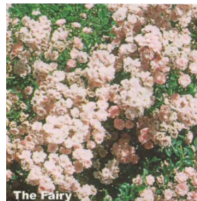
The Fairy Polyantha Pastel Pink