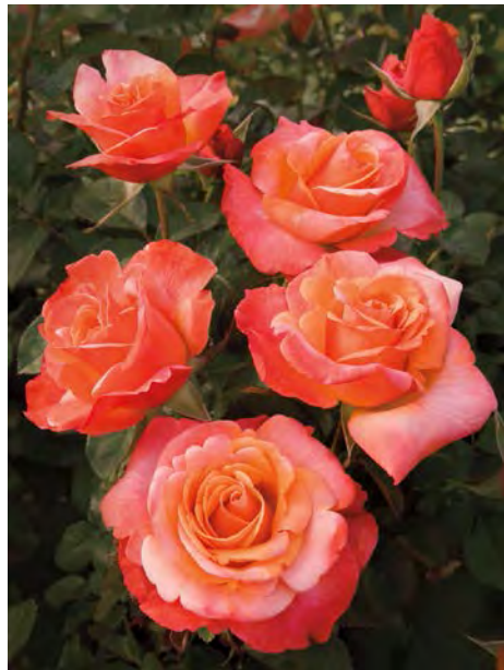
COLORIFIC Floribunda, salmon and scarlet blush