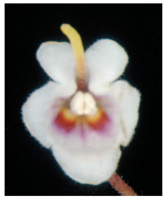
Henckelia geitleri from Pahang, Malaysia