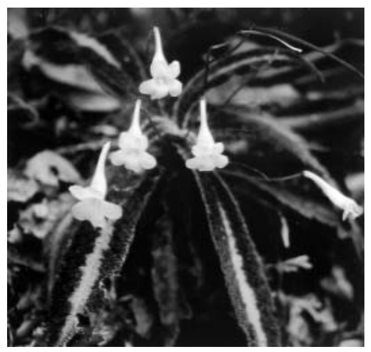
Henckelia curtisii from Pahang, Malaysia