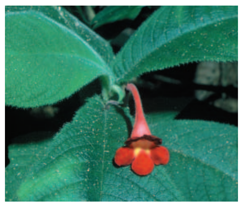
Henckelia atrosanguinea from Pahang, Malaysia