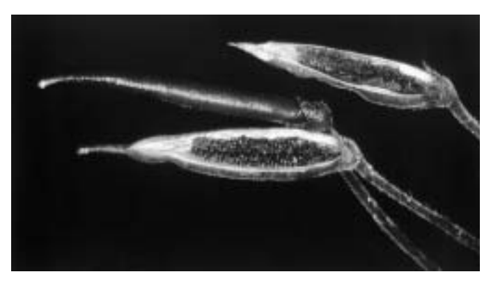
Henckelia puncticulata open fruits showing horizontal position and seeds exposed to rain

(2) The fruits are 'plagiocarpic', making a distinct (135^{\circ} \text{ to } 90^{\circ}) angle with the pedicel. This ensures that the fruit can be held horizontally. Opening is along the upper median line only ('follicular capsule'). The poise and opening mode of the fruits result in the presentation of the seeds so that they are open to splash-dispersal by raindrops. This is in clear correlation with the distribution pattern of the genus in a \pm ever-wet area. In contrast, in Didymocarpus the fruits are 'orthocarpic' (pedicel and fruit in straight line) and dehisce loculicidally by two valves; position is either erect or pendulous.