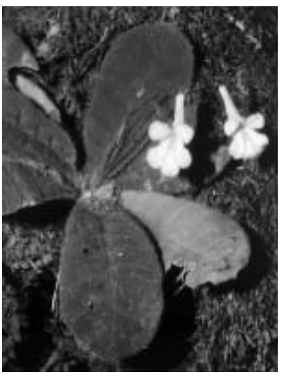
Henckelia bakoensis from Borneo