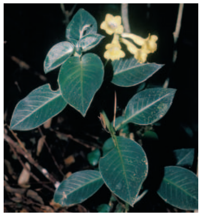
Henckelia malayana from Selangor, Malaysia