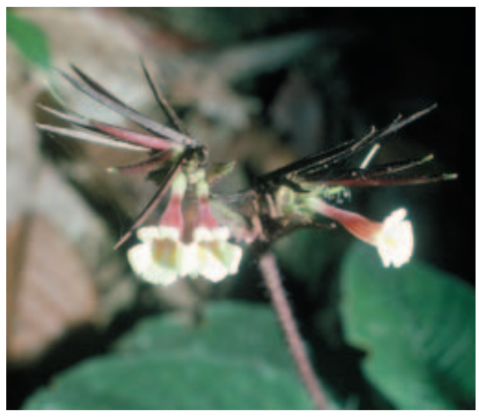
Henckelia flavobrunnea from Pahang, Malaysia