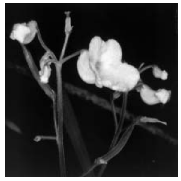
Henckelia incana from SW India

Henckelia sect. Henckelia : This part of the genus (the 'type section' which includes the type species Henckelia incana = Didymocarpus tomento-sus ) comprises the species from South India and Sri Lanka. Species number about 15. With the exception of the creeping H. repens , the species are plants with basal leaves forming a compact rosette. The leaves are spirally arranged, often lyrate or rhomboid with rugose surface and often densely woolly or silvery-hairy. The corolla form is very characteristic: unlike most other Malesian species the corolla is rather small, short and broad-tubed, with a \pm marked ventral pouch. The plants usually grow in moist or humid rock crevices.