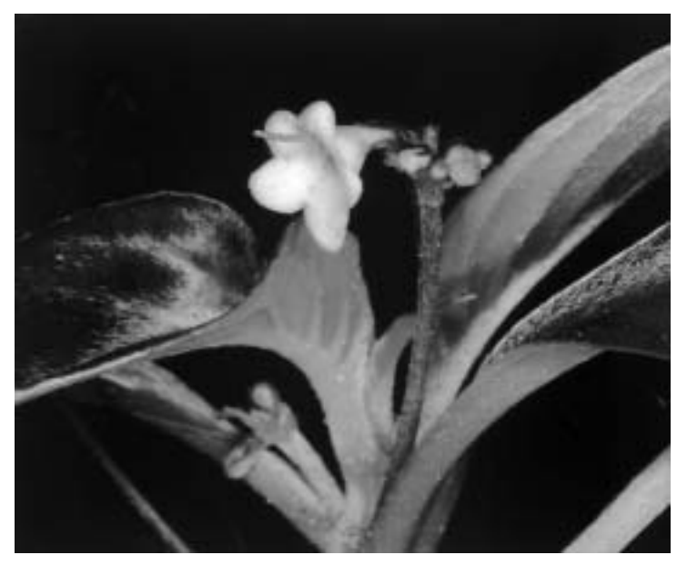
Henckelia pyroliflora from Pahang, Malaysia

Henckelia sect. Glossadenia : This new section includes a number of species characterized by a unique floral feature: a unilateral nectary held like a hand below the ovary. The form of the nectary is tongue-like (the sectional name means 'tongue-like gland'); the tip from which the nectar protrudes is rounded or trifid. Associated characters are spirally arranged leaves and condensed inflorescences (flowers/fruits with very short pedicels and therefore appearing as a dense cluster). The flowers are white, bluish or yellow, the form ranges from trumpet-shaped to short-tubed-campanulate. Distribution of the individual species is very local. Examples are H. flavobrunnea with long-tubed, yellow-brownish flowers and H. pyroliflora , with whitish, short-campanulate flowers. Both species occur in Taman Negara National Park. The section is distributed from southernmost Thailand through the Malay Peninsula and Sumatra to Borneo.