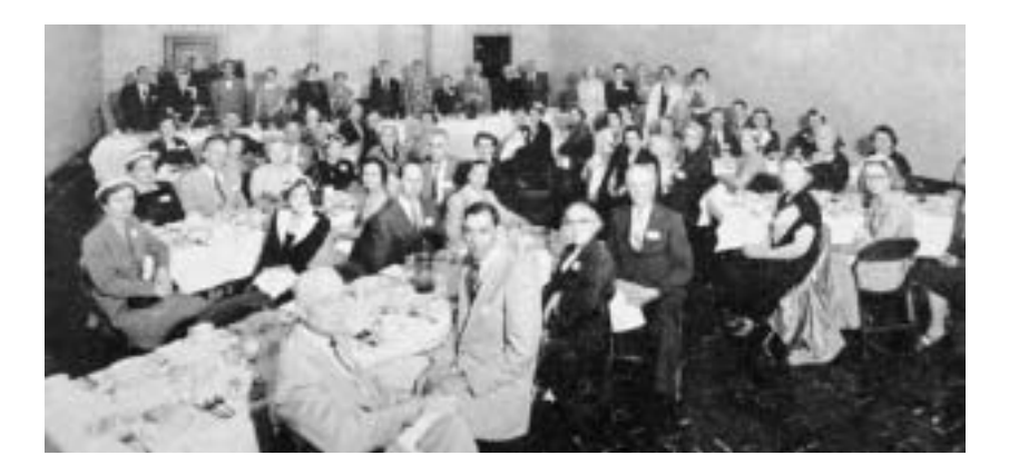
First convention attendees in Kansas City "Then" received table favors of sinningias donated by Earl J. Small's Growers as did our most recent convention attendees in Tampa "Now"