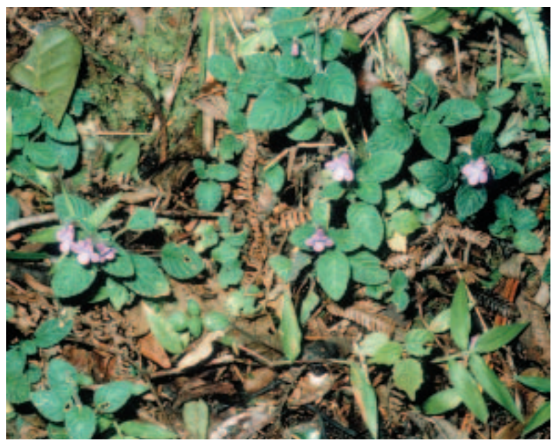
Hovanella madagascarica from Madagascar