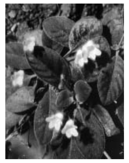
Henckelia nana from Malaysia