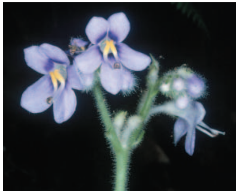
Henckelia caerulea from Perak, Malaysia