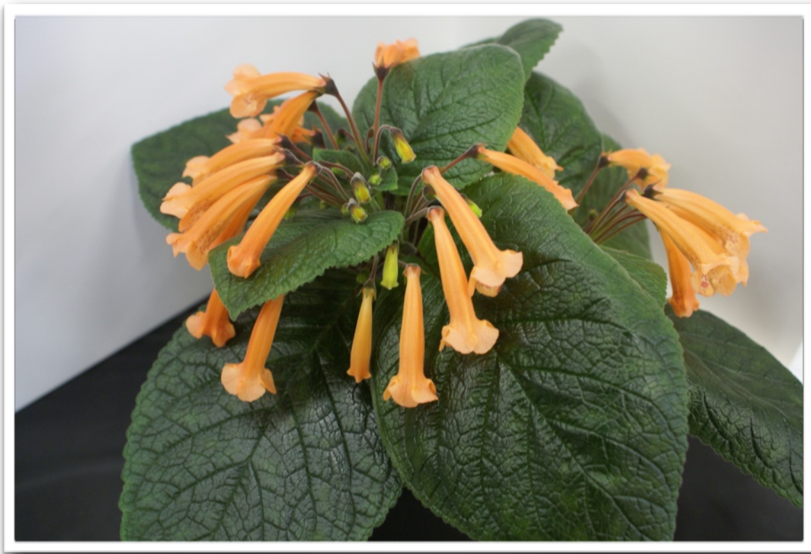
Sinningia 'Big Cal'