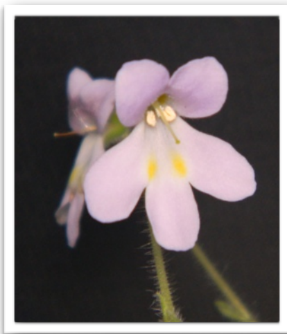
Petrocosmea 'In Rainbows'