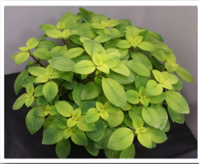
Streptocarpus 'Blueberries 'n' Cream'