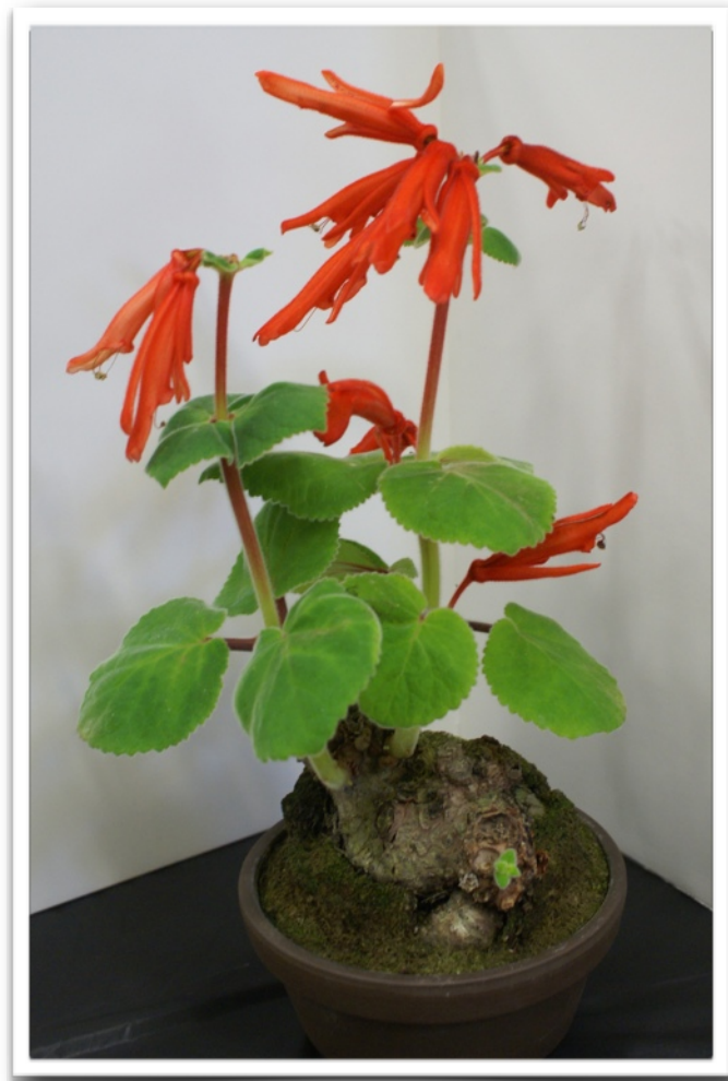
Sinningia cardinalis 'Redcoat'