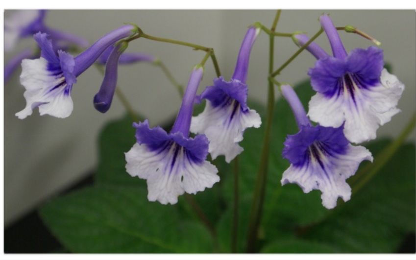
Streptocarpus 'Annabel Rae'