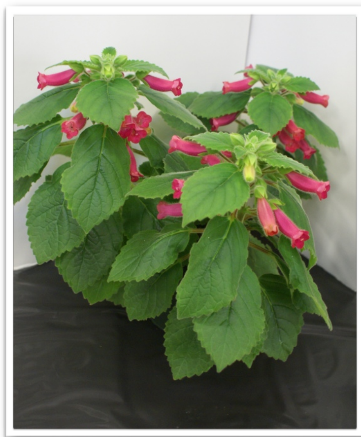
Sinningia 'Magic Moment'