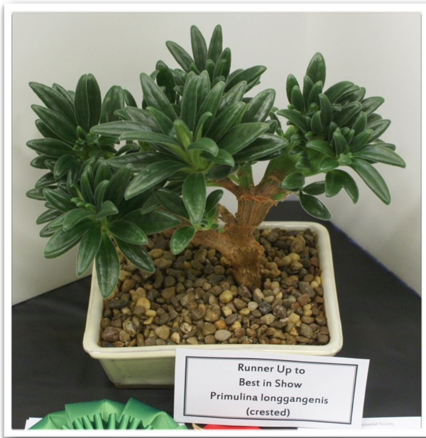
Primulina longgangensis (crested)