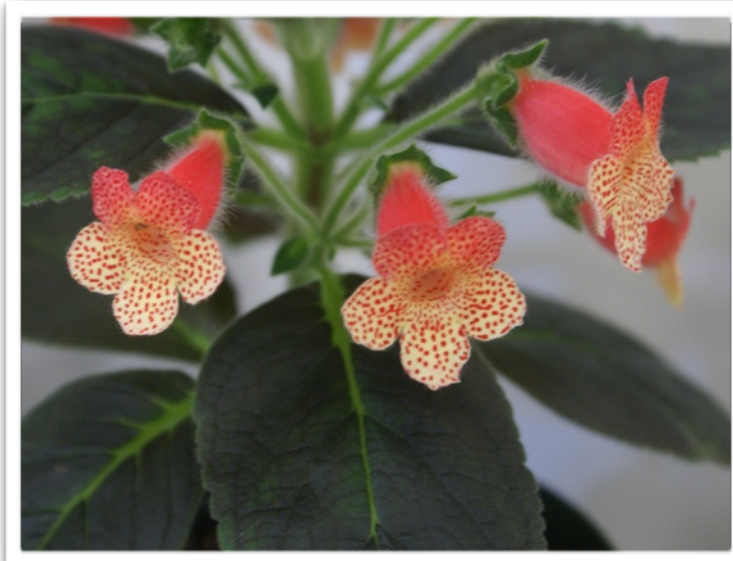
Kohleria 'Peridots Salish'