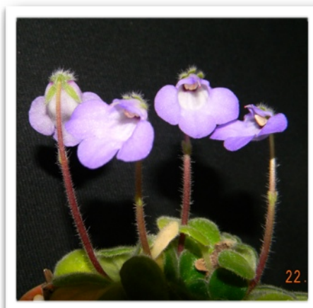
Petrocosmea 'Little by Little'