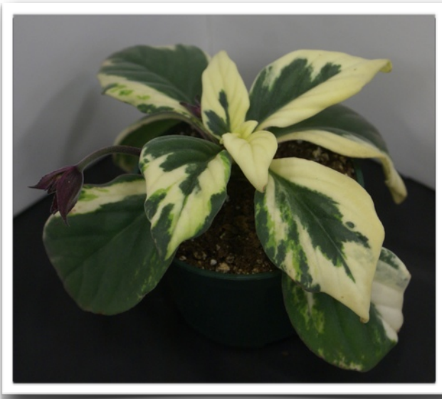
Primulina 'Aiko' (dark form, variegated)