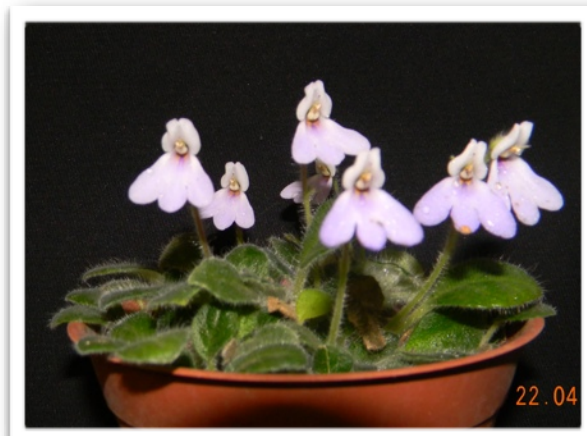
Petrocosmea 'Morning Mr. Magpie'