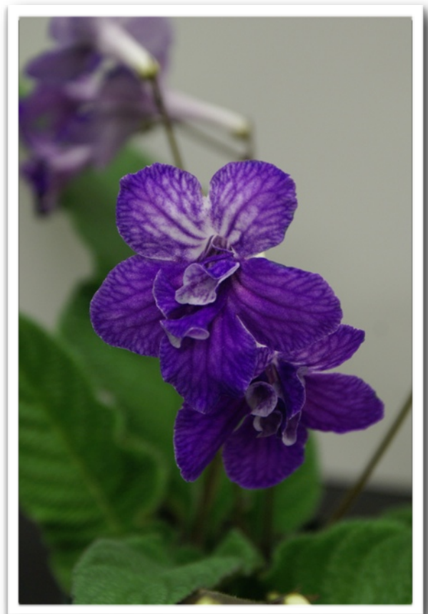
Streptocarpus 'Bristol's Hop Along'