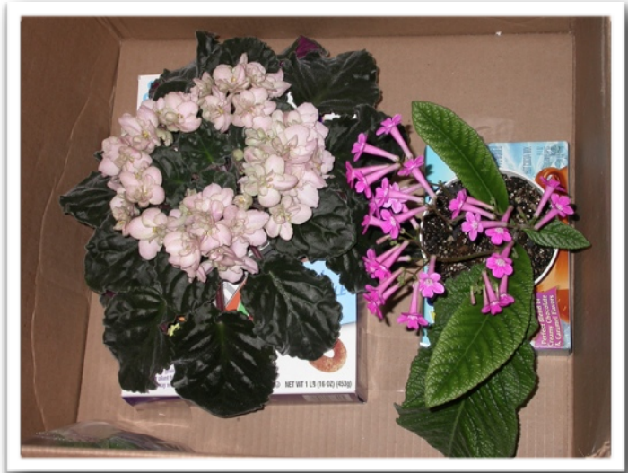
Show plants boxed for transport

Due to the very small commuter planes I must take out of my small, local airport, I will rarely be able to put a box in the overhead compartment due to the very limited height of about nine inches. I have found that a box no taller than 10 inches, no wider than 12 inches and no longer than 18 inches usually will fit under the seat of most airplanes, but that often means I have to put my purse in the overhead since the space under the seat won't accommodate my purse plus my show plants, too. Again, tape smaller boxes within the larger box and tape the pots to the smaller boxes. At the screening area, try to put your box in one of those containers that normally would hold shoes and purses. Otherwise your light box might flip over as it enters the X-ray area with its heavy plastic flaps. If security won't let you put your box in a container, then put something heavier directly behind it. I use my purse.