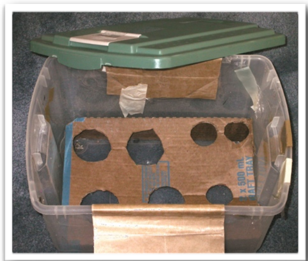
Airplane carry-on with holes cut in a cardboard flat

When traveling by air, I have found that a clear plastic box with a tight fitting lid is best because the airport security people can see pretty flowers and are often more helpful. I made handles for my box so I can carry it with one hand, but the box must be able to fit under the seat or in the overhead compartment. Web sites for the airlines are usually not very helpful about giving the sizes because there can be a variety of compartment heights and depths. In fact, they may give the total number in inches (let's say 45 linear inches) that is the height plus length plus depth. You still don't know the real height of the overhead compartment, and that's the key