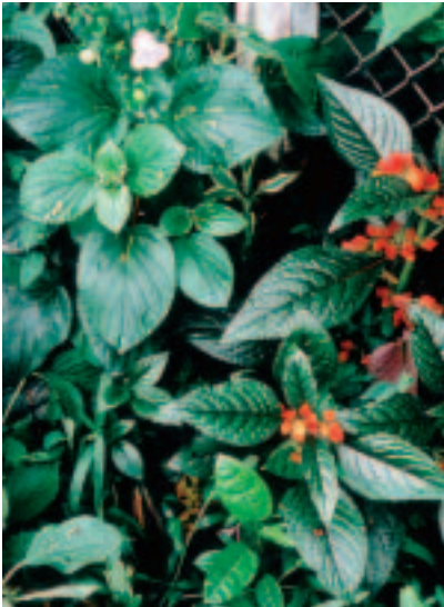
Gloxinia perennis growing in a garden in Ecuador alongside Chrysothemis pulchella