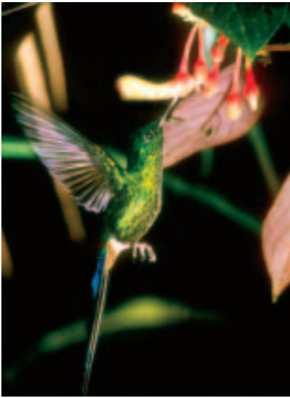
Left: Female violet-tailed Sylph ( Agelaiocercus coelestis ) robbing nectar from Alloplectus herthae Mansf.