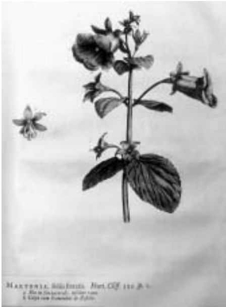
Illustration of Gloxinia perennis first published by Linnaeus as Martynia foliis ferratis in 1753

Gloxinia perennis is one of the oldest gesneriads in cultivation, seed having been sent from Colombia to the Chelsea Physic Garden in England in 1739. Linnaeus first described this plant in 1753 as a species of Martynia . ( Martynia is not a gesneriad genus, but belongs to a closely related family, the Martyniaceae. Martynia is known in the United States for its curious seed pods with long curled prongs, useful to flower arrangers, but detrimental to grazing cattle. The pods of G. perennis resemble miniature versions of those of Martynia .)