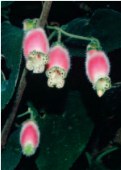
Capanea affinis Fritsch