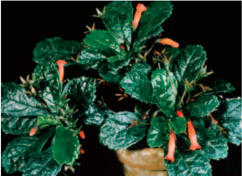
Gesneria cuneifolia (DC.) Fritsch

These photos represent only a few of the more than 60 gesneriad species names that still bear Fritsch as the authority or parenthetical authority