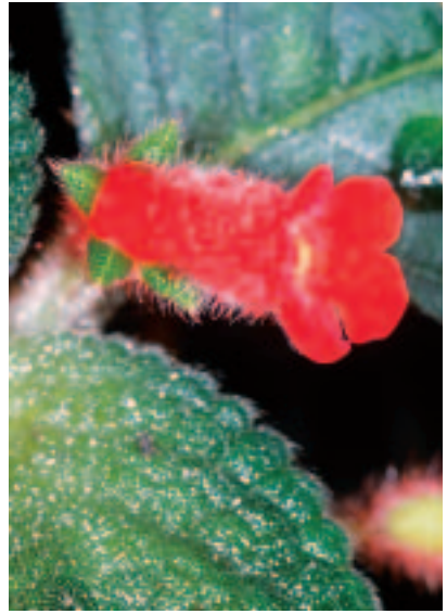
Kohleria villosa Fritsch var. villosa