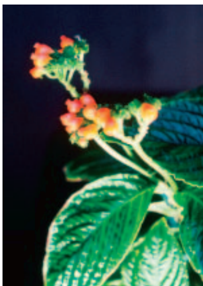
Gasteranthus corallinus (Fritsch) Wiehler