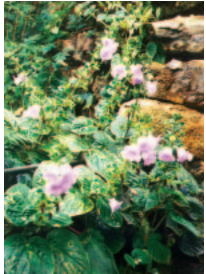
Gloxinia perennis growing in the display greenhouse at the Royal Botanic Garden Edinburgh