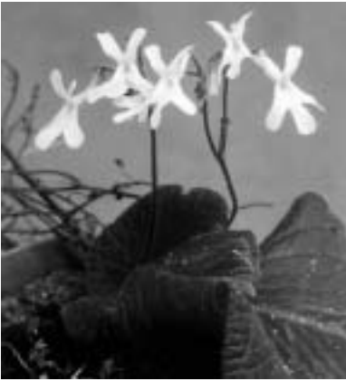
Streptocarpus penterianus Fritsch