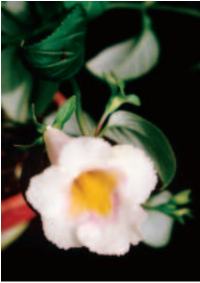
Achimenes glabrata (Zucc.) Fritsch