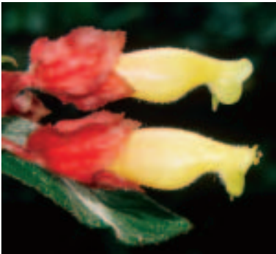
Bottom right: Drymonia crenatiloba (Mansf.) Wiehler