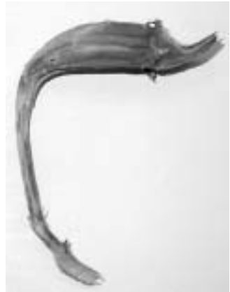
The curious seed pod of Gloxinia perennis