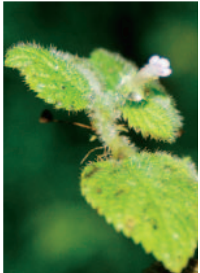
Diastema affine Fritsch