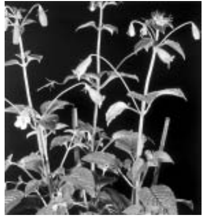
Gloxinia gymnostoma Griseb. includes Fritsch's Fiebrigia digitaliflora

noted, however, that Fritsch never visited South or Central America nor any other tropical country himself. His work was virtually exclusively based on herbarium specimens collected by participants of scientific expeditions conducted at that time. He had little knowledge of living gesneriads and, therefore, his taxonomic assessments proved not always satisfactory. Nonetheless, a good deal of his new species survived and withstood critical re-examination. In the following, some details are given regarding Fritsch's taxonomic work on Gesneriaceae.