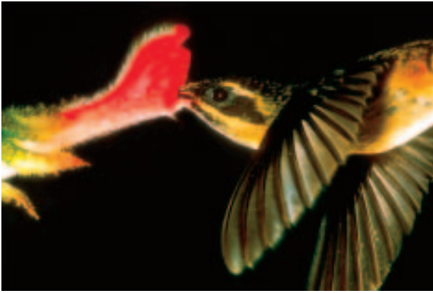
Top: Tawny-bellied hermit ( Phaethornis syrnatophorus ) visiting Alloplectus penduliflorus M. Freiberg