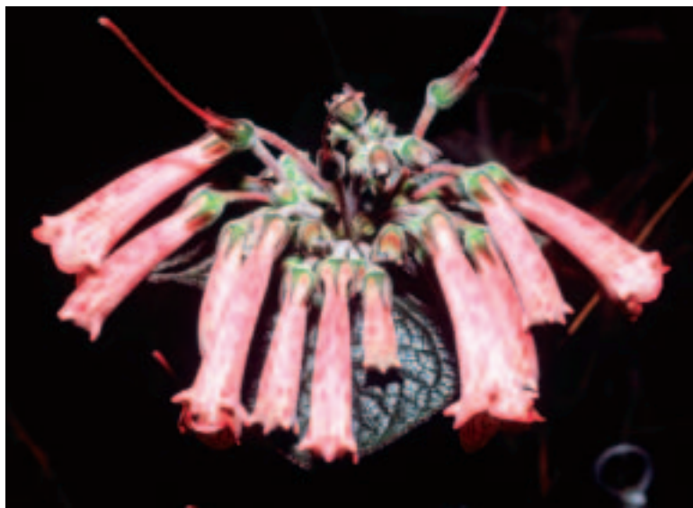
Sinningia striata (Fritsch) Chautems