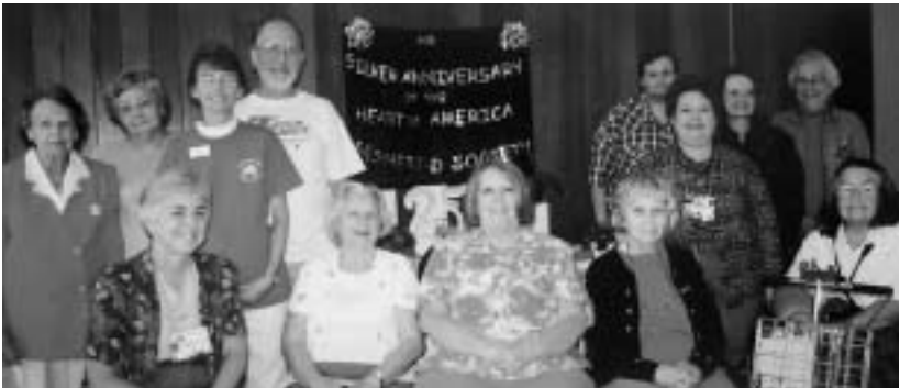
Members of the Heart of America Chapter together for their 25th Anniversary celebration

Go to www.ags.org for chapter email contacts.