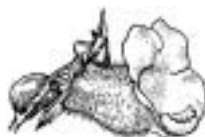
Gloxinia perennis (L.) Fritsch