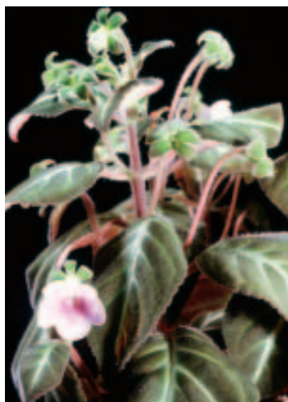
Gloxinia lindeniana (L.) Fritsch