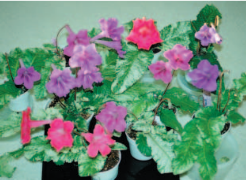
A group of variegated "Iced" Streptocarpus from Dale's first cross of S. 'Canterbury Surprise' × S. 'Winter Dreams'