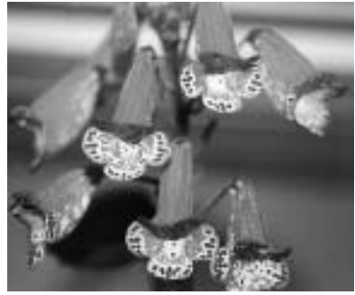
Smithiantha 'Texas Freckles'