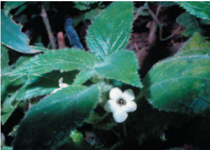
Nautilocalyx panamensis with Trigona bee