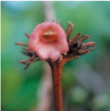
Gesneria viridiflora ssp. quisqueyana