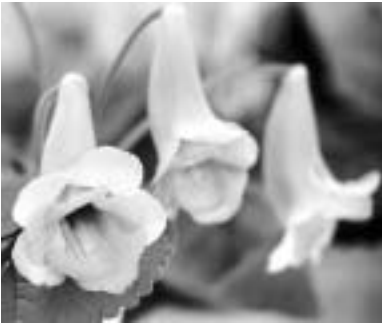
Sinningia 'Playful Porpoise'