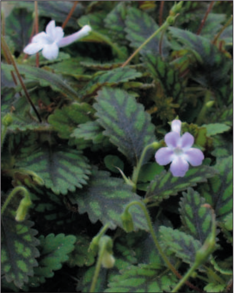
Sinningia sp. "Rio das Pedras"