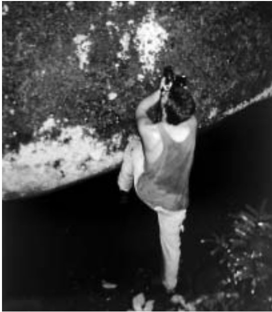
Photographing the new species