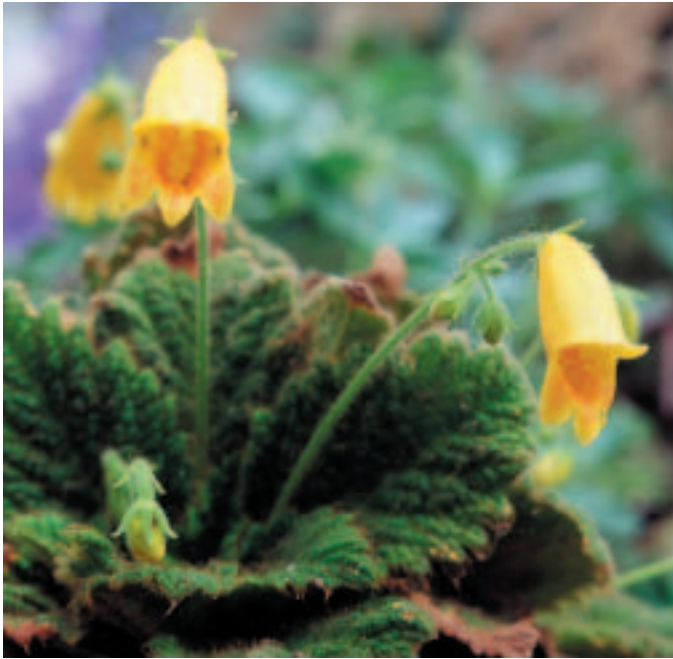
Briggsia aurantiaca (above) and Corallo-discus lanuginosus (below)