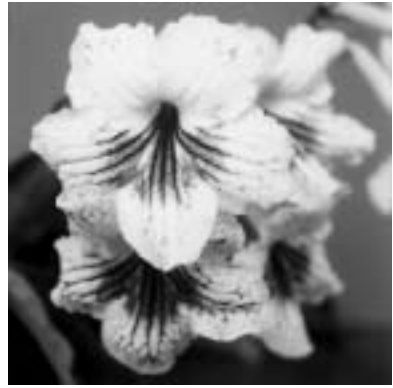
Streptocarpus 'Northwest Passage'

Rhizomatous plant, if not pinched can be 20 cm tall. Leaves hairy, dark green with reddish reverse, 4.3 cm long \times 2.5 cm wide, ovate with serrate margin and cuneate base. Calyx split, green with reddish tips, 5 mm long. Pedicel 1.5 cm long. Corolla salverform, 5 cm long \times 4.5 cm wide, pink with hint of salmon, yellow throat with magenta marking over it. Best New Hybrid 2001 AGGS Convention Flower Show.