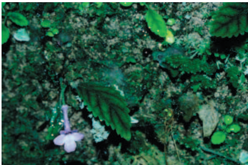
Sinningia sp. "Rio das Pedras" seedlings growing on the large granite boulder

come back. Two hours later we arrived at the place. The same environment was found there—vertical granite rocks and a stream providing naturally conditioned air to the plants.