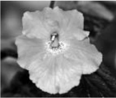
× Achimenantha 'Texas Blue Bayou'