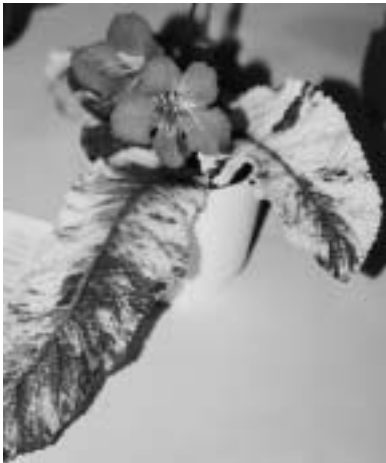
Streptocarpus 'Iced Pink Flamingo'

Streptocarpus 'Ice Wine' , 2002, IR02811, Sandra Morgan, Canada, and Dale Martens, TX. ( S. 'Canterbury Surprise' × S. 'Winter Dreams'). Cross made Aug. 2000, planted Oct. 2000 and first flowered Feb. 2001. Reproducible only vegetatively. Rosette. Leaves bullate, green and white, 22 cm long × 7 cm wide, linear with crenate margin, acute tip and cuneate base. Calyx split, green with purple tips, 1 cm long. Pedicel 12 cm long with 1 or 2 flowers. Corolla salverform, 7.5 cm long × 6 cm wide, red-lavender (RHS 78) sometimes streaked with RHS 78C, white throat with dark lines on lower three lobes. First published 2001, Crosswords , Vol. 25 (3), color insert.