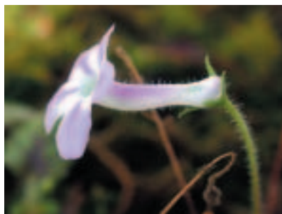
Sinningia sp. "Rio das Pedras"

I brought some little tubers back and planted them in live sphagnum moss. They responded very well to greenhouse culture, and three months later I was able to see the first flowers. It was amazing to see the plants differ from one another. The growth habit and the flowers are similar to Sinningia pusilla , but the leaves are quite a bit larger and the flower does not have any kind of spur. The leaf variegation is quite attractive and can range from some thin black veins to almost an entire black leaf. Even the flower markings and colors were remarkably different from one another. The plants set seed easily, and I was able to bring about 50 packets of seed to the 2002 Convention in New Jersey. Six months later at the time of writing this article, I have received feedback from several growers who obtained seed that many plants have already flowered... and soon we will have hybrids with this lovely new species.