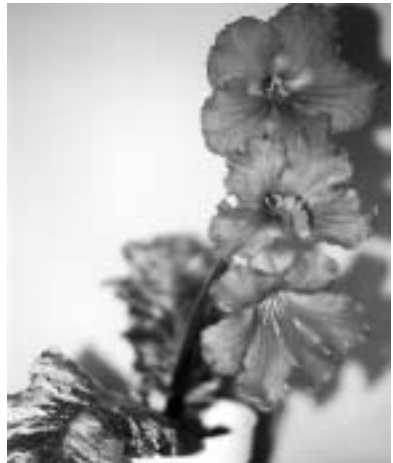
Streptocarpus 'Ice Wine'