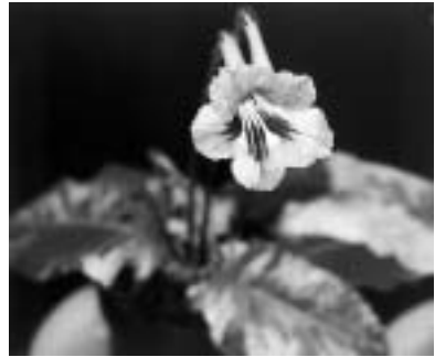
Streptocarpus 'Canterbury Surprise'

Smithiantha 'Big Dots Rule' , 2002, IR02806, Dale Martens, TX. ( S. 'Duet' × S. 'Sassy Redhead'). Cross made Nov. 1999, planted Feb. 2000 and first flowered Sept. 2000. Reproducible only vegetatively. Rhizomatous, erect to 35 cm tall if not pinched. Leaves dark red-green, densely covered with red hairs, 15 cm long × 10 cm wide, with 5 cm petiole, ovate with serrate margin, acute tip and cordate base. Calyx split, red-green, 6 mm long, pedicel 3.8 cm long. Corolla salverform, 4.5 cm long × 2.5 cm wide, outer tube is white or pale magenta, face of tube white with huge magenta dots.