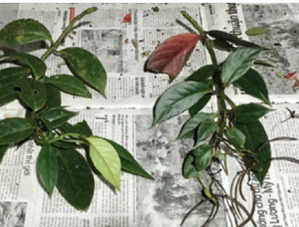
Lysionotus aeschynanthoides (Conservation Status: Data Deficient).

paucinervis , a perennial rhizomatous herb