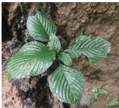
Tetraphylloides confertiflora , found at Trurong Son.

After these meetings, we typically would chat with the staff and make plans for the day. They were always so protective and would send one or more Forest Rangers to guide us. Today they checked out our footwear, making sure we were prepared for leeches; they even brushed them with liquid repellent to keep the leeches off. Pant legs were tucked into socks for those who were not already wearing special anti-leech socks.