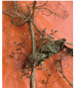
Rhynchotechum longipes , a medicinal gesneriad found dried at a roadside pharmacy near Love Falls.

Afterward, we started climbing up a very slippery, wide stream-bed made of massive flat rocks. Soon we