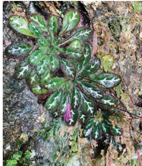
Primulina huulienensis .

This find resembles Microchirita limbata ; however, the inner corolla of M. limbata is glandular (has hair-like structures) while the inner corolla of the plant we collected is glabrous (lacking surface ornamentation, smooth, without hairs of any kind). A new variety for now.