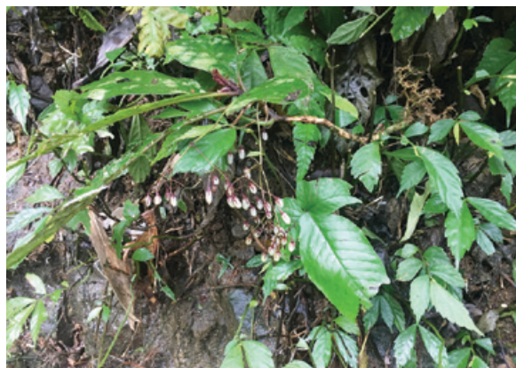
Rhynchoetechum longipes with fruits, near Tu Son Waterfalls.

karst mountains in north and central Vietnam. As we drove on, it was shocking to see bulldozers taking down karst mountains to be used for road fill. Perhaps a home for some unique gesneriads was just being destroyed?