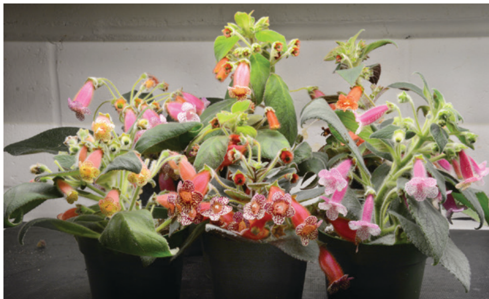
Group photo of blooming seedlings

I hope other clubs and members embrace opportunities... and then share their bounty with the rest of us