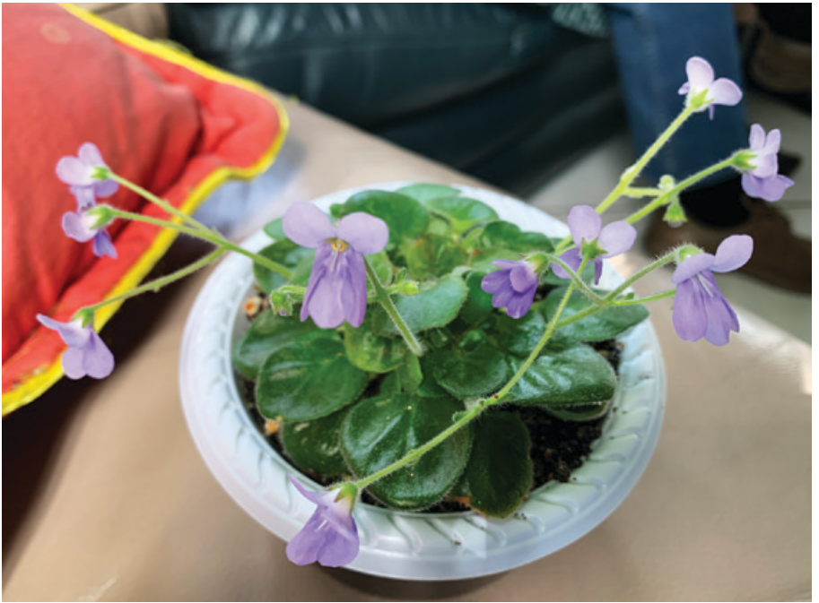
Petrocosmea (unknown lineage)