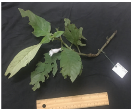
Raphiocarpus species, perhaps new, commonly found in our travels in Tam Dao but not listed in the Flora of Vietnam.

A dizzying series of stone steps led us higher and higher up the mountain path through temples and heavily forested areas, very diverse environments with over eight different forest types. Along the route I even got to meet “Ton Ngo Khong,” a Monkey god, king, and man, who appears in the classic Chinese novel, Journey to the West , later adapted into a popular film. He’s a combination of Shakespeare’s Puck, Robin Hood, and Hell Boy, representing the inner strength that all humans embody.