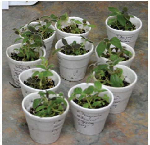
Seedlings ready for distribution

When I reached twenty plants with flowers, I invited Clay over to my house