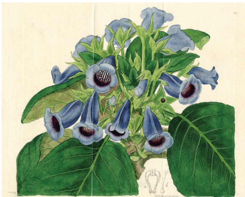
This botanical illustration of Sinningia speciosa is an example of what can be found on the GRW.