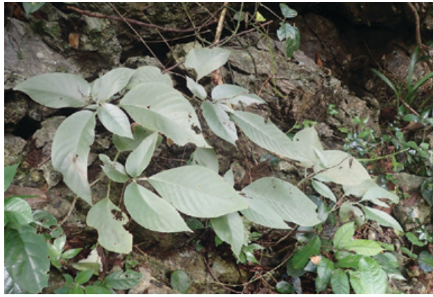
Pseudochirita guangxiensis var. glauca at Huu Lien, in the Huu Lung Protected Area.