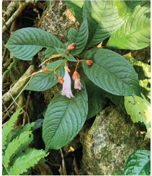
This should be a species of Anna, looking most similar to Anna submontana, but with some differences so it needs further study. Found at Ngoc Son-Ngo Luong Nature Reserve.

myself on the jagged rocks but could not find a tear on my hiking pants. Then I remembered that I had a red-colored energy drink in my packsack and I was sure I had punctured it, but, no, it was intact. OMG! I must have been bitten by a leech even though I had sprayed my feet and all open surfaces with OFF!®. My socks were over my pant legs, so I could not imagine how it got in. My hiking pants have zippers at the knees so you can turn them into shorts. I soon discovered that where the zipper closes, there was a very tiny opening, perhaps smaller than an eighth of an inch, but big enough for that leech to get in. After feasting, it could not get out. Back at the van, I stripped and cleaned up the wound and put a bandage on it. I survived my first leech bite! I had been so apprehensive about it because I usually faint at the sight of