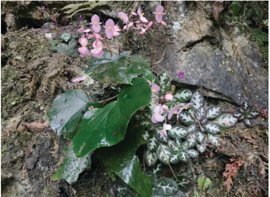
Perfect companion plants: Begonia langsonensis and the new species Primulina huulienensis in Huu Lien, Huu Lung Protected Area, Lien District, Lang Son.

We then found a fantastic gesneriad with red hairs growing under Begonia langsonensis – a perfect example of companion plants. (This new find has recently been published as Primulina huulienensis with a CS of CR.) If that wasn't enough, we then came across some adorable plants in the genus Microchirita with the most intense purple flowers. These may represent a new variety or species. We were all using social media, but Wen