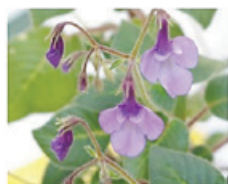
Streptocarpus subgenus Streptocarpella