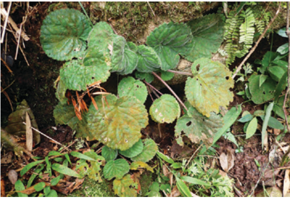
Gyrocheilos chorisepalus growing on Phat Chi Mountain, Mau Son, Lang Son, Vietnam.