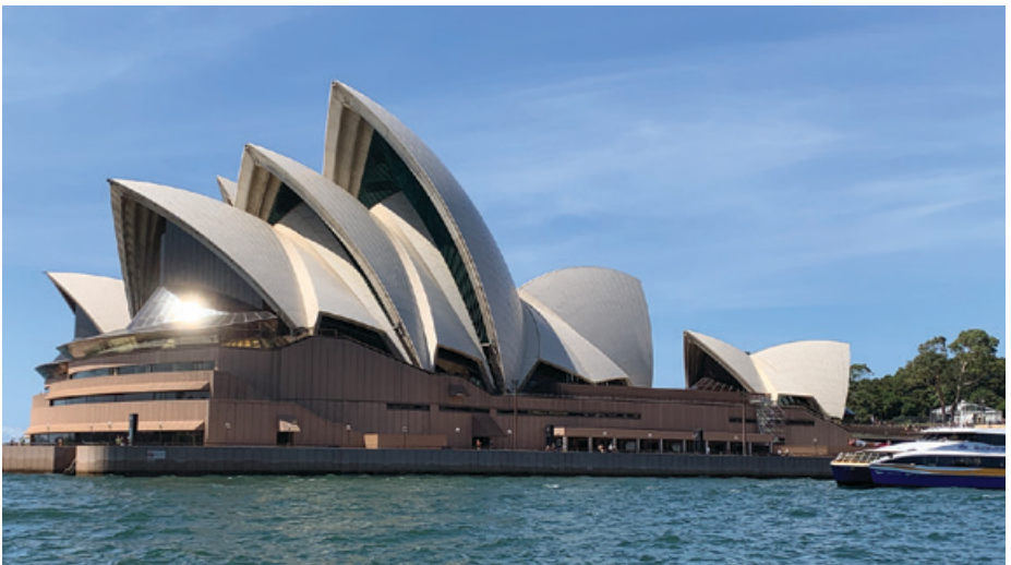
The gleaming Sydney Opera House in the bay.

A wonderful fernery with a high arched roof supported by columns was planted with tree ferns and other shade-loving plants including Begonia thiemie and Achimenes hybrids. The garden had a plant sale put on by volunteers 11 a.m. to 2 p.m. most days. The selection was very exquisite.