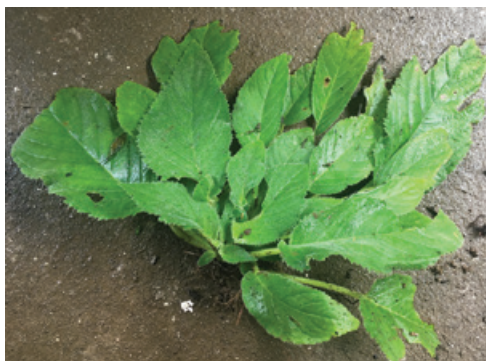
Henckelia ceratoscyphus , at Tu Son Waterfalls.

We spent the next day traveling to Thuong Tien Nature Reserve (Kim Boi district, Hoa Binh province). Before we left the hotel, we admired some of the fruit trees in the garden, including carambola (star fruit) and pomelo ( Citrus maxima ). The latter is the largest citrus fruit and is native to Vietnam. On our drive to the Thuong Tien Nature Reserve, we stopped by some caves as was our habit. We spotted a long Elaphe moellendorffi , also called Moellendorf's, the flower, or rat snake. They are known to live in the