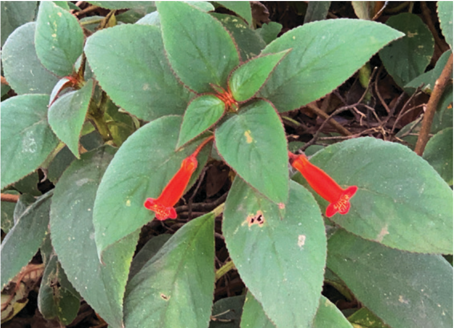
Kohleria eriantha (Hort)