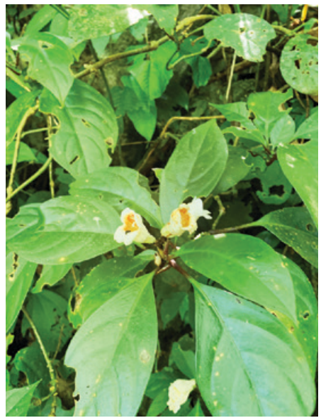
Anna sp. aff. submontana may be a new species but needs further research. Found at Ngoc Son-Ngo Luong Nature Reserve.