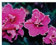
Streptocarpus section Saintpaulia