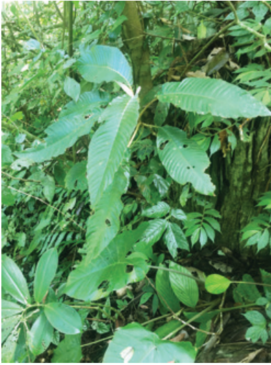
Paraboea sinensis , a subshrub found at Ngoc Son-Ngo Luong Nature Reserve.