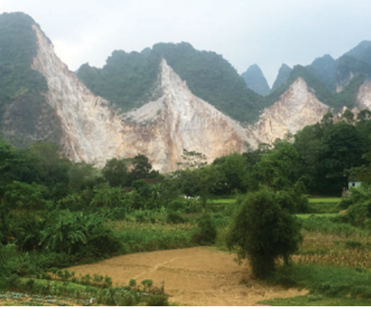
Total destruction! Karst mountains bulldozed to create fill for building roads. Habitats destroyed even before being explored.