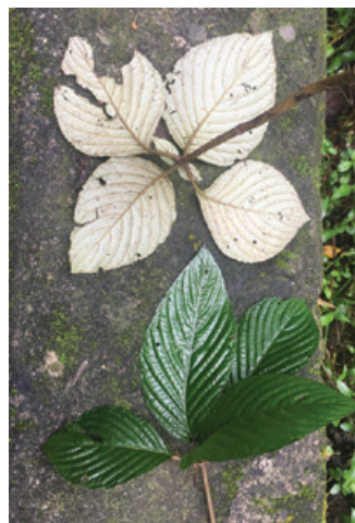
Tetraphylloides confertiflora (showing underside and top of leaves), found at Trurong Son.

Today we found Henckelia ceratoscyphus ; Rhynchoetechum longipes , a subshrub (CS is LC); and a Paraboea species. Afterward, we headed to our hotel for the evening ritual of pressing plants, followed by dinner and drinks.