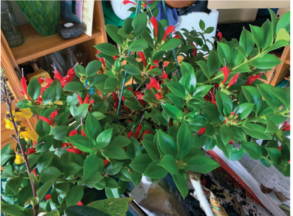
Titanotrichum oldhamii (left) and Aeschynanthus humilis hybrid (right)