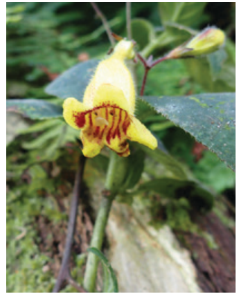
Loxostigma dongxingense (=former Briggsia dongxingensis ) growing on Phat Chi Mountain, Mau Son district, Lang Son province, northeast Vietnam.

whose presence is recalled by some historic villas and abandoned buildings. Mau Son is the place to go to when you need to get away from the tropical heat. We stayed in a beautiful, old, decaying yet elegant stone structure surrounded by gardens. In the area of Phat Chi Mountain (Mau Son, Lang Son province), we found four notable gesneriad species.