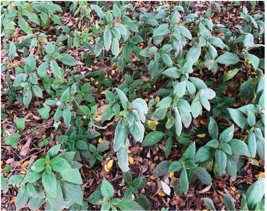
A large colony of Kohleria eriantha at the Royal Botanical Garden, Sydney