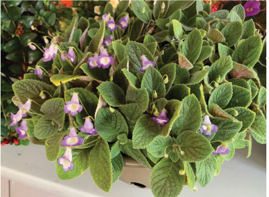
Rhizomatous hybrid involving Eucodonia ; exact parentage unknown