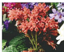
Streptocarpus subgenus Streptocarpus