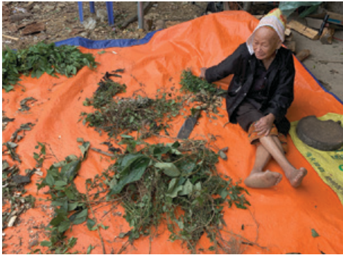
Roadside pharmacy of medicinal plants for sale, including the gesneriad Rhynochotechum longipes .

found the same Rhynochotechum longipes growing along the trails. We collected some specimens for various herbarium collections in Vietnam and China.