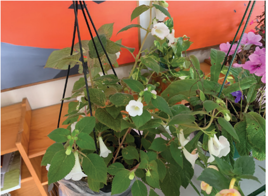
Achimenes dulcis , a species