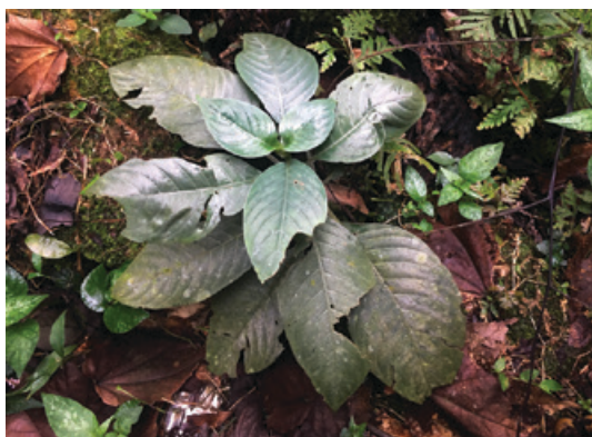
Pseudochirita guangxiensis var. glauca , found at the Ba Vi National Park.

A dizzying series of stone steps led us higher and higher up the mountain path through temples and heavily forested areas, very diverse environments with over eight different forest types. Along the route I even got to meet “Ton Ngo Khong,” a Monkey god, king, and man, who appears in the classic Chinese novel, Journey to the West , later adapted into a popular film. He’s a combination of Shakespeare’s Puck, Robin Hood, and Hell Boy, representing the inner strength that all humans embody.