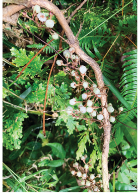
Rhynochotechum longipes , with fruits, at the Mau Son (Love Falls) Protected Forest Area. This is the very first scientific record of this plant for Vietnam.