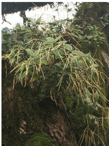
Lysionotus pauciflorus , a common small shrub, found in the Ba Vi National Park.