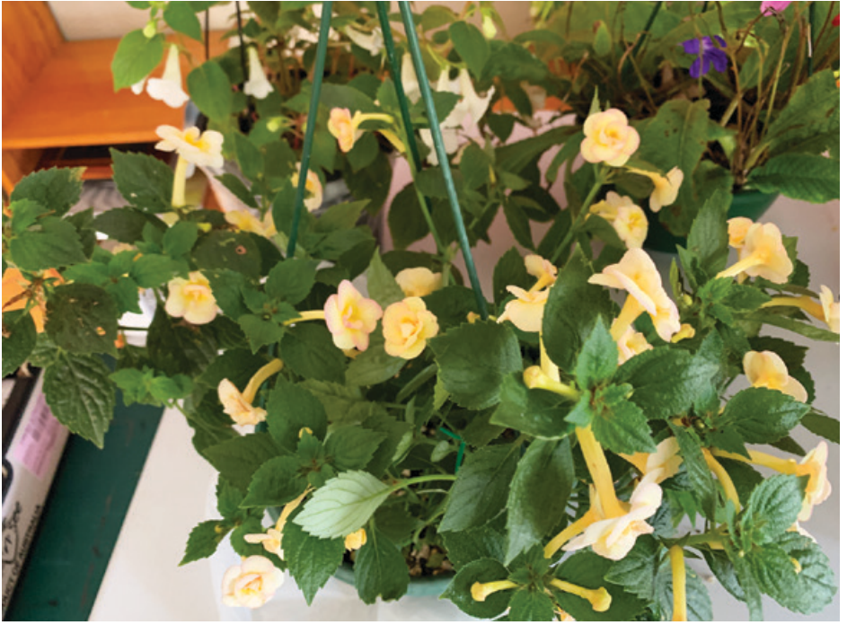
Double Achimenes 'Yellow Fever'