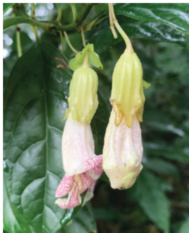
Lysionotus chingii , found in the Ba Vi National Park.

Soon we were off for what some signs characterized as “BioFun” or exploring nature. We passed by decaying doors and elegant palace-like structures, side by side, as we took a short walk from the hotel to the park. To enter the park, we followed a path under tented walkways filled with smoky food stands.