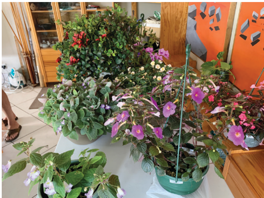
Some of Elizabeth's beautiful blooming gesneriads