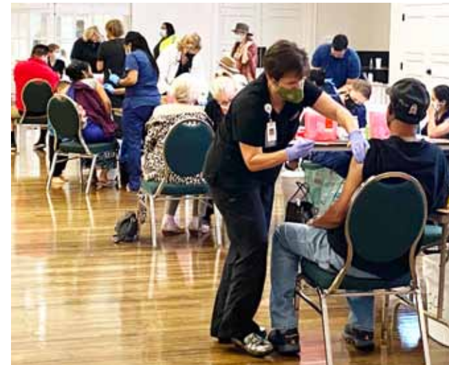
The Chamber and its business and nonprofit partners hosted Community Vaccine Day in October 2021. Healthcare workers administered 300 COVID Vaccines/Boosters and 300 Flu Shots to a diverse group of people from across the community. The HealthSmart Wellness Expo is October 5 (7:30am- 1:30pm) at Lanier Technical College Ramsey Conference Center.

The Workforce Development Task Force , in its sixth year, reached a new milestone with dozens of Work Based Learning students working at some 30 area industries. Youth Apprenticeship programs for high school students continue to grow and combine academic and technical classroom instruction with work experience.