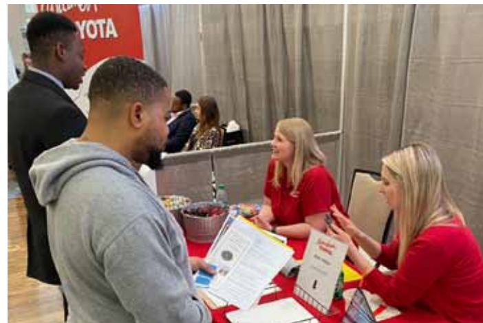
Eighty-nine (89) employers participated with onsite hiring at the Greater Hall Chamber's Spring Job Fair on March 30. The Chamber's Fall Job Fair is Thursday, September 8 (10am-2pm) at the Gainesville Civic Center and will feature dozens of local companies that are hiring.