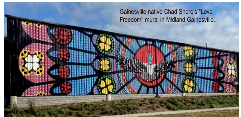
Gainesville native Chad Shore's "Love Freedom" mural in Midland Gainesville.