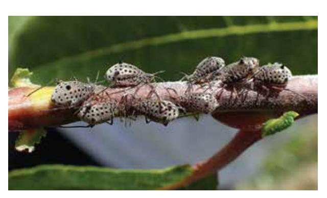
Mature giant willow aphids (~6 mm in length) feeding on a willow stem.

A beneficial parasitic wasp from California could help to combat the giant willow aphid in New Zealand.