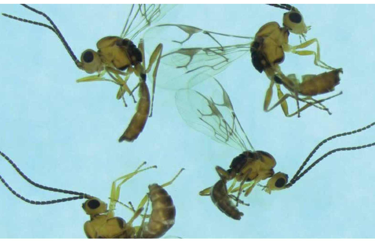
Pauesia, the beneficial parasitic wasp that kills giant willow aphids (3-4 mm in length).