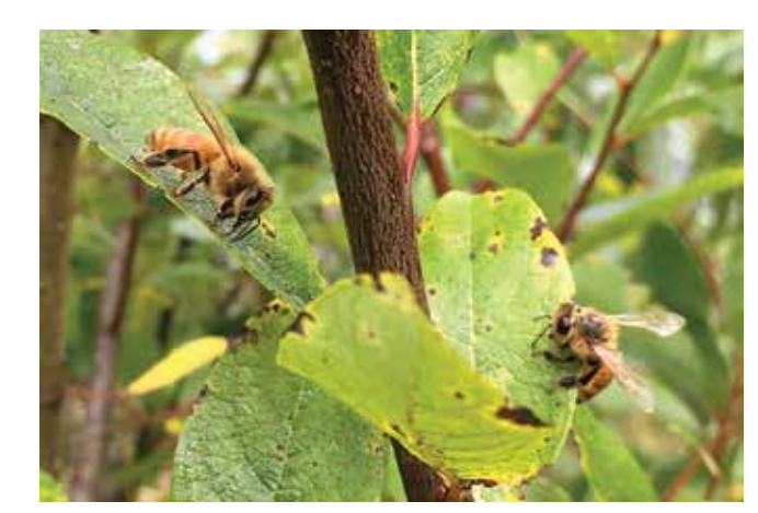
Honey bees harvesting giant willow aphid honeydew.