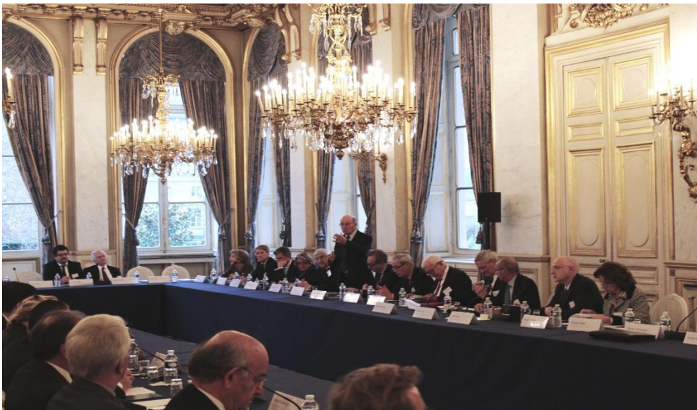
Left: Lord Simon of Highbury addresses the plenary during his welcoming remarks

The security of the region will not improve without Turkey's active involvement, many European