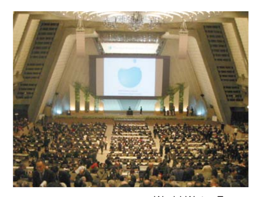
World Water Forum

To this end, the Institute has conducted researches and surveys in the field of international systems from long-term and broad perspectives and explored the way to build a sustain-