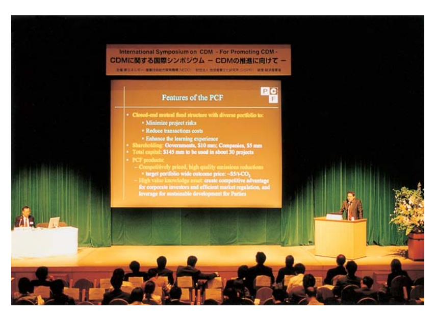
International Symposium on CDM - For Promoting CDM -

If the humanity continue to deteriorate global environment and consume exhaustible natural resources, the social system developed throughout the history might be on the brink of disruption as portrayed by a dire prognostication. The environmental deterioration and resource exploitation result from the persistent pursuit of economic prosperity by developed countries and rapid economic growth by emerging countries. To resolve the crisis, it is essential to attain sustainable development that will allow us to conserve the global environment and resources in harmony with economic and social development. The international community has gained its momentum to