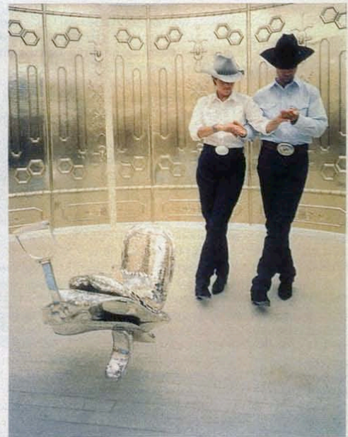
"Cremaster 2," which was shot as high-definition television and then transferred to 35-millimeter film, cost $1.7 million and is Barney's largest undertaking to date. More dots to connect: on the left, Gary Gilmore's first victim; on the right, dancing the two-step.