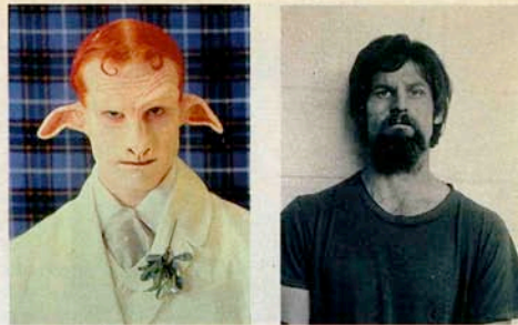
Barney as the Queen's Giant in "Cremaster 5," far left, and as the Loughton Candidate in "Cremaster 4," above left, and Gary Gilmore in "Cremaster 2." Given his mythological muse and his plan for a cycle of works, he has been called the Wagner of contemporary art.

'If a work is shown too many times, something gets stolen from it,' Barney says. 'You come to it with preconceptions, or you get tired of it. ... So I try to protect myself and my work. I want there to be a fraction of the art that even I don't understand.'