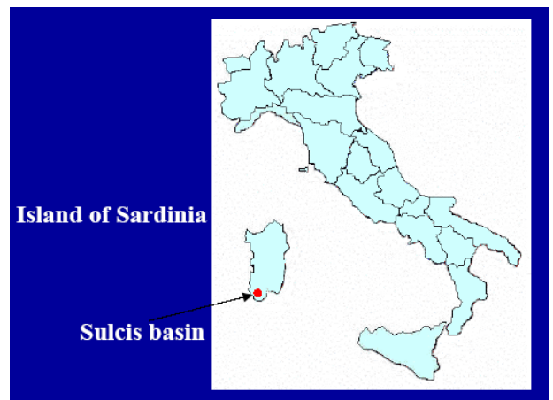
Figure 18-1. The Only Underground Coal Mine in Italy