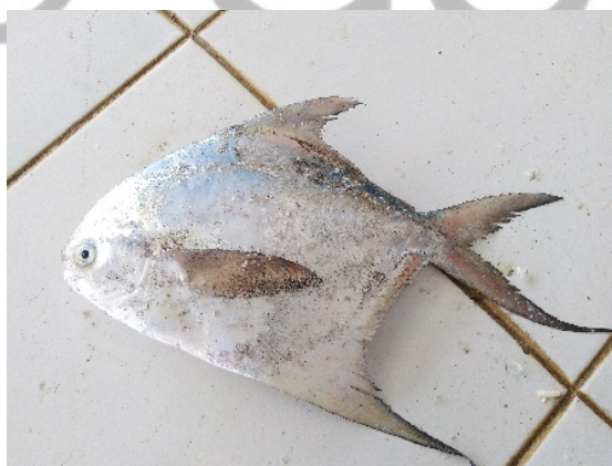
Figure 1 Silver pomfret ( Pampus argenteus )

Catches are classified into two types, namely main catches and bycatches [20]. The main catch is all species that are the main target in capture and have high economic value. Whereas bycatch is all species outside the main catch that can be utilized. The economic value of the bycatch is lower than the economic value of the main catch. Silver pomfret (Fig. 1) is a type of demersal fish that affects the gillnets used, in this research the gillnets used are bottom gillnets. The gillnets used to catch white pomfret have 2 kinds of mesh sizes, which are 4.5 and 5 inches in length with a net length of approximately 50 sets with 1 set length reaching 4-5 meters.