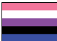
Gender Fluid Flag

Start visibly signaling how you're going to be a trans ally.