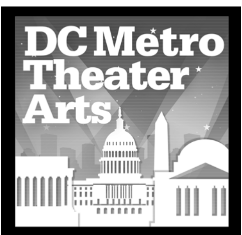
More local performing arts coverage than you'll find anywhere else.

708 Montgomery Street Laurel, MD 20707 240-568-0452 guerrant@umd.edu