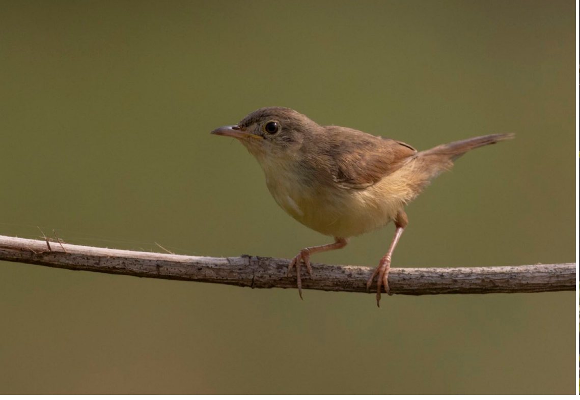
Short-winged Cisticola (above) and Black Coucal © Don MacGillivray