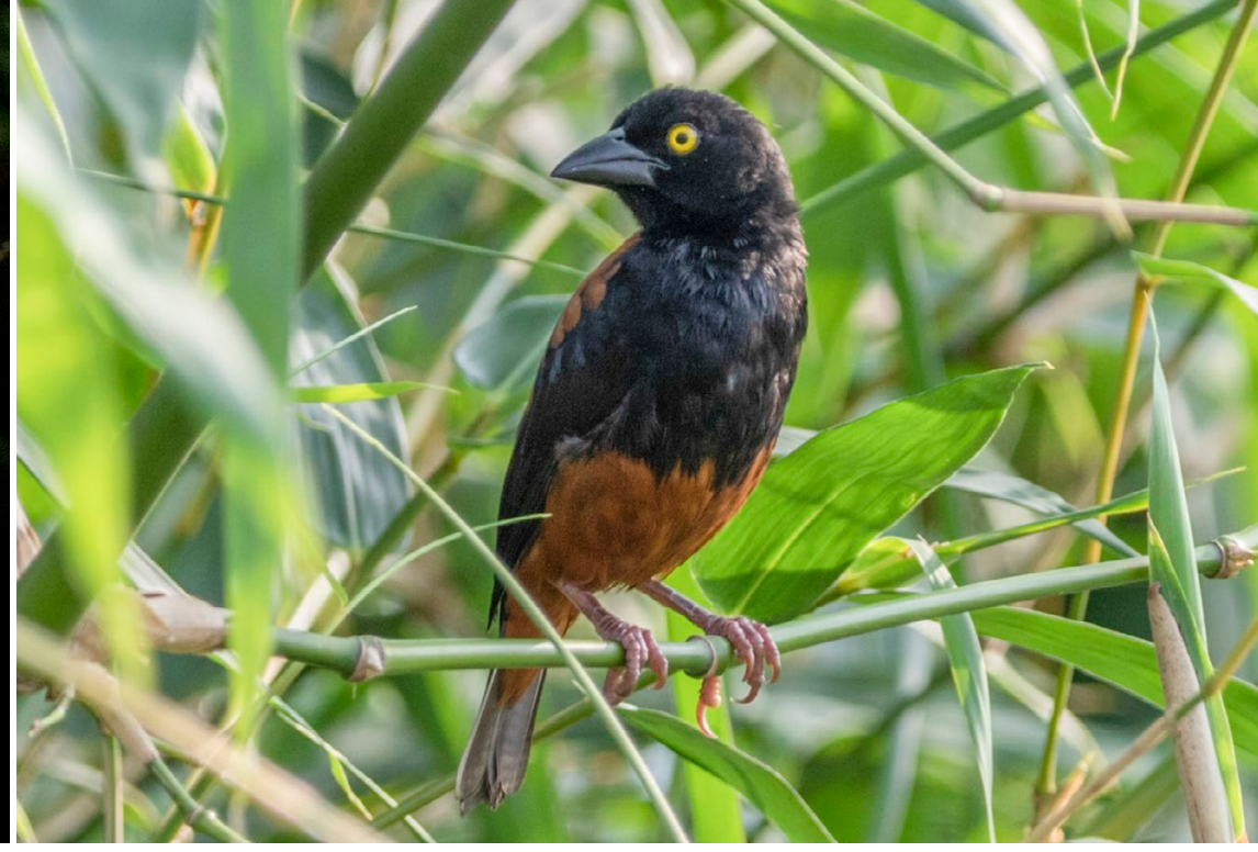
Chestnut-and-black Weaver (above) and Blue-breasted Kingfisher © Don MacGillivray