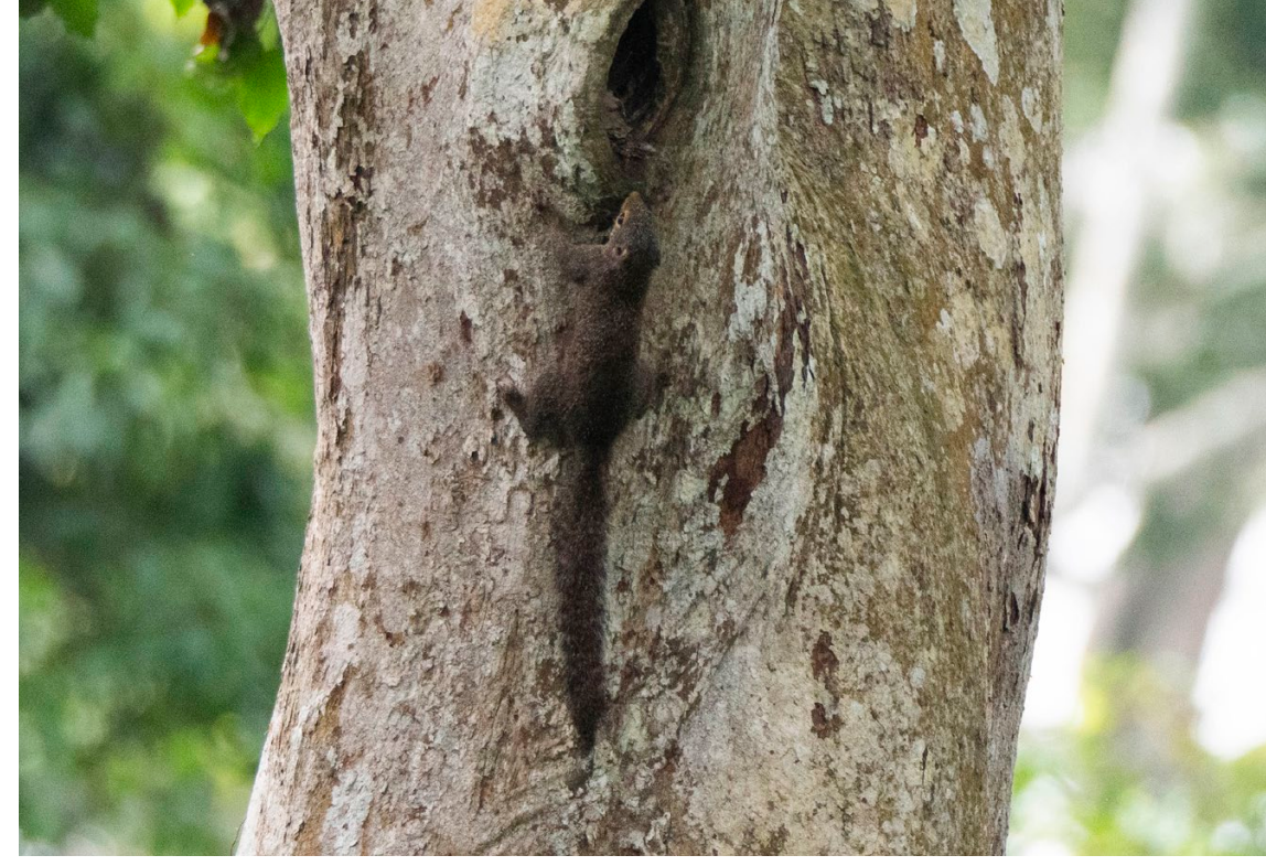
Small Sun Squirrel (above) and African Giant Squirrel (below)

Buffon's Kob Kobus [kob] kob — Seen at Mole.