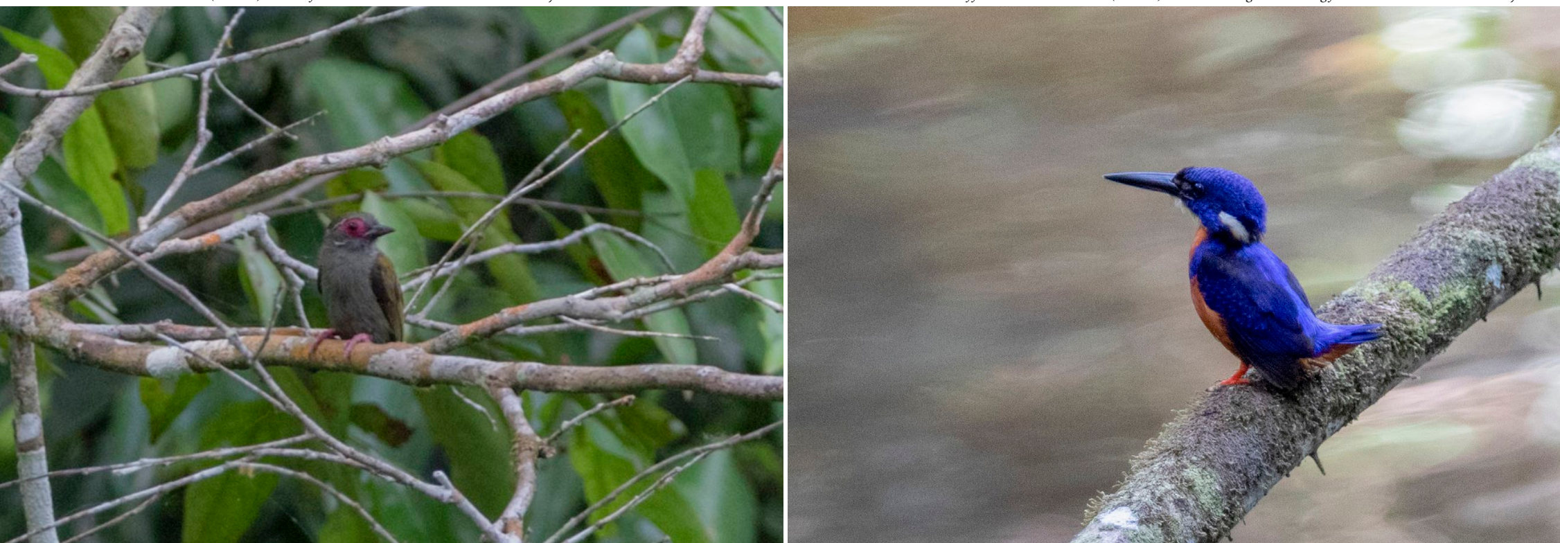
Buff-throated Sunbird (above) and Shining-blue Kingfisher