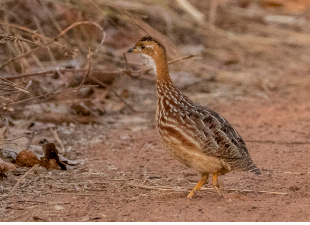
White-throated Francolin

highlights included Black-billed Wood Dove, Red-necked Buzzard, Pearl-spotted Owlet, Green Wood Hoopoe, Black Scimitarbill, Abyssinian Ground Hornbill, Abyssinian Roller, Broadbilled Roller, Grey-headed Kingfisher, Bruce's Green Pigeon, Namaqua Dove, Fine-spotted Woodpecker, Bearded Barbet, Senegal Parrot, Senegal Batis, Grey-headed Bushshrike, Whitecrested Helmetshrike, Yellow-billed Shrike, Woodchat Shrike, Brown-backed Woodpecker, African Golden Oriole, White-shouldered Black Tit, Pied-winged Swallow, Singing Cisticola, Dorst's Cisticola, Rufous Cisticola, Senegal Eremomela, Red-winged Warbler, Yellow-bellied Hyliota, African Spotted Creeper, White-fronted Black Chat, Western Violet-backed Sunbird, Pygmy Sunbird, Beautiful Sunbird, Purple Starling, Chestnut-crowned Sparrow-Weaver, Heuglin's Masked Weaver, Northern Red-headed Weaver, Red-winged Pytilia and Brown-rumped Bunting. Around watercourses and in associated gallery forests and thickets we added Melodious Warbler, Violet Turaco, Senegal Coucal, Greater