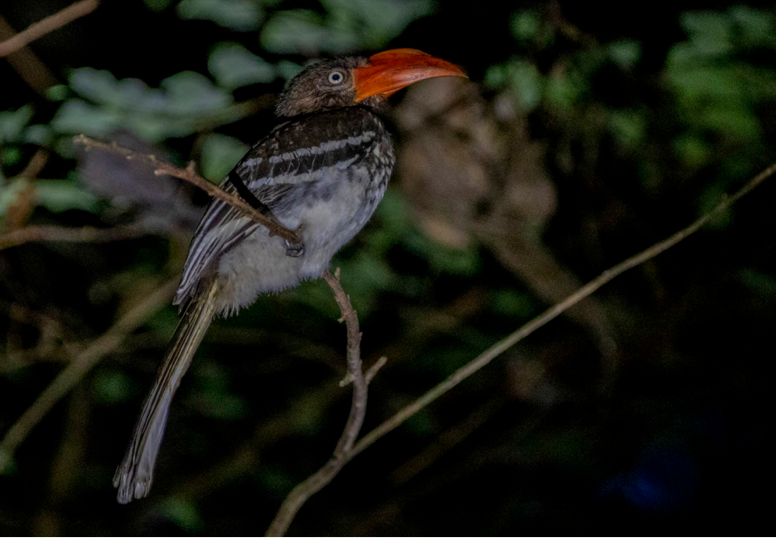
Red-billed Dwarf Hornbill (above) and White-headed Wood Hoopoe