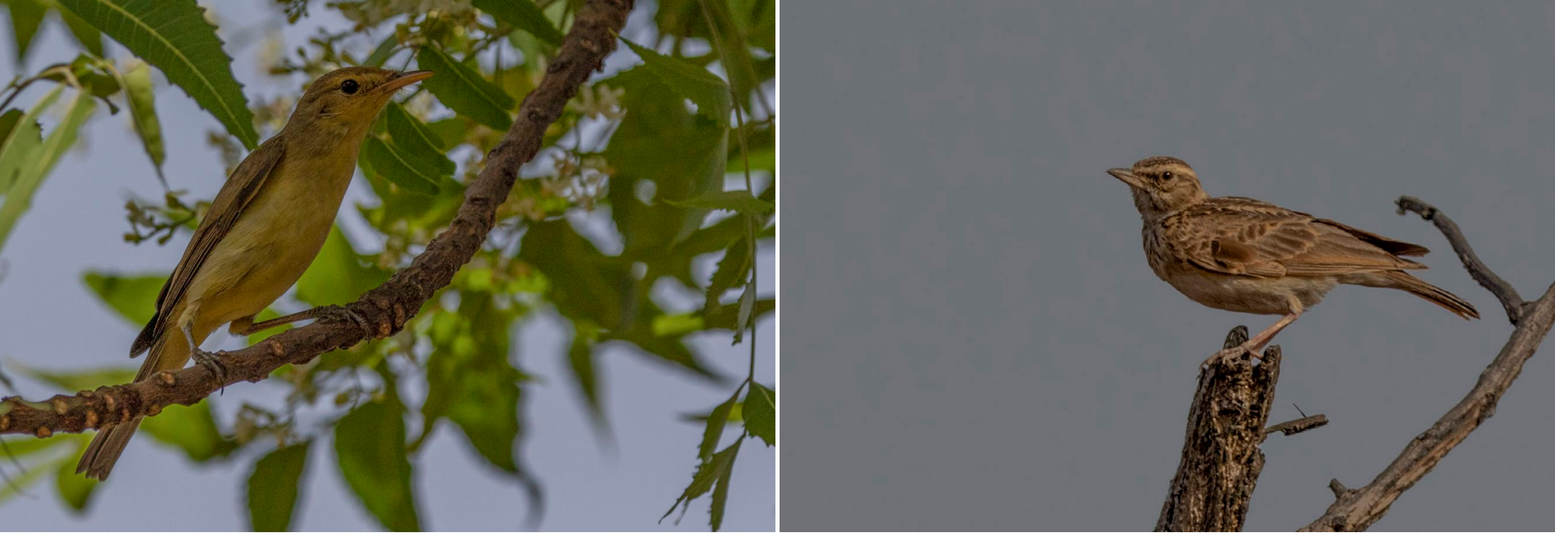
Melodious Warbler (above) and Red-winged Warbler