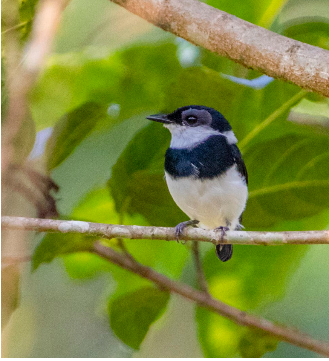
West African Wattle-eye

All that remained was to return to Accra, with an overnight stop at Takarodi. We paused again at the Ebi River, this time finding a Northern Shoveler among a flock of White-faced Whistling Ducks . We also stopped briefly along the coast to admire several African Royal Tern and Western Reef Heron . Our final stop was along the Brenu Beach Road where a couple of hours of birding brought