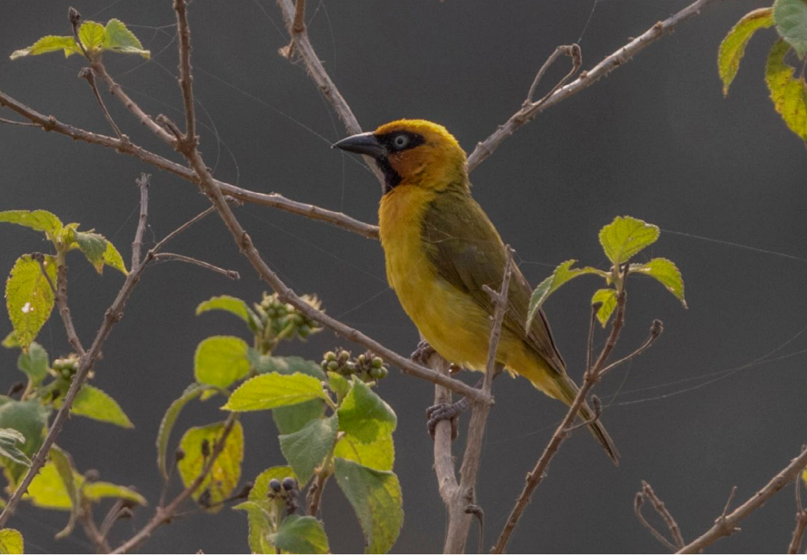
Olive-naped Weaver (above) and Reichenbach's Sunbird