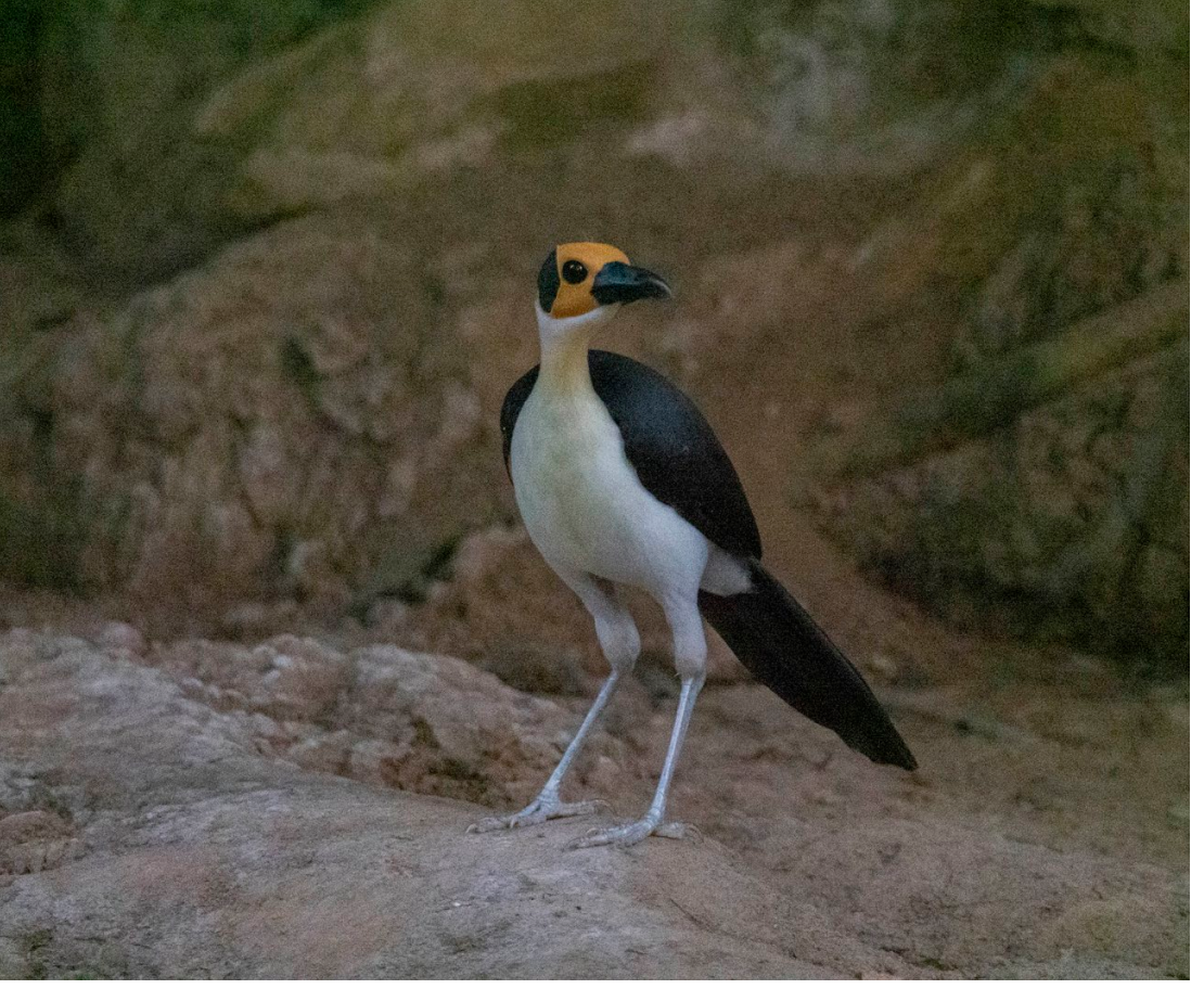
Yellow-headed Picathartes

The drive back to Kumasi was rather uneventful, spare a perched Beaudouin's Snake Eagle. It was now time to turn our attentions to some serious forest birding, which started off at Bobiri Butterfly Sanctuary where African Cuckoo-Hawk, Western Black Dwarf Hornbill, Least Honeyguide, African Piculet, Grev Parrot and incredible views of a Black-throated Coucal were the highlights. Passing Kumasi we paused for Double-toothed Barbet , before we arrived at the new lodge at Bankro in the mid-afternoon. We dropped our bags and then headed out to the nearby hill in the forest which has become famous as the best site in the world to see the incredible Yellow-headed Picathartes. Although we had to wait for a while and Don attracted a swarm of bees, two birds eventually came bounding along and gave us a superb display as they moved around various lianas