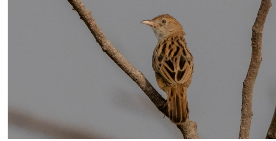
Croaking Cisticola

The next day we spent a very quiet and fairly frustrating morning at Kalakpa, seeing Tree Pipit , Mottled Spinetail and Red-cheeked Wattle-eye , glimpsing Baumann's Olive Greenbul and hearing Black-crowned Capuchin Babbler and Western Forest Robin . The rest of the day was spent driving to the base of the Atewa Range hills, where we spent the night in a nearby hotel.