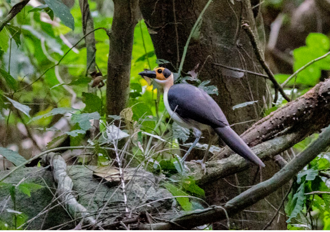
Yellow-headed Picathartes

14 Jan: Bankro to Kakum. 15 Jan: Full day in Kakum NP. 16 Jan: Full day around Kakum. 17 Jan: Kakum, and to Ankasa. 18–19 Jan: Full days at Ankasa. 20 Jan: Ankasa to Takarodi. 21 Jan: Takarodi to Accra.