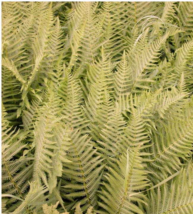
Figure 6. Dense colony of T. quelpaertensis at Heather Pond.

G4 N3 Not rated S1 Not known from Labrador S3S4 S3S4 SNR