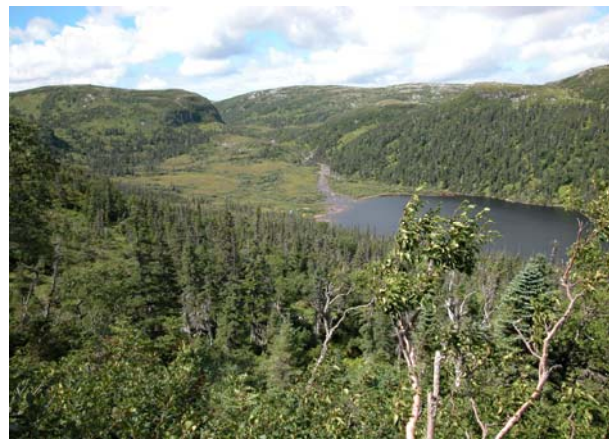
Figure 5. Heather Pond from the valley rim, near the upper limit of the population of T. quelpaertensis . These ferns grow at an altitude of 490 m to 600 m.

T. quelpaertensis is a crown-forming fern that sends out stolons along which new plants are initiated. It can form large colonies of thousands of crowns, but also grows singly. In Newfoundland, this species is found in moist open alpine meadows; beside lake shore, brooks, and springs; on talus slopes; in light shade beneath conifers; and in one case, in a late-melting snowbed. Moist soil seems to be a consistent habitat requirement, and the plants are capable of growing in full open conditions or light shade. Fronds are monomorphic (fertile and sterile fronds look alike), and reach a height of 75 cm in Newfoundland (pers. obs.). Fronds die back in winter. Pinnæ are deeply divided into pinnules. Sori are round, near the margin of the pinnules, with smooth tan indusia. The sporangia are smooth. Terrestrial in open, rocky woods and subalpine meadows in acid soils; 30 to 1,300 m; B.C., Nfld.; Alaska, Wash.; e Asia (Flora of North America 2005).