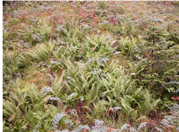
Figures 2 and 3. Typical habitat and habit of T. quelpaertensis at Heather Pond, at left in talus, at right in open woodland.