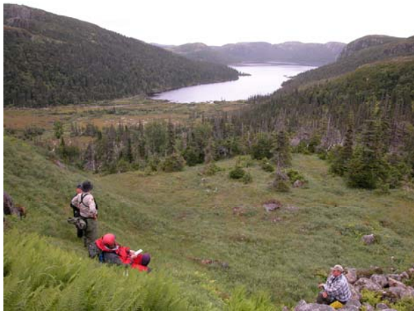
Figure 4. View from the base of a talus slope with fern patch, looking east towards Heather Pond.