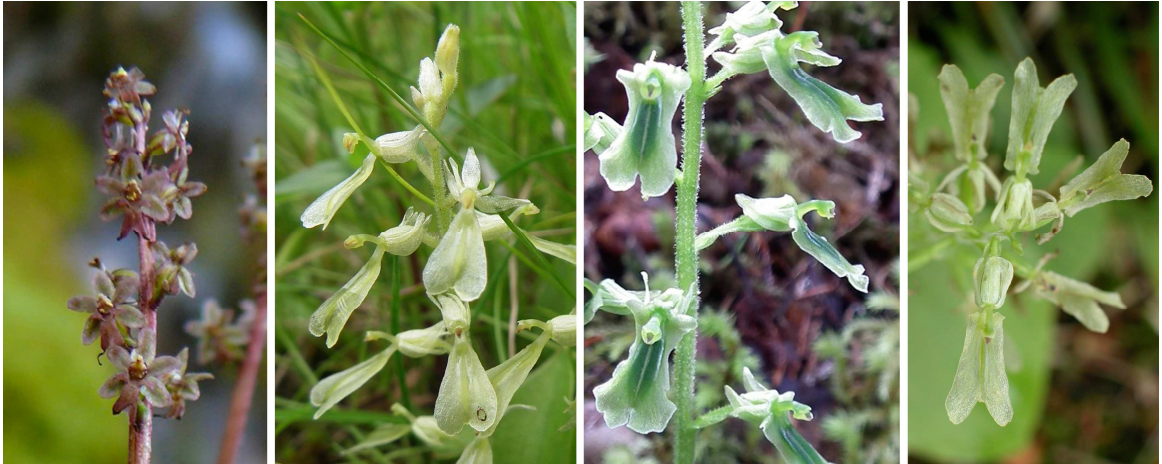
Figure 7. Comparison of flowers of Listera species found in Newfoundland and Labrador. Left to right: L. cordata , L. convallarioides , L. borealis , L. auriculata ( Listera x veltmanii , a hybrid of L. convallarioides and L. auriculata , is not shown).