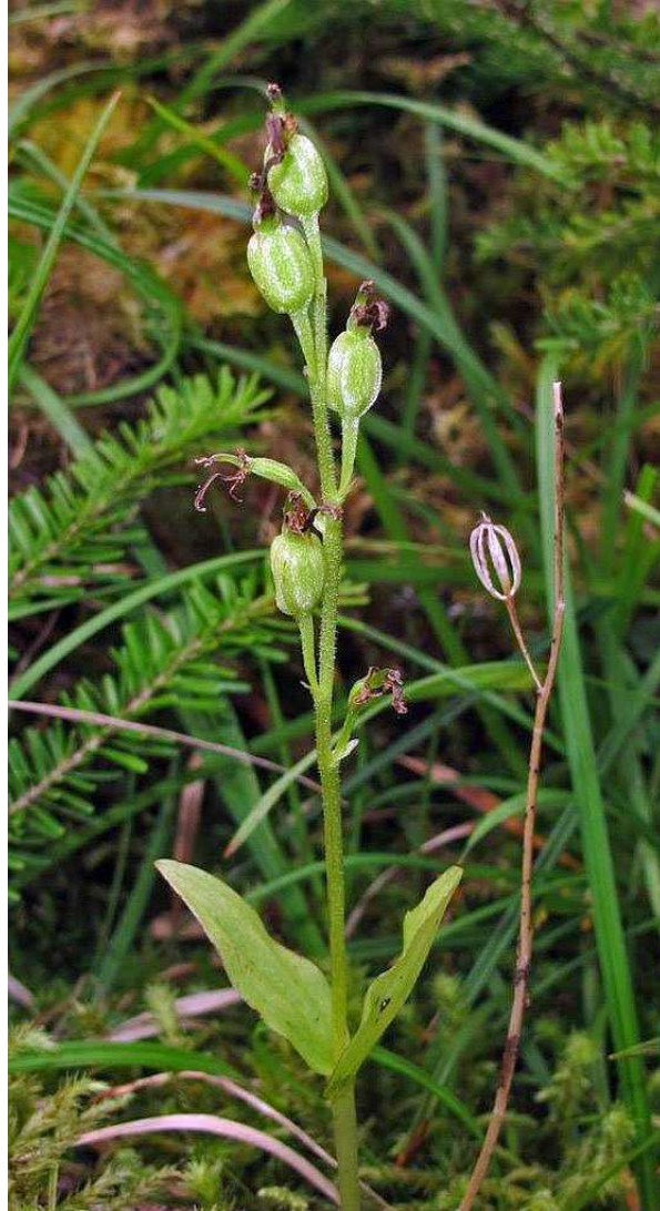
Figure 3b. Listera borealis in fruit, Eddies Cove [East]. Note previous year's opened capsule on right.