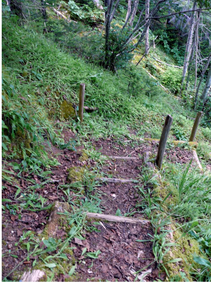
Figure 4: Listera borealis habitat at Lomond in Gros Morne National Park.