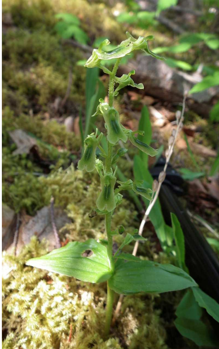
Figure 3a. Listera borealis in Rhytidiadelphus moss, Lomond. Note previous year's stalk on right.