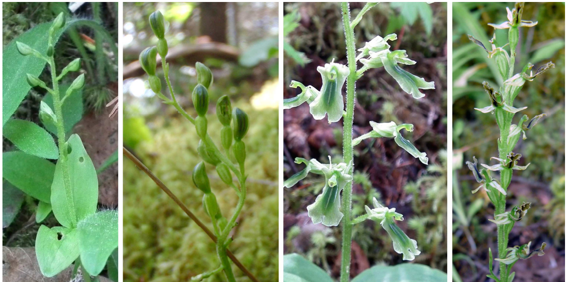
Figure 5. Maturation of Listera borealis flowers. Left to right: young buds, buds beginning to show colour, fully opened flowers, flowers beginning to reflex as capsules swell.

At Lomond, Listera borealis seems to always be associated with Rhytidiadelphus moss, although Internet photos from other parts of North America show it growing with Pleurozium and Ptilium mosses.