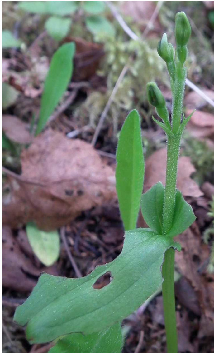
Figure 6. Listera borealis at Lomond showing damage by gastropods. This plant had completely disappeared a week later.

Many plants at Lomond show signs of herbivory, apparently by slugs and snails. In some cases, entire plants have disappeared from one visit to another. Herbivory may be one of the most important controlling factors for this species, especially with respect to reducing seed production. Slugs have been seen on and around the plants, and slime trails were evident on some chewed leaves.