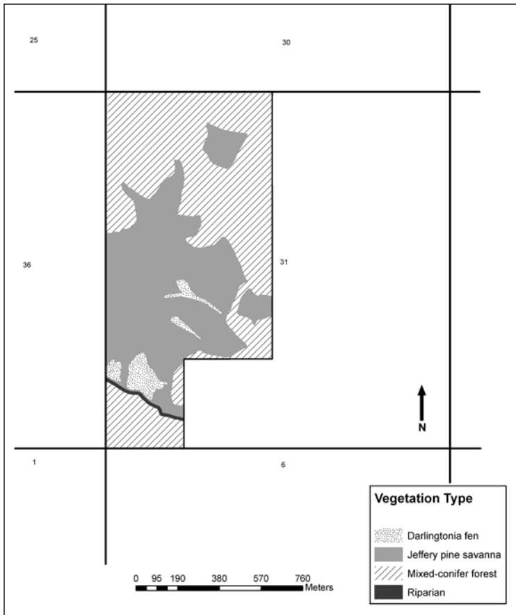
Figure 3–Woodcock Bog Research Natural Area vegetation types.