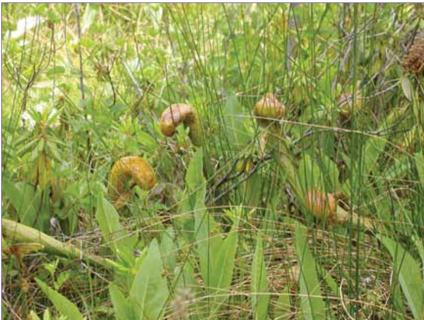
Figure 4–Cobra lily ( Darlingtonia californica ), a distinctive insectivorous plant of Woodcock Bog Research Natural Area fen.