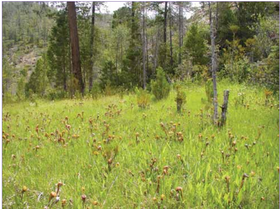
Figure 6—Cobra lily, a conspicuous fen dominant, along with Josephine horkelia ( Horkelia congesta ssp. nemorosa ), western burnet ( Sanguisorba annua ) and a variety of sedges ( Carex mendocinensis , C. echinata , and C. athrostachya ).