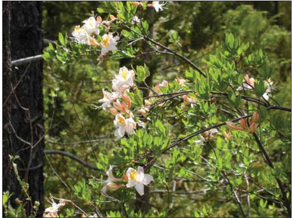
Figure 5—Western azalea ( Rhododendron occidentale ), a widely scattered and showy tall shrub of Woodcock Bog Research Natural Area.