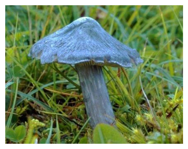
Entoloma serrulatum Blue Edge Pinkgill