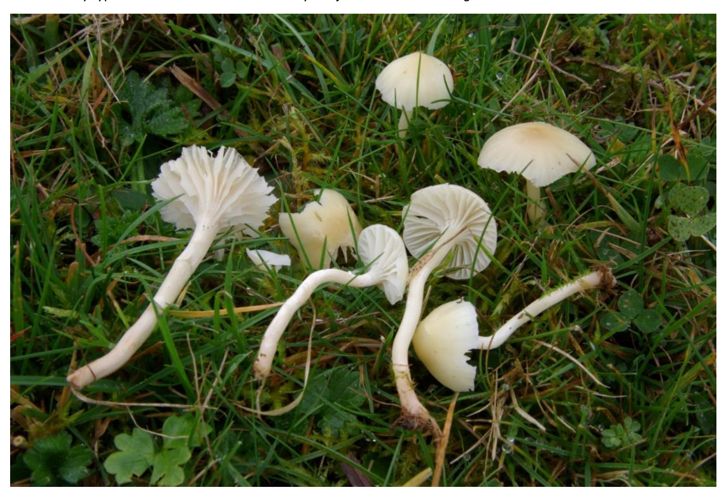
Hygrocybe pratensis var. pallida Pale Waxcap (Cuphophyllus berkeleyi in some recent books)

White to creamish-white cap, slender species with decurrent gills <u>and strong smell of cedar wood or pencil</u> <u>sharpening</u>s (not a plastic pencil!). Usually appears later in the season, fairly frequent on acid grasslands. The image below is very typical of the actual colour – usually not just as white as H. virginea !