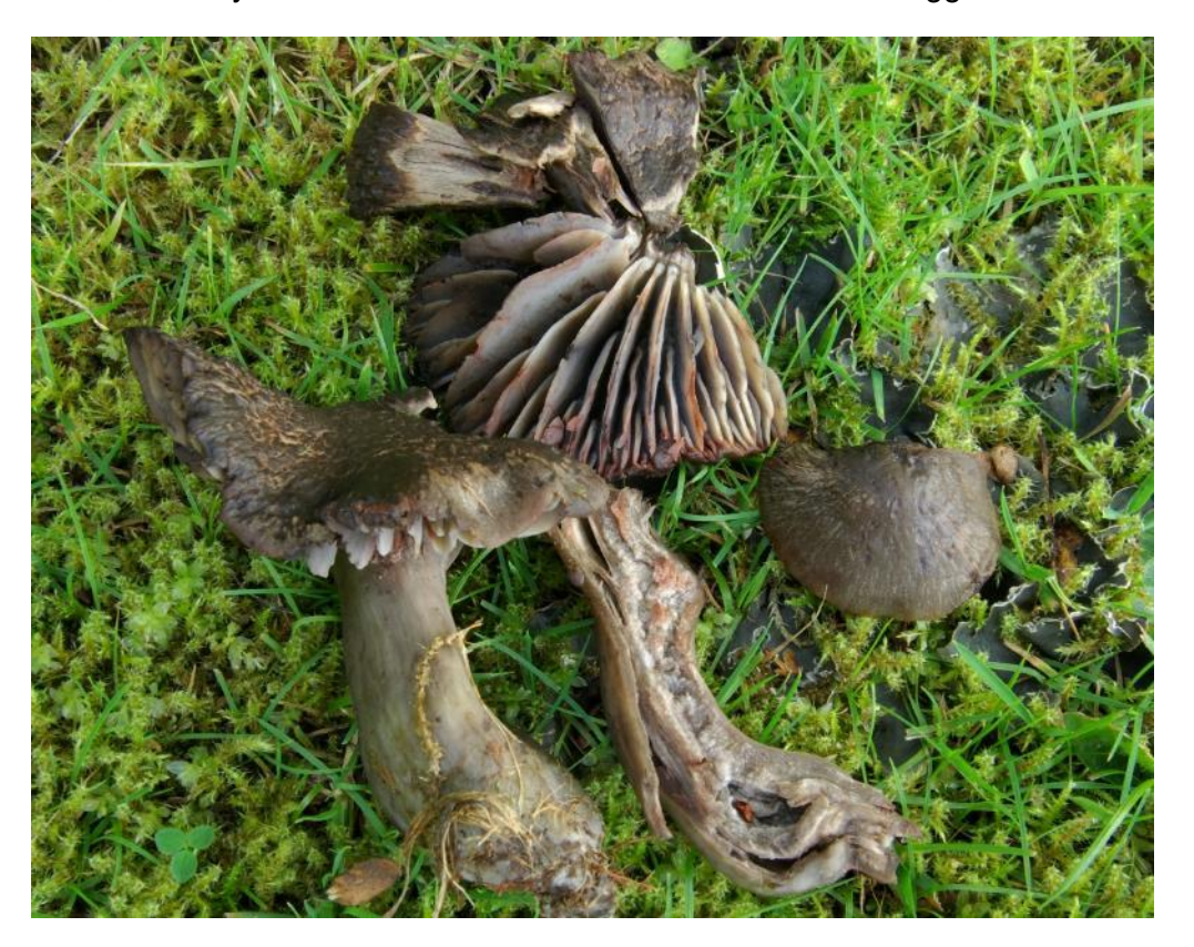
Hygrocybe virginea Snowy Waxcap (Cuphophyllus virgineus in some recent books)

A 'chunky' darkish grey-brown waxcap, that darkens with age and bruises reddish (see image). Fairly rare in NI, but easy to miss because of the brownish colour and suggestion that it looks like sheep's dung!?