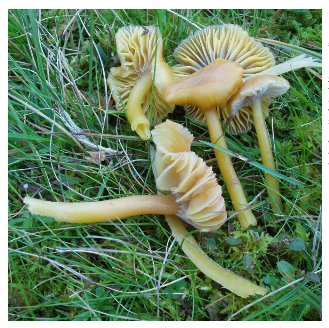
Hygrocybe laeta Heath Waxcap (Gliophorus laetus in some recent books)

Smallish species typically found on more acid grasslands. Very, very, viscid cap and stipe, and with a hand lens you should see the viscid layer extending over gill edge. Gills decurrent. Smells unmistakably of rubber/tyres/latex.