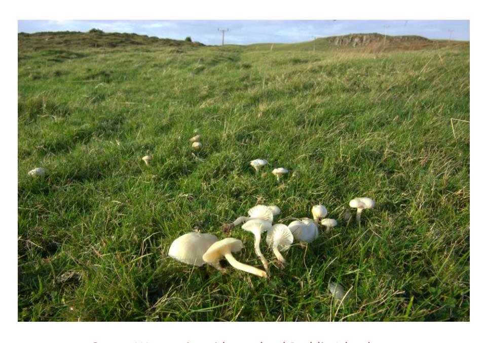
Snowy Waxcap in acid grassland Rathlin Island.