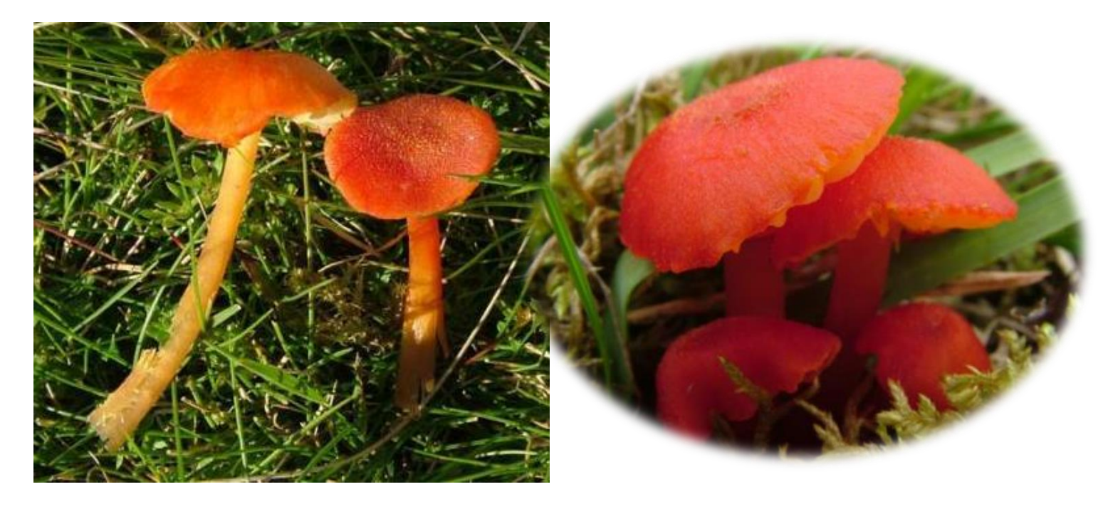
Hygrocybe intermedia Fibrous Waxcap

Small bright red species with velvety cap. Tends to be fragile and usually appears early in the season. Has a faint smell of garlic (need to leave it in a small box for an hour!) Uncommon in NI, but probably under-recorded.