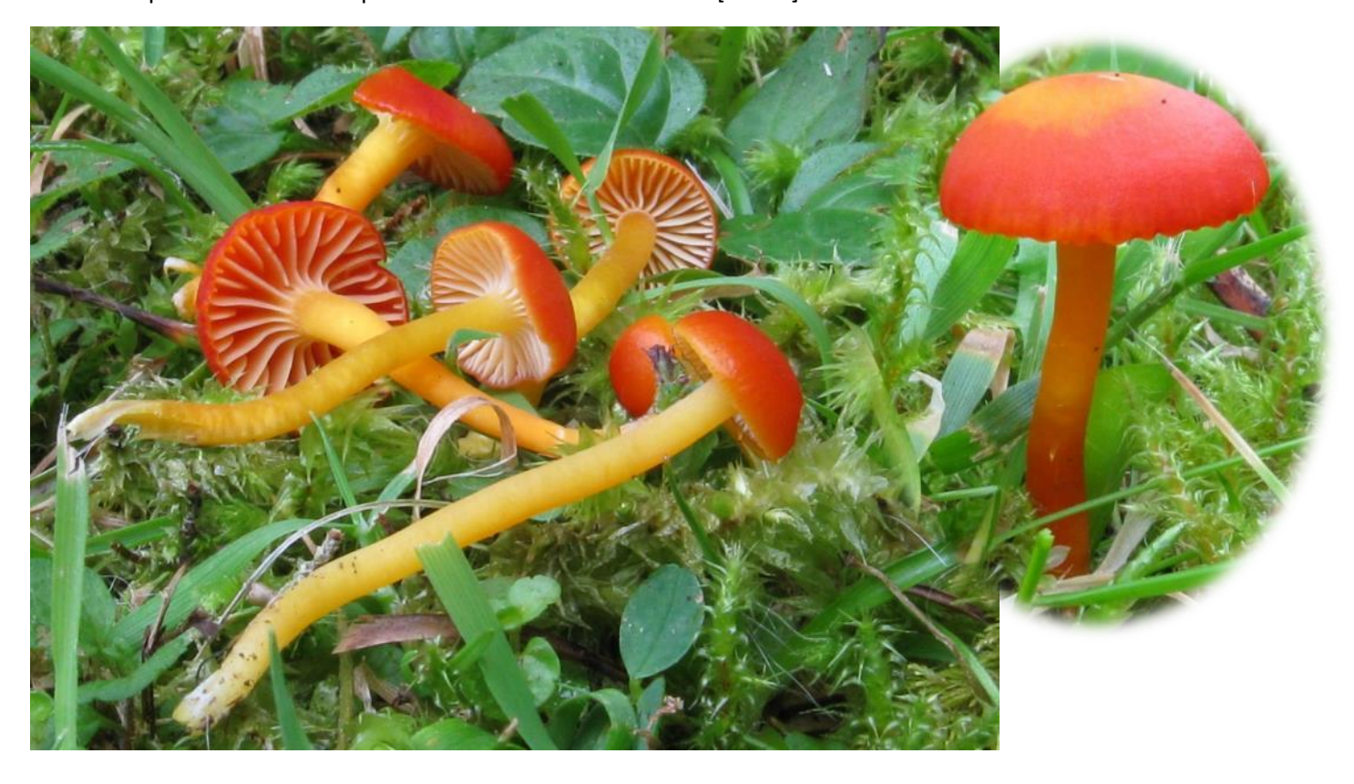
Hygrocybe glutinipes Glutinous Waxcap

A small yellow/red species, wet cap and stem, gills slightly decurrent or with decurrent tooth. Widespread and very common species. Taste the cap to check it's not H. mucronella [below]!