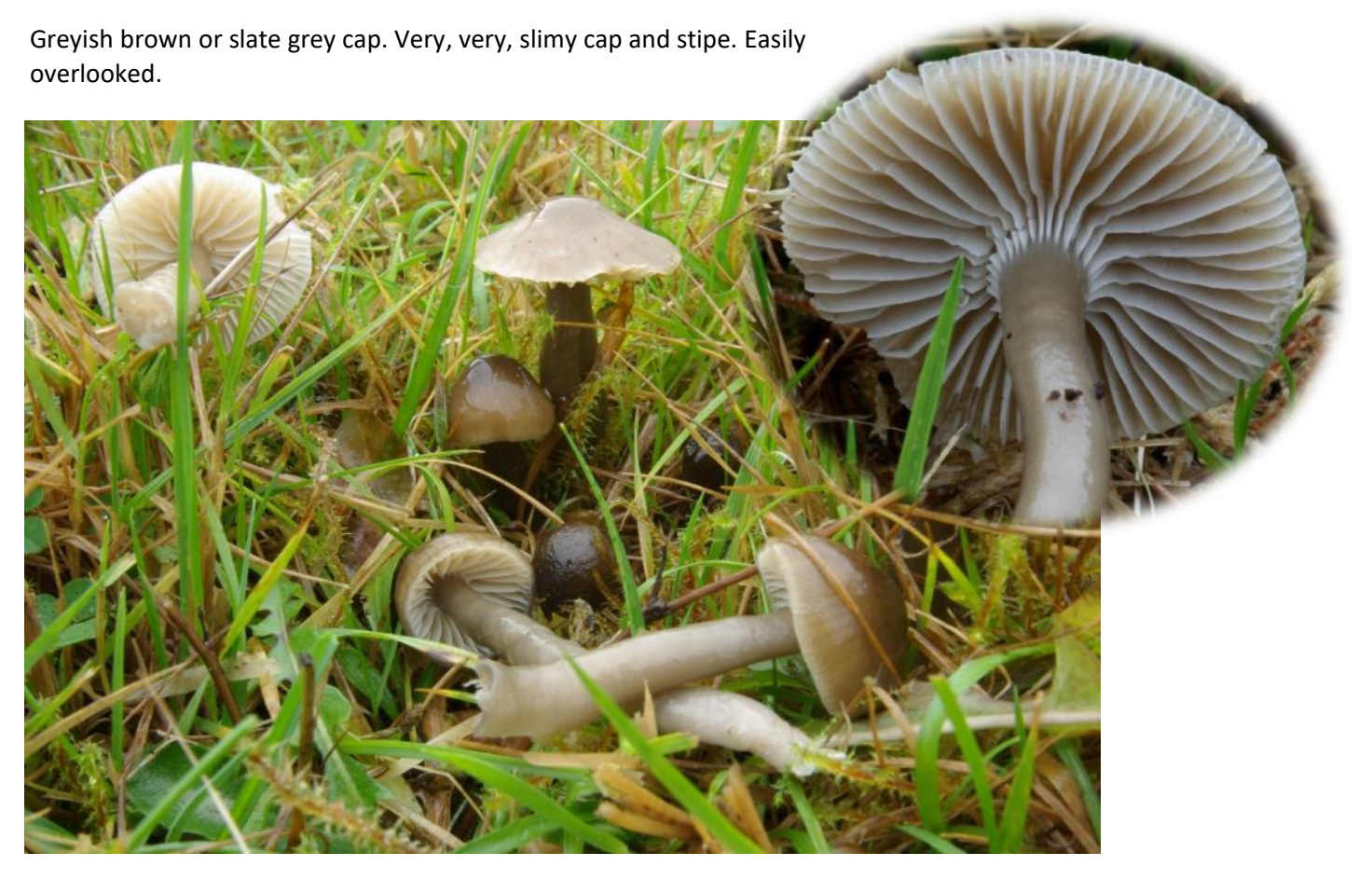
Hygrocybe lacmus Grey Waxcap (Cuphophyllus lacmus in some recent books)

Greyish, greyish brown striate cap with white stipe. Gills decurrent. Uncommon in NI, acid grasslands/heath mosaics.