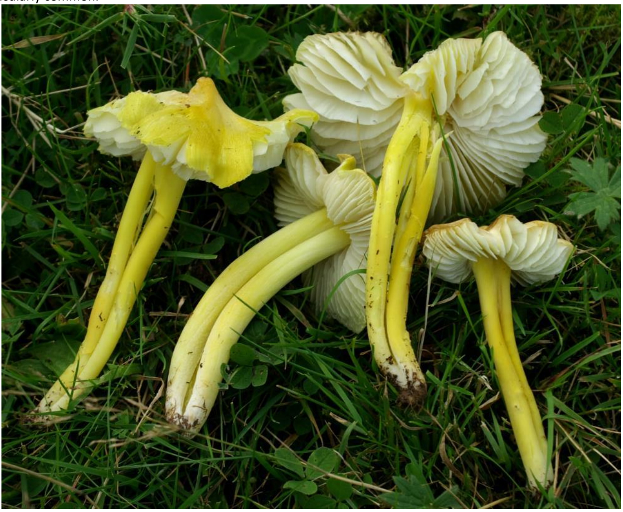
Hygrocybe calyptriforis Pink Waxcap (Porpolomopsis calyptriformis in some recent books)

Lemon yellow conical cap, often with a hint of green. Cap radially fibrillose, smooth finely fibrillose stem. Not particularly common.