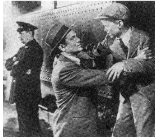
Top: with John Garfield in " UNDER MY SKIN "

[no listing in "Halliwell's Filmgoer's Companion". "Those Endearing Young Charms" ]