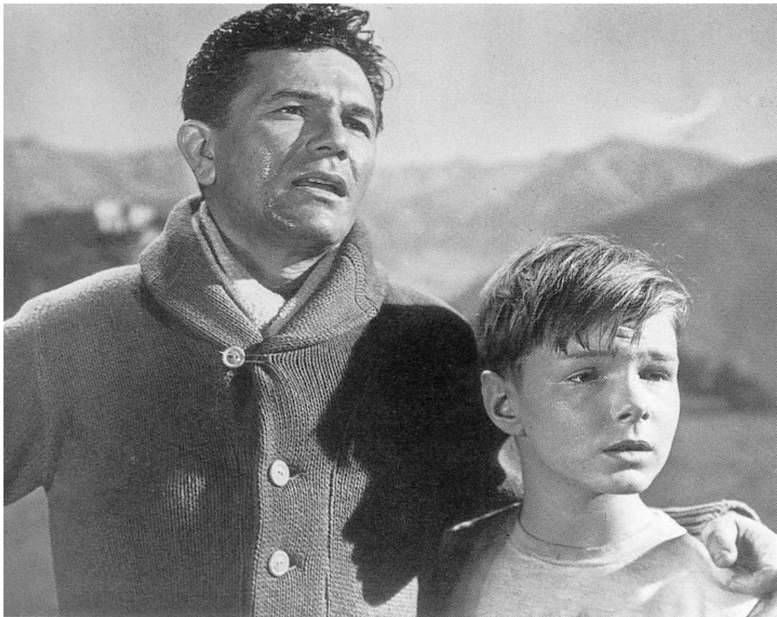
Father and son a symbiotic organism in "UNDER MY SKIN". Note the exquisite shadow effect, exaggerating the boy's elfin features.

Born: Long Beach, California; 18 th July 1939