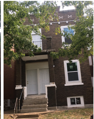
3708 Bamberger and 3710 Bamberger