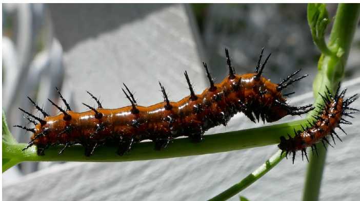
Figure 7. Gulf fritillary caterpillar.