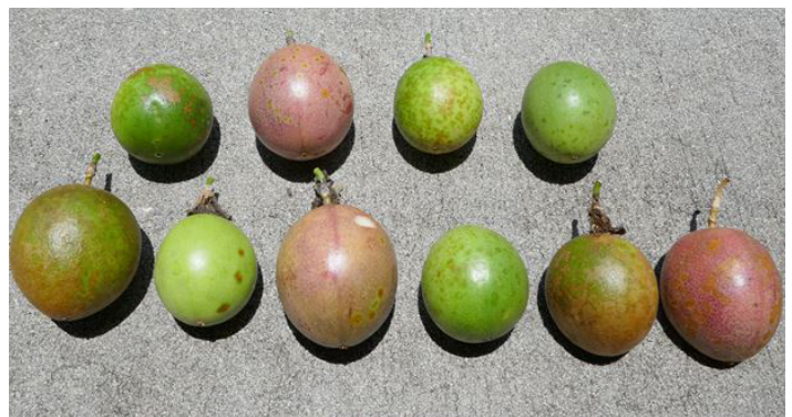
Figure 6. Fusarium affecting fruit at various stages of maturity.

One of the most harmful diseases of passion fruit is fusarium wilt, caused by the fungus Fusarium oxysporum (Figure 6). On young plants, the symptoms include pale-green leaves, mild dieback, leaf drop on lower leaves, and general plant wilting. Yellowing of young leaves appears in adult plants, followed by wilting and death. The disease affects the xylem, causing impermeability of vascular walls and preventing the movement of water to other plant parts. Thus, the vascular tissues become brown at the root, collar, stem, and twig areas. The pathogen can spread by soil movement (machines, implements, shoes, etc.) and by water runoff or irrigation. The disease severity is greater in high relative humidity and temperature.