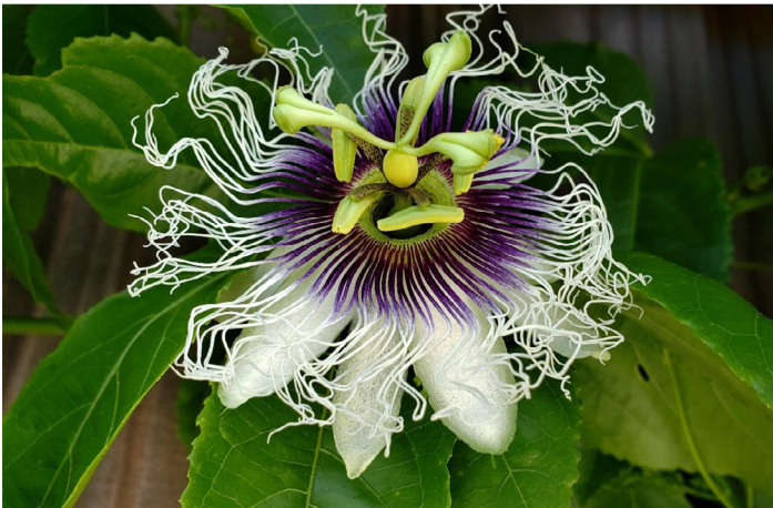
Figure 2. Flower morphology of passion fruit.