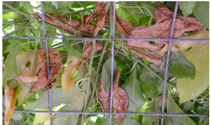
Figure 5. Dead leaves under new leaves hindering airflow and facilitating disease.

Brown spot of passion fruit is caused by the fungi Alternaria passiflora and A. alternata . The symptoms can be seen on leaves, stems, and fruit. On fruit, the symptoms appear as tiny gray spots, then light brown, and finally dark brown with wrinkled centers, affecting the pulp and decreasing commercial value of fruit. The symptoms on the leaves include reddish-brown spots, becoming light brown later. Spots enlarge to one inch in diameter under high humidity. Leaves drop after developing a few spots. On stems, dark-brown lesions are more elongated and cause girdling and eventually death of the terminal part of the stem. Wind, water, and rain can spread the fungal spores produced on the fruit, leaves, and stems. The disease can be more intense under high humidity or high temperature and in the rainy season. Brown spot can be managed by spacing and pruning plants so that air can circulate (Figure 5) and increase ventilation and light conditions. Weed control, improved sanitation, and preventive applications of fungicide can also help to manage the disease.