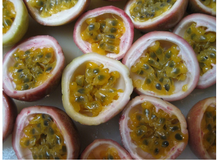
Figure 3. Passion fruit halves with typical aril fill.

Lack of arils (the pulpy tissue surrounding the seed) may be attributed to water or nutrient deficiency. Empty fruit on a passion fruit vine can be a result of excess fertilizer, particularly if large amounts of nitrogen are used. Other reasons may be fruit fly damage, stink bug damage, poor pollination, or boron deficiency (Figure 3).