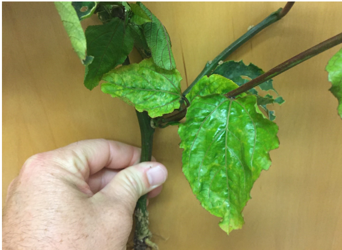
Figure 4. Leaves of passion fruit infected with passion fruit woodiness virus are distorted.

then feeding on an uninfected plant. The virus can also be transmitted through pruning tools and grafting. The virus is not transmitted through seeds. Common cultural practices to manage the disease are selecting virus-free planting materials, eliminating mechanical transmission during trimming, and regularly inspecting and roguing diseased plants. Although there are insecticides to control aphids, prevention is more effective because the virus spreads quickly.