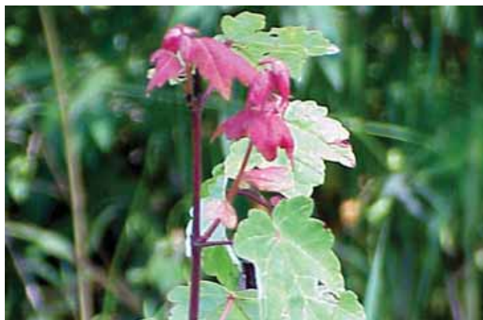
Figure 1. Red Maple.

Although discovery opportunities still exist, rapid loss of natural habitats and alteration of native plant communities by invasive exotic plants and human encroachment threaten Florida's natural areas and compromise the potential of future findings. There are currently more than 300 plants listed on the state endangered species list in Florida. As native plants disappear, so does opportunity for ethnobotanical uses. Our objective is to provide a brief sampling of ethnobotanical information, in the hopes of generating interest and greater appreciation for the important roles that plants have played in human history, as well as the potential for future discoveries. To facilitate this effort, we have listed 50 common plants, their descriptions, 26 photo plate images and information regarding their ethnobotanical history in Florida (Table 3).