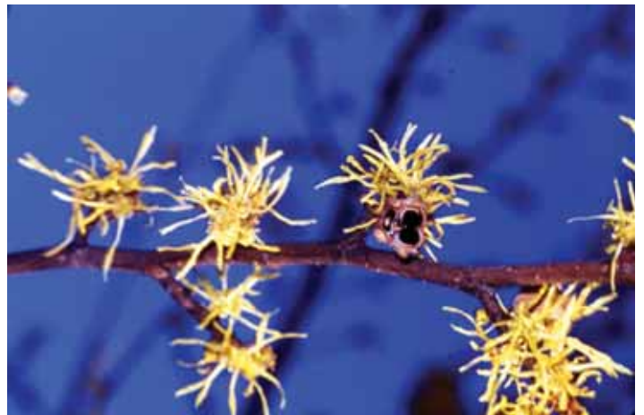
Figure 7. Witch-hazel.