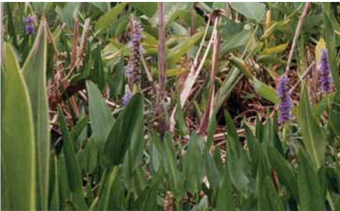
Figure 16. Pickerelweed.