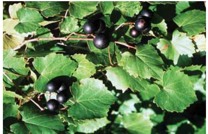
Figure 24. Muscadine Grape Scuppermong.