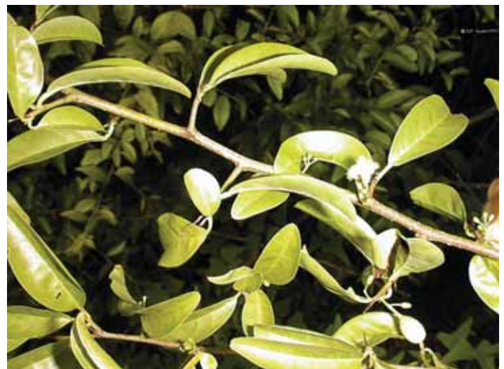
Figure 25. Tallow-wood.