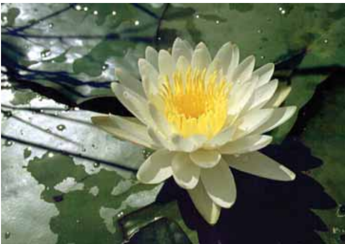
Figure 10. White Water-lily.