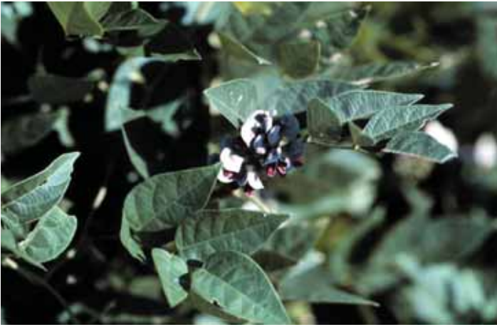
Figure 3. American Groundnut.