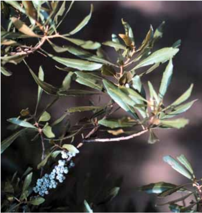
Figure 9. Wax-myrtle.