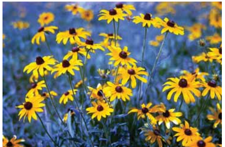
Figure 19. Black-eyed Susan.