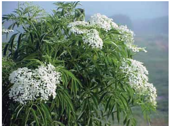
Figure 20. Elderberry.