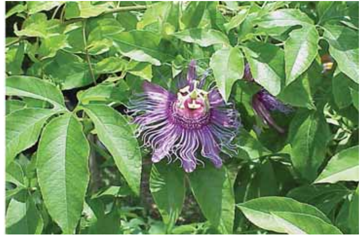
Figure 12. Purple Passion flower.