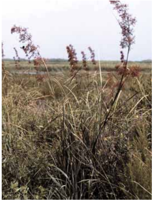
Figure 6. Sawgrass.