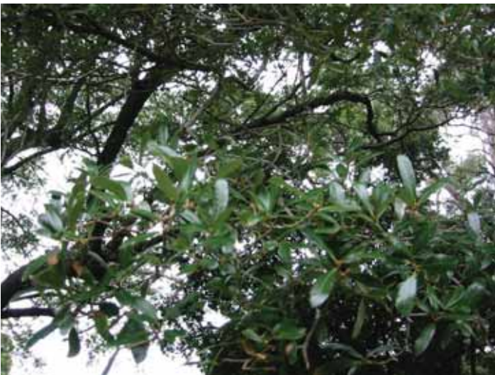
Figure 17. Live Oak.