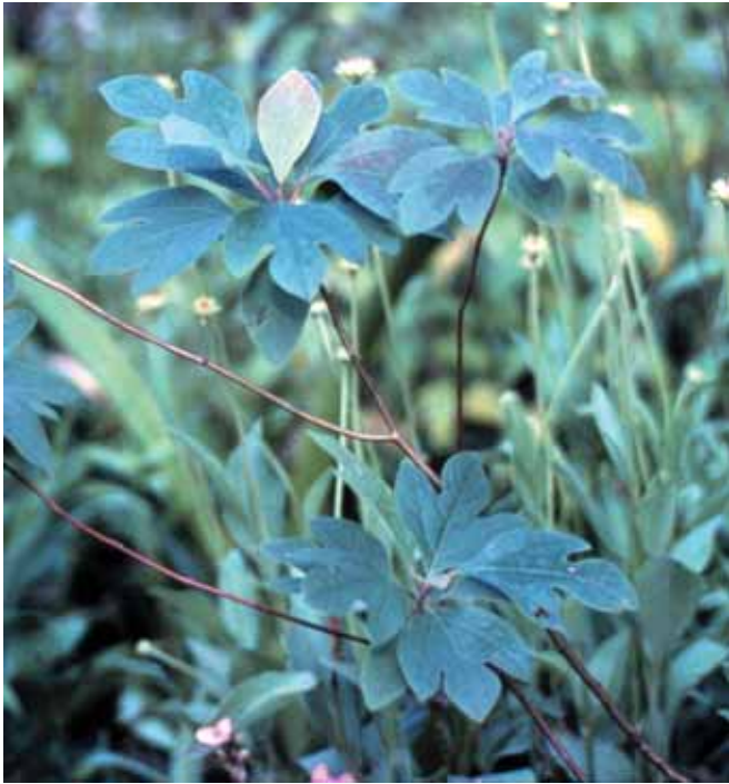
Figure 21. Sassafras.