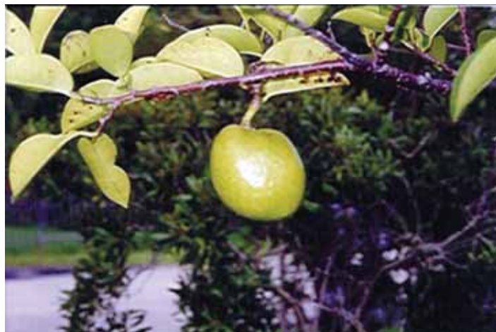
Figure 2. Pond-apple.