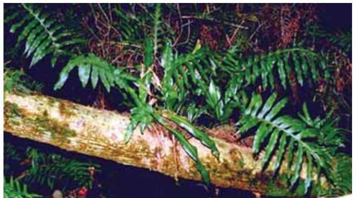
Figure 14. Golden Polypody, Goldenfoot Fern.