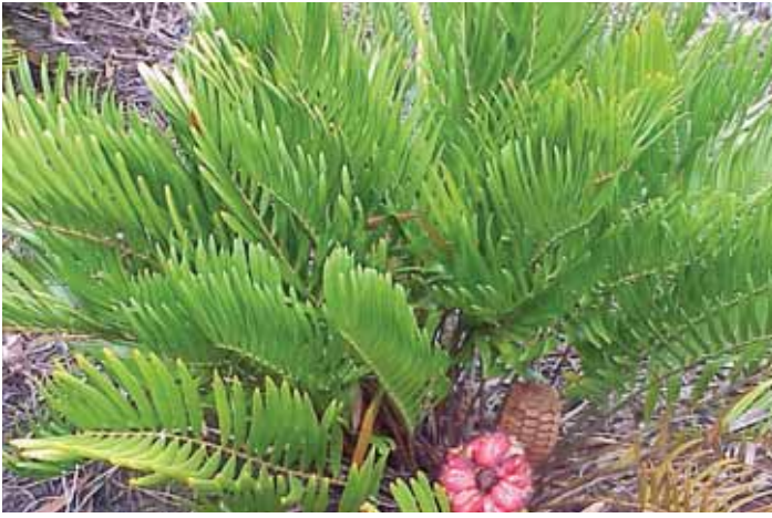
Figure 26. Coontie.