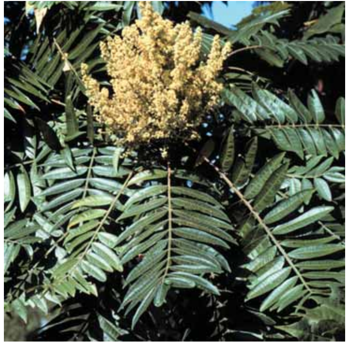
Figure 18. Winged Sumac.