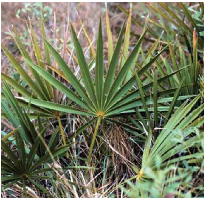
Figure 22. Saw Palmetto.