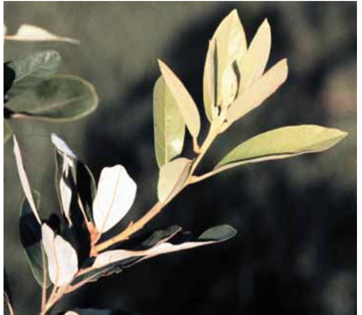
Figure 13. Red-bay, Swamp-bay.