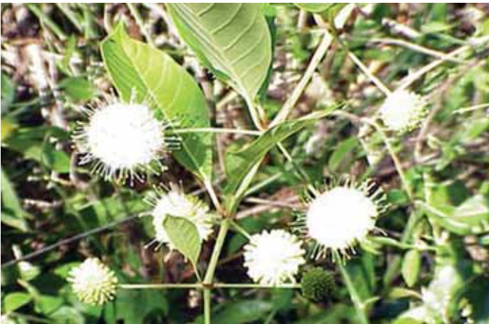
Figure 5. Buttonbush.