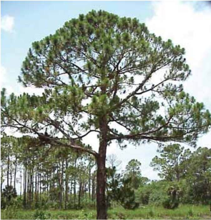
Figure 15. Slash Pine.