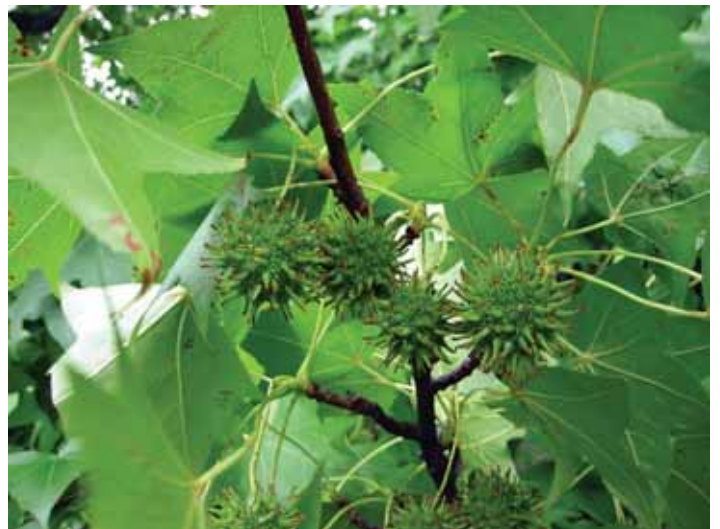
Figure 8. Sweet Gum, Red Gum.