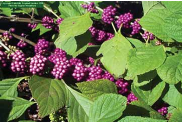
Figure 4. Beautyberry. Photo and permission to use by G.F. Guala.