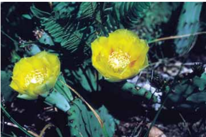
Figure 11. Prickly-pear.