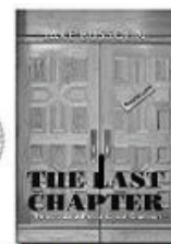
The Last Chapter