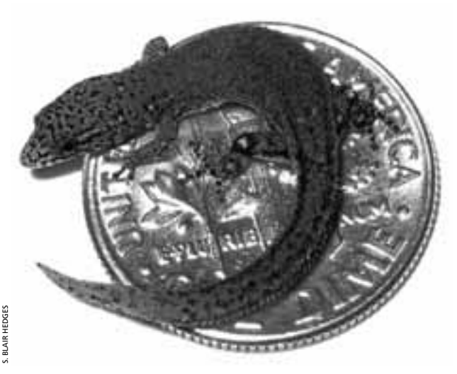
The Jaragua Dwarf Gecko ( Sphaerodactylus ariasae ) is the smallest known tetrapod in the world.

The National Parks Department was legally created in 1974 (now included, since 2000, in the Ministry of Environment and Natural Resources). In 1983, the protected areas system was expanded beyond the five parks included in 1974 (one of which was Jaragua National Park). A management