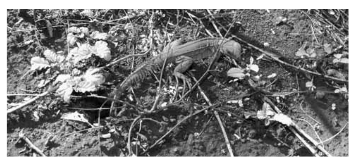
Hatchling Cyclura ricordii in the Fondo de la Malagueta, about 5 km northeast of Pedernales. The nest was excavated between 19 May and 1 June 2004. Emergence of the hatchling occurred on 2 September. How long the hatchling spent in the nest after hatching is unknown.

The town council passed another resolution in September. This establishes two "Espacios Municipales Protegidos" (Municipal Protected Areas). One involves wetlands close to Cabo Rojo that serve as an important bird sanctuary. The other, with an area of 85 km², covers most of the presently known C. ricordii range north and east of Los Olivares as well as a fairly extensive buffer zone. A nature path is being built to allow visi-