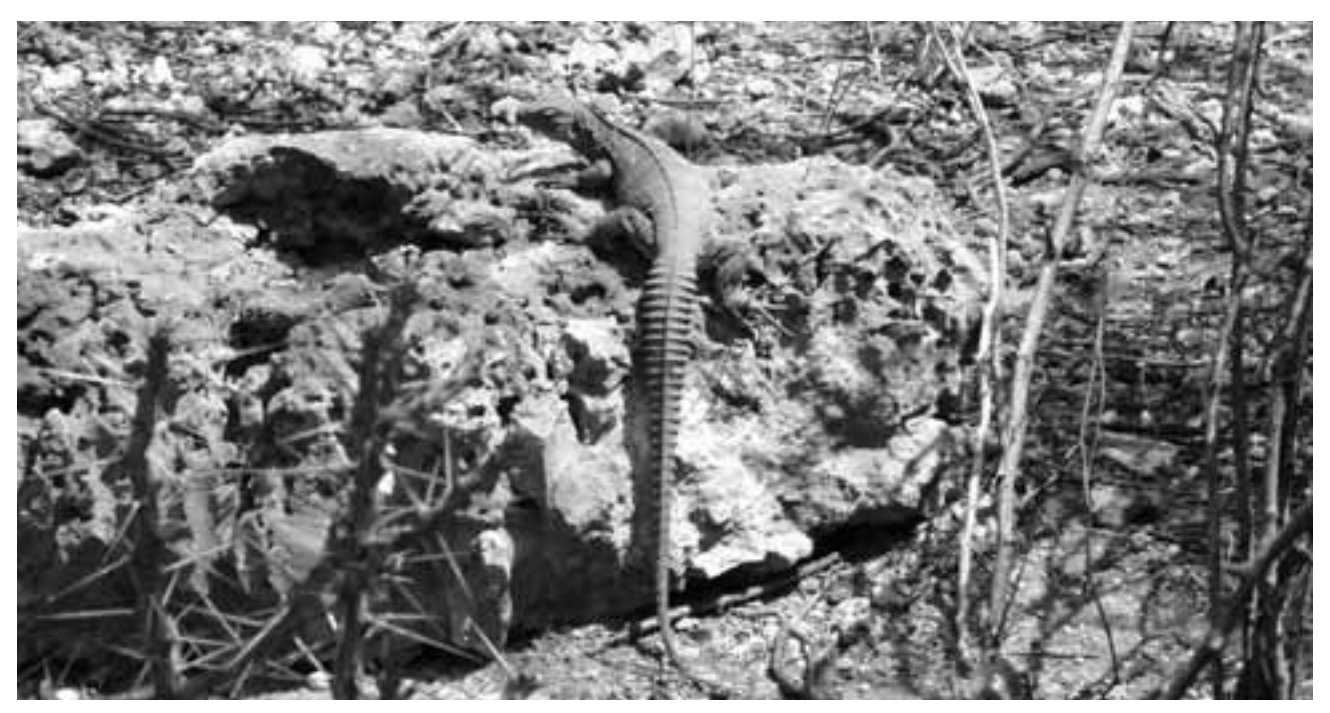
Two-year-old Cyclura ricordii in the Fondo de la Malagueta, about 5 km northeast of Pedernales.

plan was published in 1986. Immediately thereafter, a group of concerned citizens, mostly biologists, working in different governmental agencies and universities, explored options for providing permanent support of Jaragua and other parks and biodiversity in general. After a year of discussions and reflections, the Grupo Jaragua, a Dominican Biodiversity Conservation NGO, was established. GJ is now one of the leading organizations to have contributed significantly to the preservation of the nation's natural resources.