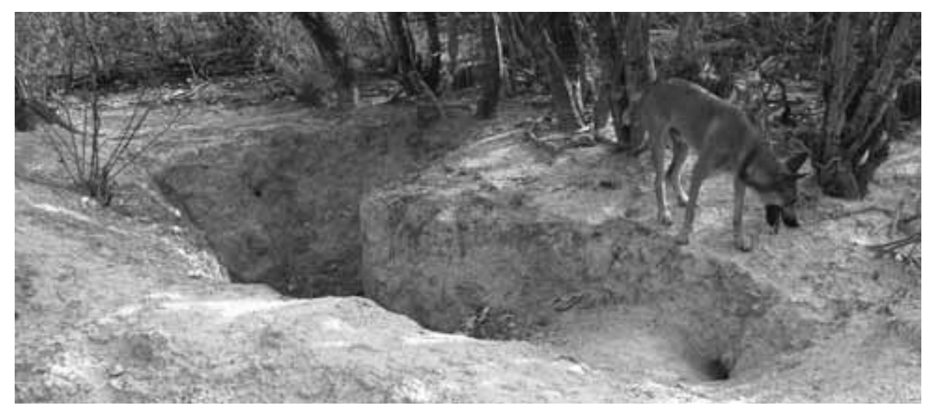
Excavated Cyclura ricordii den on the southern shore of Lago Enriquillo. Note also the new den of a smaller animal in front of the dog.

With traditional beliefs that justify persecution of iguanas and a senator, who is a popular political figure, destroying iguana habitat to increase agricultural production, the task of securing a future for C. ricordii on the southern shore of Lago Enriquillo does not appear very promising — but this task is a challenge which has to be met.