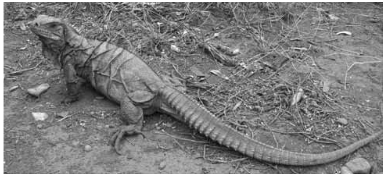
Gravid female Cyclura ricordii in search of a nesting site near Pedernales.