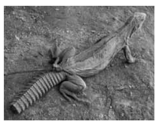
"Pet" Cyclura ricordii in the town of Baitoa on the southern shore of Lago Enriquillo.

strip with the intention of clearing the land for agriculture. This illegal action within a RAMSAR Site has been denounced by the Ministry of Environment and Natural Resources, which has taken legal action against the senator. The case was highlighted by the press and constituted one of the biggest recent environmental scandals in the country. Nevertheless, the damage has already been done.