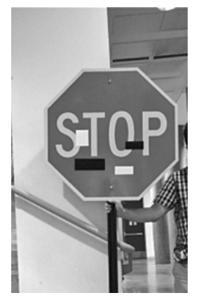
FIGURE 3. ADVERSARIAL EXAMPLE OF A STOP SIGN

To the naked eye, the image appears to be of a stop sign marred by stickers—a common occurrence in the modern urban landscape. To the digital eye, however, the difference is vast. The algorithm will confidently identify the sign as a right turn sign.<sup>153</sup>