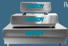
Hardy Bench or Floor Scales

Allen-Bradley® Compatible Plug-in Weigh Scale Modules