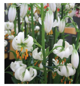
Martagon 'Album' Height: 120cm ES EACH