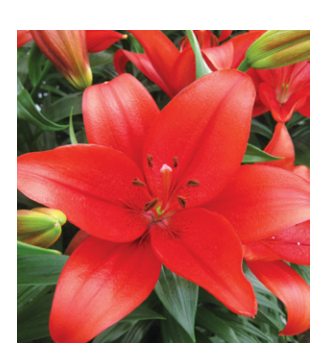
Cereza Height: 90cm A: £1.75 B: £1.20 C: £1.00