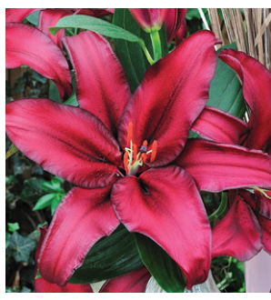
Firebolt Height: 85cm A: £3.00 B: £2.50 C: £2.00