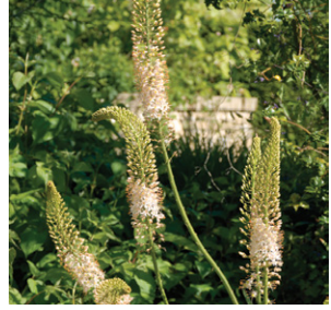
Rubustus Height: 175cm Plant Depth: 5-10cm £5.00 EACH