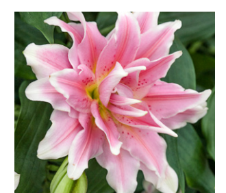
Natalia Height: 80cm A: £3.00 B: £2.50 C: £2.00