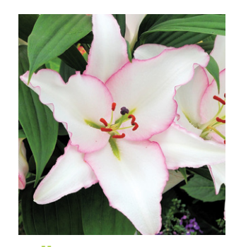
Millesimo Height: 110cm A: £2.50 B: £1.75 C: £1.50