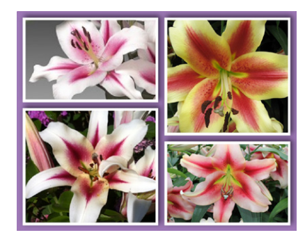
Multicoloured Tree-Like Lily Collection Pack of 12 Bulbs