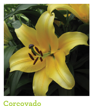
Height: 120cm A: £2.50 B: £1.75 C: £1.50