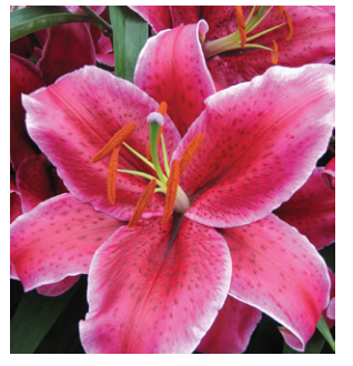
Corvara Height: 100cm A: £2.50 B: £1.75 C: £1.50