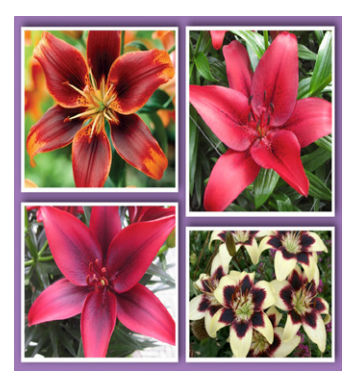
Asiatic Lily Collection