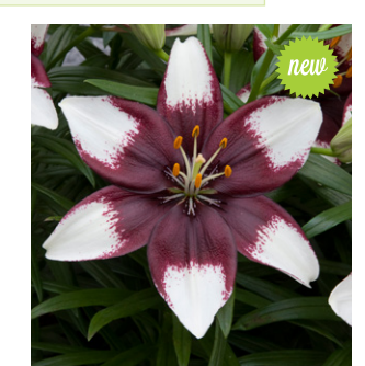
Tiny Padhye (Asiatic) Height: 35cm A: £2.00 B: £1.75 C: £1.50