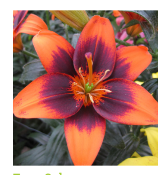
Easy Salsa Height: 100cm A: £1.75 B: £1.20 C: £1.00