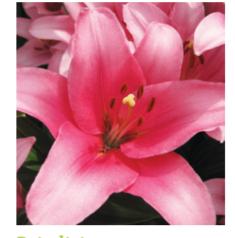
Brindisi Height: 90cm A: £1.75 B: £1.20 C: £1.00