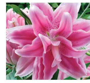
Isabella Height: 80cm A: £3.00 B: £2.50 C: £2.00