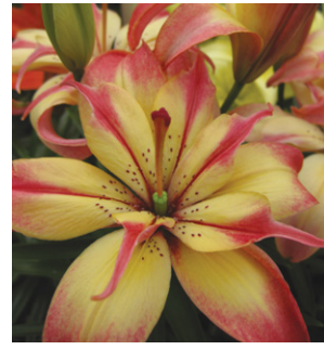
Delicate Joy (Double) Height: 60cm A: £2.50 B: £1.75 C: £1.50