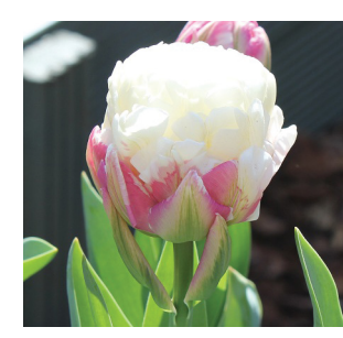
Ice Cream Height: 25cm Plant Depth: 10-12cm 5 FOR £10.00