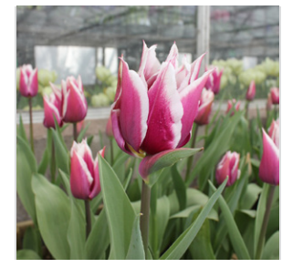
Claudia Height: 45cm Plant Depth: 10-12cm 20 FOR £7.50