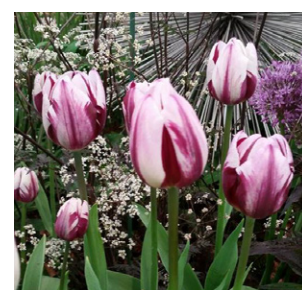
Rems Favourite Height: 60cm Plant Depth: 10-12cm 20 FOR £7.50