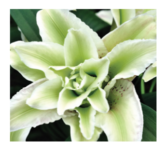
Annika Height: 80cm A: £3.00 B: £2.50 C: £2.00

The Roselily series is an exciting line of 'pollen-free' double flowering Oriental Liliums. The first generation varieties of Roselily released for the market are Roselily Belonica and Roselily Fabiola which range between 85–100cm tall (up to 3ft). The second generation contains varieties including Roselily Natalia and Elena. The third generation varieties are selections with more stem length, including Roselily Isabella, Annika and many more. They are highly scented varieties preferring an Ericaceous (Acidic) compost.