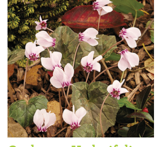
Cyclamen Hederifolium Height: 10-13cm Plant Depth: 6-8cm 3 FOR £8.00