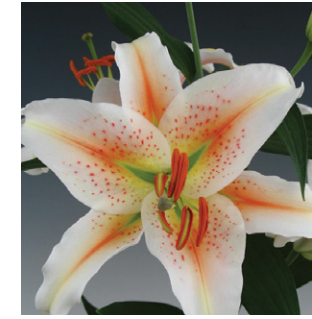
Salmon Star (Oriental) Height: 60cm A:£2.00 B:£1.75 C:£1.50

PAGE 22 Lily Bulbs / Autumn Dispatch Tel: 01270 485379 www.hartsnursery.co.uk Lily Bulbs / Spring Dispatch PAGE 23