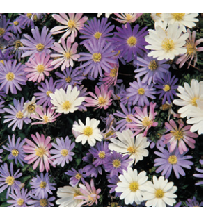
Anemone Blanda Mixed

Height: 80cm Plant Depth: 15cm 3 FOR £10.00