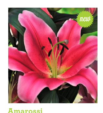
Height: 120cm A: £2.50 B: £1.75 C: £1.50

These giant Oriental Trumpet Lilies (also know as Orienpet or Tree Lilies) are a hybrid of the showy Trumpet Lily and hardy Oriental Lily. The result is a sweetly scented and stunning show of up to twenty blooms per stem. These Tree-like Lilies are very sturdy and can grow up to 250cm (8 feet) once established. They are lime tolerant and therefore ideal for borders or containers. Soil must be well drained.