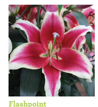
Height: 105cm A: £2.50 B: £1.75 C: £1.50