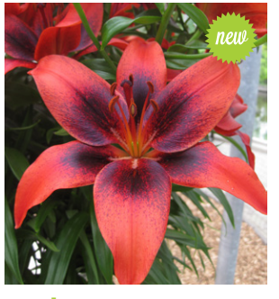
London Heart Height: 120cm A: £2.50 B: £1.75 C: £1.50