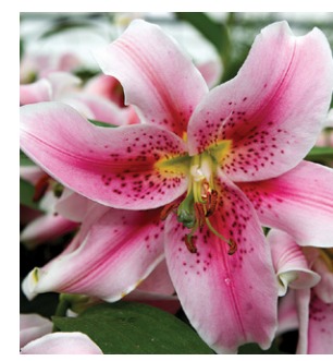
Mona Lisa (Oriental) Height: 60cm A: £2.00 B: £1.75 C: £1.50