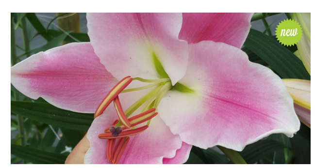
Queenfish Height: 120cm A: £2.50 B: £1.75 C: £1.50