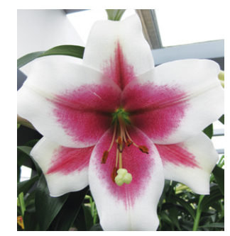
Triumphator Height: 110cm A: £2.50 B: £1.75 C: £1.50