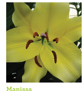
Manissa Height: 200cm A: £2.50 B: £1.75 C: £1.50