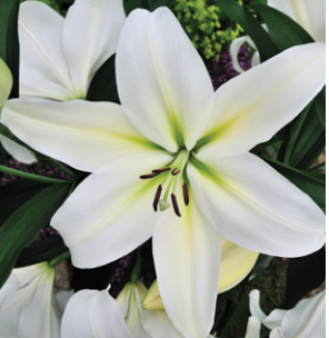
Height: 120cm A: £2.50 B: £1.75 C: £1.50

Longiflorum Oriental Lilies are delicately scented and later flowering (August). They are lime tolerant and therefore suitable for borders or pots in either Alkaline or Acidic soils that are well drained. I.O lilies tend to grow between 90cm to 120cm (3 to 4 feet).