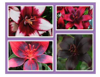
'Hot Red Bed' Lily Collection Pack of 12 Bulbs £15.00