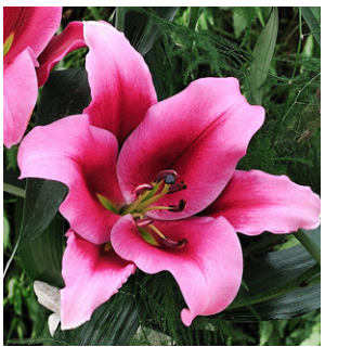
Paraguay Height: 120cm A: £2.50 B: £1.75 C: £1.50