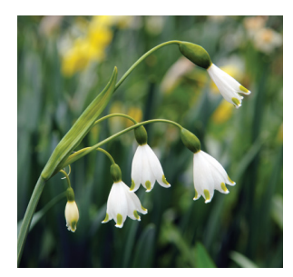
Leucojum Aestivum Height: 45-55cm Plant Depth: 10-15cm 10 FOR £5.00