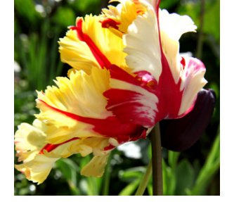
Flaming Parrot Height: 60cm Plant Depth: 10-12cm 20 FOR £7.50