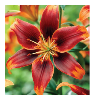
Forever Susan Height:90cm A: £1.75 B: £1.20 C: £1.00