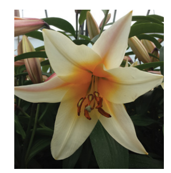
High Tea Height: 120cm A: £2.50 B: £1.75 C: £1.50