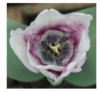
Shirley Height: 40cm Plant Depth: 10-12cm 20 FOR £7.50