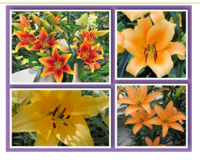
'Flaming Oranges' Lily Collection Pack of 12 Bulbs