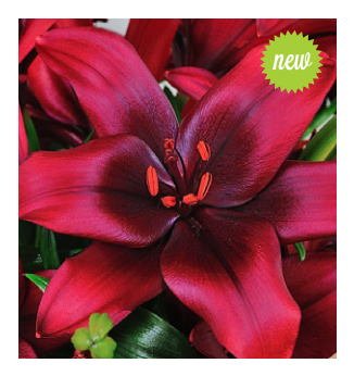
Foreigner Height: 100cm A: £2.50 B: £1.75 C: £1.50