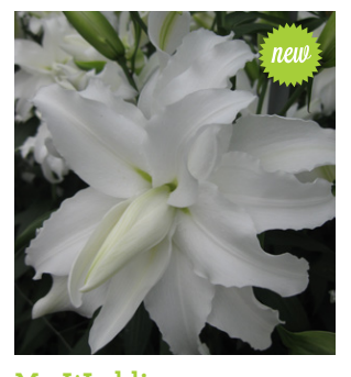
My Wedding Height: 120cm A: £3.00 B: £2.50 C: £2.00