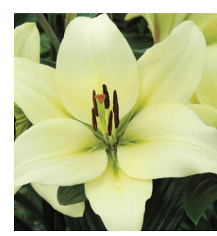
Trebbiano Height: 110cm A: £1.75 B: £1.20 C: £1.00