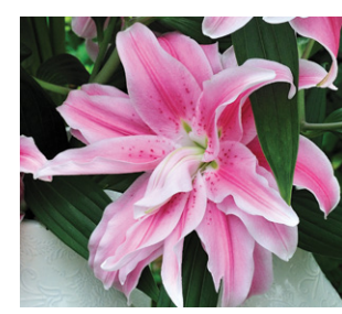
Belonica Height: 85cm A: £3.00 B: £2.50 C: £2.00