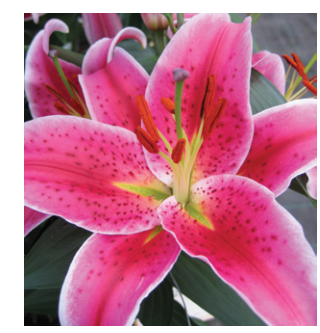
Stargazer Height: 100cm A: £2.50 B: £1.75 C: £1.50