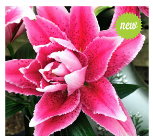
Thalita Height: 80cm A: £3.00 B: £2.50 C: £2.00