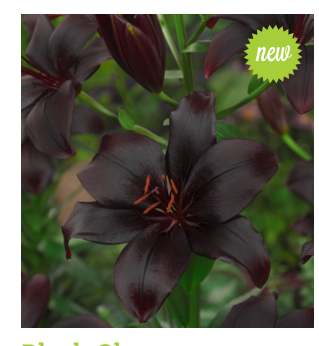
Black Charm Height:90cm A: £2.50 B: £1.75 C: £1.50