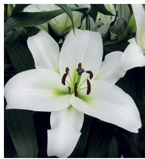
Cyclone Height: 120cm A: £2.50 B: £1.75 C: £1.50