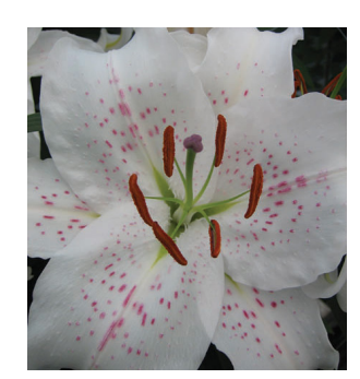
Muscadet Height: 80cm A: £2.50 B: £1.75 C: £1.50