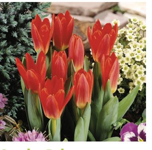
Scarlet Baby Height: 20cm Plant Depth: 10-12cm 30 FOR £5.00