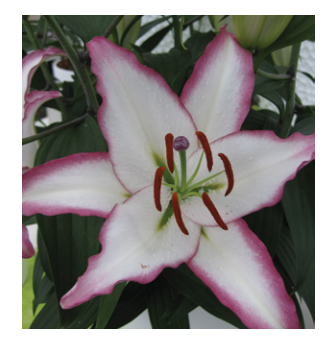
Hotline Height: 120cm A: £2.50 B: £1.75 C: £1.50