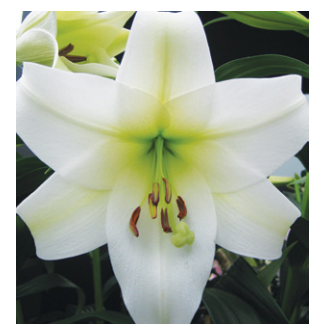
White Triumph Height: 95cm A: £2.50 B: £1.75 C: £1.50