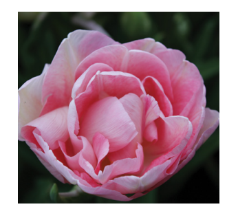
Angelique Height: 50cm Plant Depth: 10-12cm 20 FOR £7.50