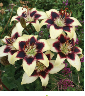
Patricia's Pride Height: 90cm A: £2.50 B: £1.75 C: £1.50