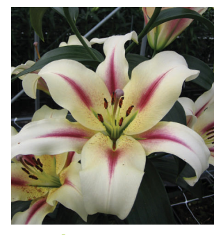
Nymph Height: 130cm A: £2.50 B: £1.75 C: £1.50