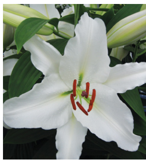
Casa Blanca Height: 110cm A: £2.50 B: £1.75 C: £1.50