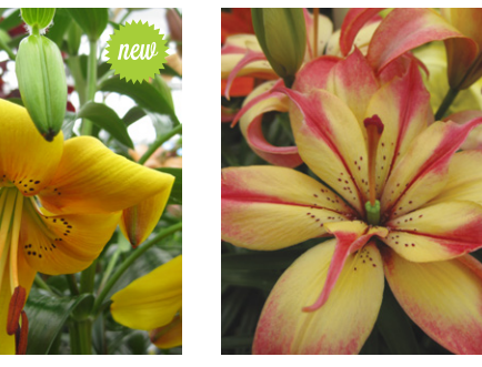
Chocolate Canary Height: 120cm A: £2.50 B: £1.75 C: £1.50