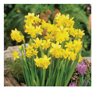
Tete-a-Tete Height: 15cm Plant Depth: 10-15cm 30 FOR £5.00