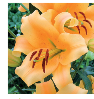
Eudoxia Height: 120cm A: £2.50 B: £1.75 C: £1.50