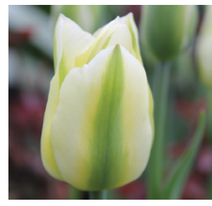
Spring Green Height: 50cm Plant Depth: 10-12cm 20 FOR £7.50