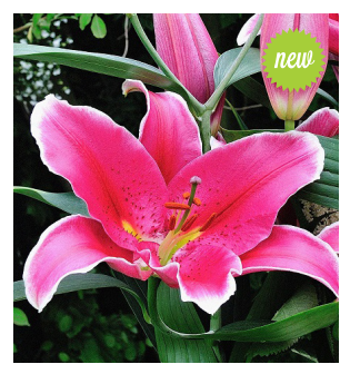
Joop Height: 120cm A: £2.50 B: £1.75 C: £1.50