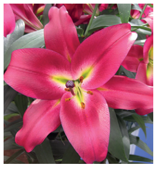
Mussasi Height: 150cm A: £2.50 B: £1.75 C: £1.50