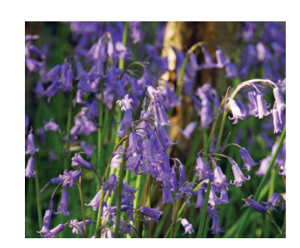
Hyacinthoides Non-scripta Blue Bells Height: 25cm Plant Depth: 6-8cm 20 FOR £5.00