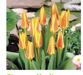
Giuseppe Verdi Height: 30cm Plant Depth: 10-12cm 30 FOR £5.00