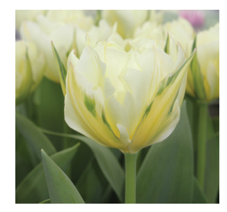
Exotic Emperor Height: 50cm Plant Depth: 10-12cm 20 FOR £7.50