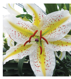
Auratum Goldband Height: 90cm A: £2.50 B: £1.75 C: £1.50

The Oriental Lily opens a 6 petal bloom that can spread up to 20cm in diameter. The height of the Oriental Lily can range between 90cm and 150cm (3 to 5 feet). Oriental Lilies tend to flower mid-season in July/August. They are highly scented varieties preferring an Ericaceous (Acidic) compost. They will not tolerate an Alkaline soil (lime). If this is the case, we advise to plant in pots/containers.