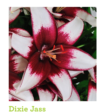
Height: 100cm A: £2.50 B: £1.75 C: £1.50