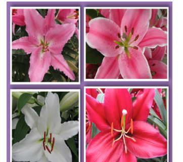
Oriental Lily Collection