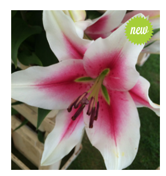
Sucinto Height: 140cm A: £2.50 B: £1.75 C: £1.50