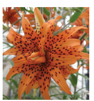
Flore Pleno (Double) Height: 150cm A: £2.50 B: £1.75 C: £1.50