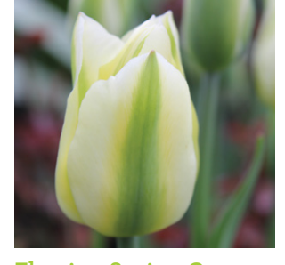
Flaming Spring Green Height: 50cm Plant Depth: 10-12cm 20 FOR £7.50