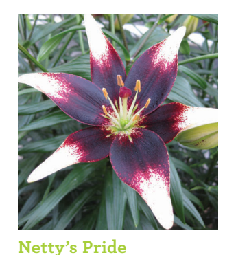
Height: 100cm A: £2.50 B: £1.75 C: £1.50