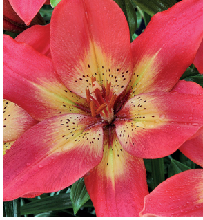
Arsenal Height: 100cm A: £1.75 B: £1.20 C: £1.00

Asiatic Lilies are mostly unscented and brightly coloured varieties. These lilies are medium sized with upward or outward facing flowers. They grow between 30-150cm (1 to 5 feet) and are the hardiest of the lilies. They are ideal for pots or borders and prefer well-drained Alkaline soils but will tolerate most conditions. Asiatic Lilies will typically flower in June/July.