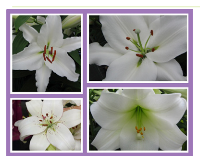
'Dazzling Whites' Lily Collection Pack of 12 Bulbs