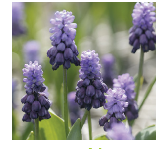
Muscari Latifolium Height: 10-20cm Plant Depth: 6-8cm 20 FOR £3.00