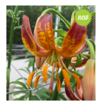
Arabian Night Height: 150cm £7.50 EACH

Please Note: All Martagon Lilies are dispatched in the Autumn from September to November.