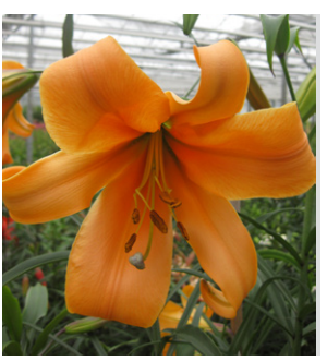
African Queen Height: 150cm A: £3.00 B: £2.50 C: £2.00

Trumpet Lilies are impressive in any garden due to their stately appearance and fragrance. The flowers are trumpet shaped, facing outward and are very early flowering. Ideal for the garden. These tall varieties can grow up to 200cm (8 feet) with a beautiful perfume.