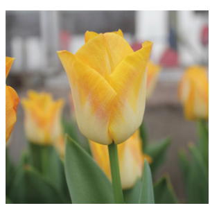
Golden Dynasty Height: 45cm Plant Depth: 10-12cm 20 FOR £7.50