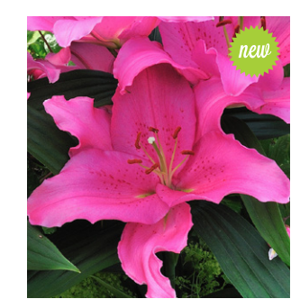
Homerus Height: 120cm A: £2.50 B: £1.75 C: £1.50