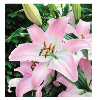
Lucille Height: 115cm A: £2.50 B: £1.75 C: £1.50