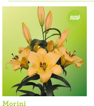
Height: 120cm A: £2.50 B: £1.75 C: £1.50