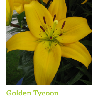
Golden Tycoon Height: 85cm A: £1.75 B: £1.20 C: £1.00