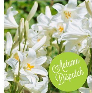
Lilium Candidum (Madonna Lily) Speciosum Uchida Height: 120cm 3 Bulbs for £10