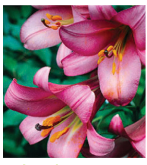
Pink Perfection Height: 150cm A: £3.00 B: £2.50 C: £2.00