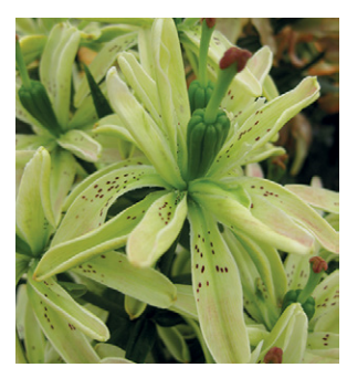
Must See Height: 100cm A: £2.50 B: £1.75 C: £1.50