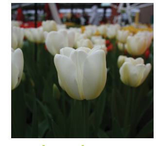
Angel's Wish Height: 60cm Plant Depth: 10-12cm 10 FOR £5.00