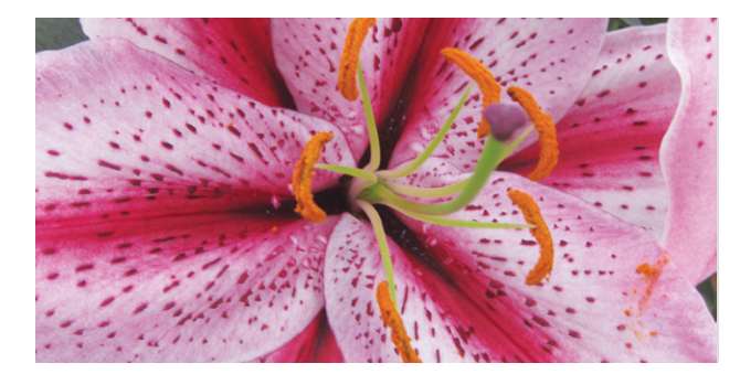
Tiger Edition Height: 100cm A: £2.50 B: £1.75 C: £1.50