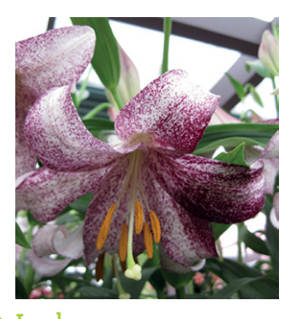
Height: 120cm A: £2.50 B: £1.75 C: £1.50