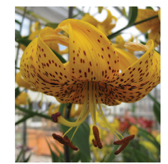
Leichtlinii Height: 200cm A: £1.75 B: £1.20 C: £1.00