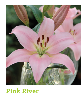
Height: 120cm A: £1.75 B: £1.20 C: £1.00