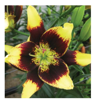
Easy Dance Height: 75cm A: £1.75 B: £1.20 C: £1.00