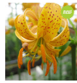
Terrace City Height: 80cm £7.50 EACH