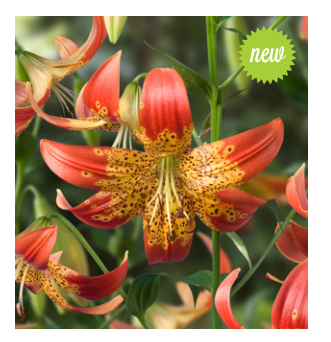
Fusion (Longflorum Hybrid) Height: 100cm A: £3.00 B: £2.50 C: £2.50

A= Price per bulb if you purchase 1-2 bulbs B= Price per bulb if you purchase 3-4 bulbs C= Price per bulb if you purchase 5+ bulbs