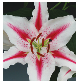
Hot Spot Height: 100cm A: £2.50 B: £1.75 C: £1.50