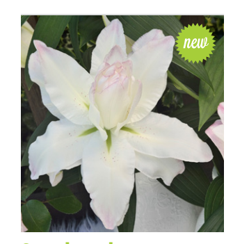
Snowboard Height: 100cm A: £3.00 B: £2.50 C: £2.00