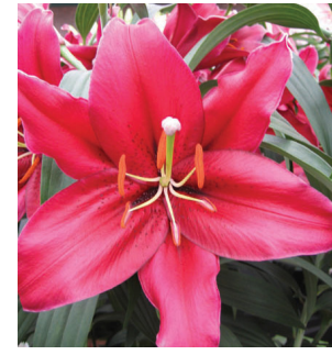
Mambo Height: 100cm A: £2.50 B: £1.75 C: £1.50