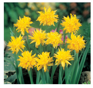
Rip Van Winkle

Height: 20cm Plant Depth: 10-15cm 30 FOR £5.00