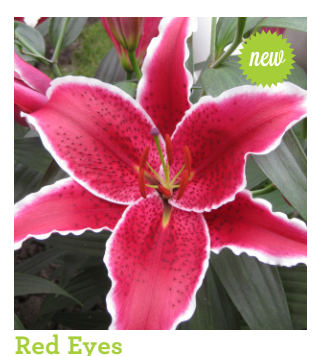
Height: 100cm A: £2.50 B: £1.75 C: £1.50