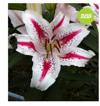
Spectator Height: 100cm A: £2.50 B: £1.75 C: £1.50