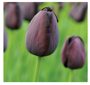
Queen of Night Height: 60cm Plant Depth: 10-12cm 20 FOR £7.50