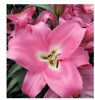
Table Dance Height: 100cm A: £2.50 B: £1.75 C: £1.50