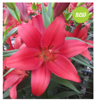
Paintball Height: 100cm A: £2.50 B: £1.75 C: £1.50