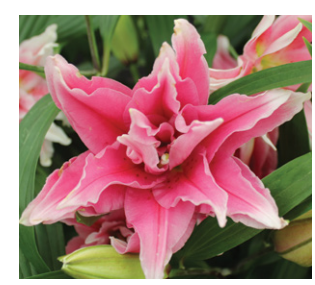
Elena Height: 80cm A: £3.00 B: £2.50 C: £2.00