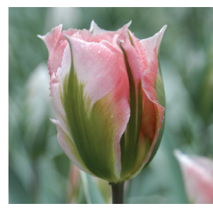
China Town Height: 45cm Plant Depth: 10-12cm 20 FOR £7.50