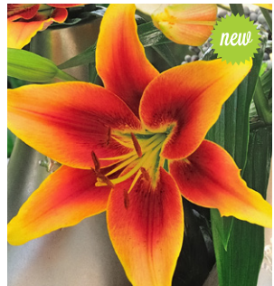
Kaveri (Oriental Asiatic) Height: 100cm A: £2.50 B: £1.75 C: £1.50