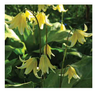
Erythronium Pagoda Height: 20-25cm Plant Depth: 6-8cm 6 FOR £5.00