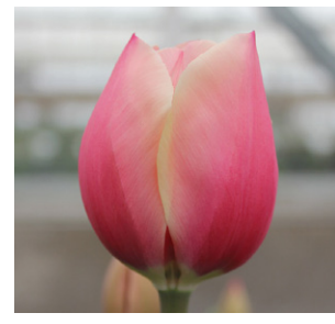
Estella Rynveld Height: 50cm Plant Depth: 10-12cm 20 FOR £7.50