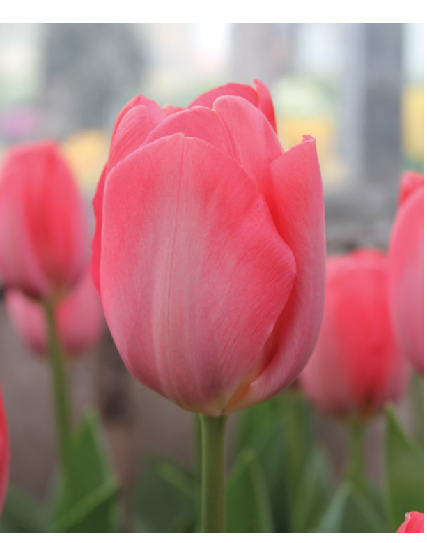
Van Eijk Height: 40cm Plant Depth: 10-12cm 20 FOR £7.50