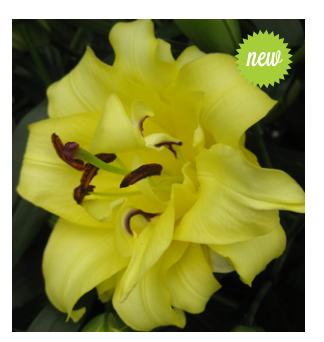
Exotic Sun Height: 75cm A: £3.00 B: £2.50 C: £2.00

These beautiful Double Oriental Lilies are a popular choice amongst lily lovers as they are pollen free. Its height of 90cm to 120cm (3 to 4 feet), colour, shape and fragrance contribute to its striking appearance. Double Oriental Lilies prefer acid soil (Ericaceous). If your soil is alkaline, plant in containers in Ericaceous compost.