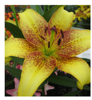
Golden Stone Height: 80cm A: £1.75 B: £1.50 C: £1.00