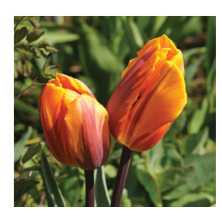
Princess Irene Height: 35cm Plant Depth: 10-12cm 20 FOR £7.50