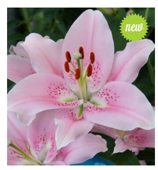
Companion Height: 100cm A: £2.50 B: £1.75 C: £1.50