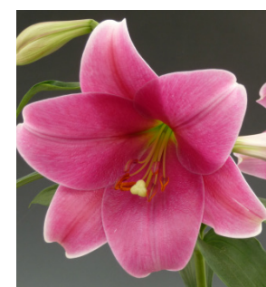
Pink Heaven Height: 120cm A: £2.50 B: £1.75 C: £1.50 A: £2.50 B: £1.75 C: £1.50