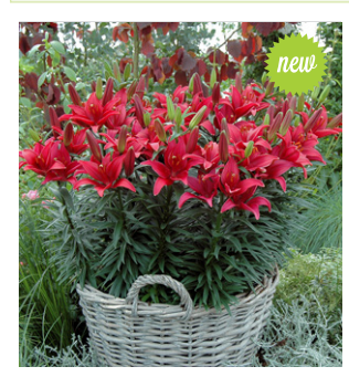
Tiny Ghost (Asiatic) Height: 35cm A: £2.00 B: £1.75 C: £1.50

A= Price per bulb if you purchase 1-2 bulbs B= Price per bulb if you purchase 3-4 bulbs C= Price per bulb if you purchase 5+ bulbs