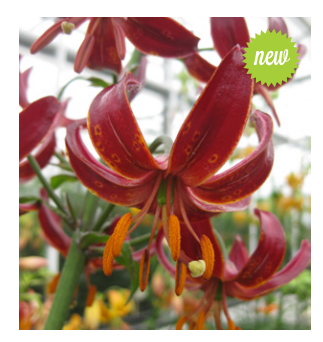
Claude Shride Height: 180cm £7.50 EACH