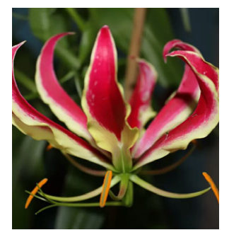
Gloriosa (The Flame Lily) Height: 3m £10 For 3 Bulbs