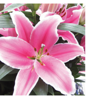
Marlon Height: 100cm A: £2.50 B: £1.75 C: £1.50