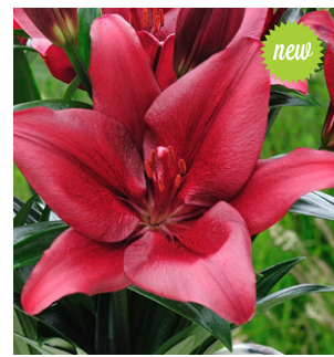
Forza Red Height: 100cm A: £1.75 B: £1.20 C: £1.00