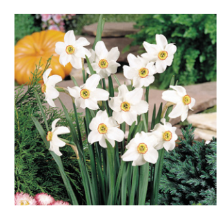
Narcissus Pheasant Eye Height: 35-50cm Plant Depth: 8-10cm 20 FOR £5.00