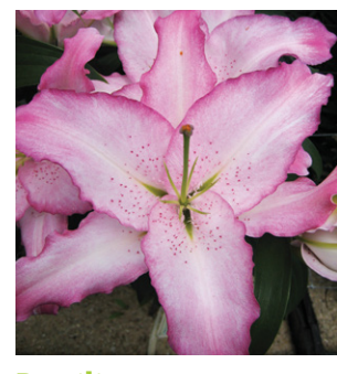
Brasilia Height: 100cm A: £2.50 B: £1.75 C: £1.50