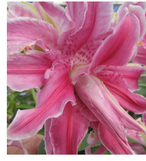
Pretty Girl Height: 70cm A: £3.00 B: £2.50 C: £2.00