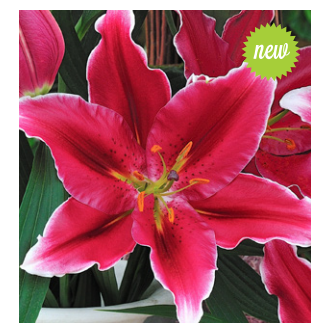
Metropolitan Height: 140cm A: £2.50 B: £1.75 C: £1.50