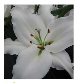
Rialto Height: 110cm A: £2.50 B: £1.75 C: £1.50