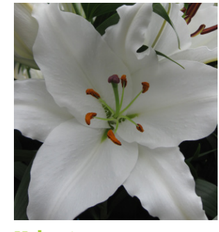
Helvetia Height: 120cm A: £2.50 B: £1.75 C: £1.50