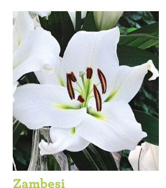
Height: 125cm A: £3.00 B: £2.50 C: £2.00