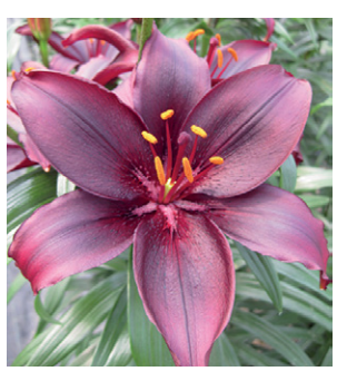
Mapira Height: 90cm A: £2.50 B: £1.75 C: £1.50