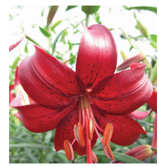
Hiawatha Height: 120cm A: £2.50 B: £1.75 C: £1.50