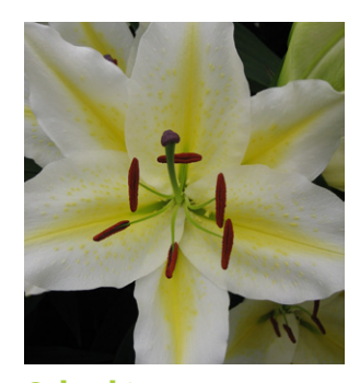
Columbia Height: 120cm A: £2.50 B: £1.75 C: £1.50

PAGE 6 Lily Bulbs / Spring Dispatch Tel: 01270 485379 www.hartsnursery.co.uk Lily Bulbs / Spring Dispatch PAGE 7