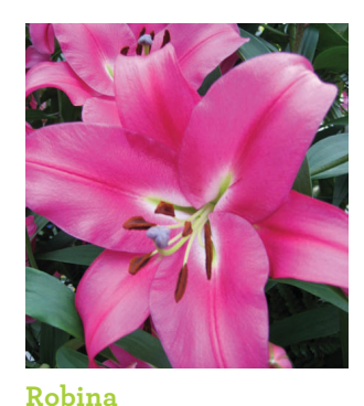
Height: 200cm A: £2.50 B: £1.75 C: £1.50