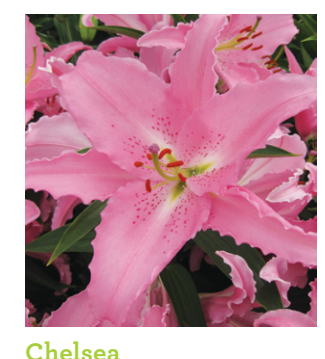
Height: 110cm A: £2.50 B: £1.75 C: £1.50