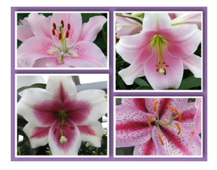
'Perfect Pinks' Lily Collection Pack of 12 Bulbs £15.00