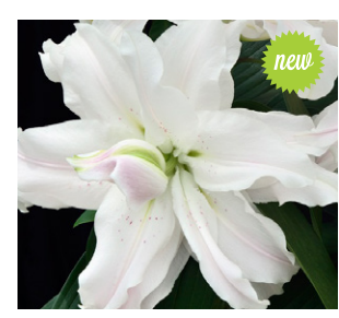
Carolina Height: 80cm A: £3.00 B: £2.50 C: £2.00