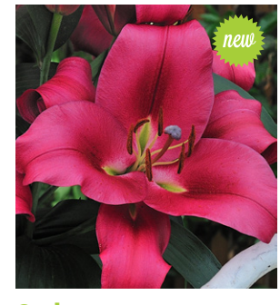
Carbonero Height: 120cm A: £2.50 B: £1.75 C: £1.50