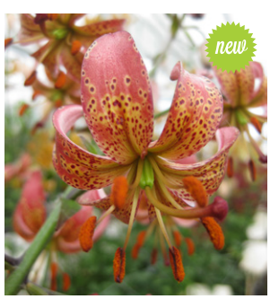
Manitoba Morning Height: 120cm £7.50 EACH