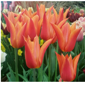
Ballerina Height: 60cm Plant Depth: 10-12cm 20 FOR £7.50