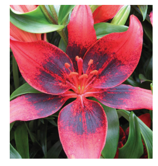
Pup Art Height: 90cm A: £1.75 B: £1.20 C: £1.00