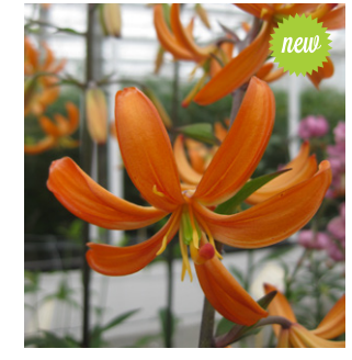
Orange Marmalade Height: 80cm £7.50 EACH