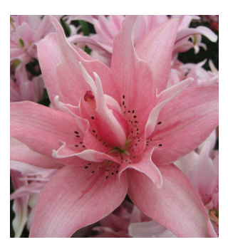
Elodie (Double) Height: 100cm A: £1.75 B: £1.20 C: £1.00