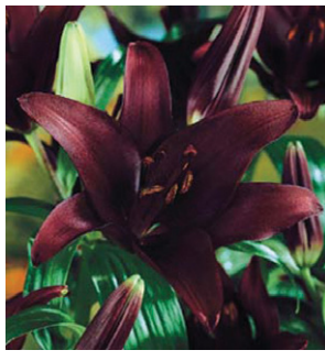
Landini Height: 90cm A: £2.50 B: £1.75 C: £1.50