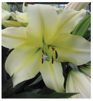
Big Brother Height: 120cm A: £2.50 B: £1.75 C: £1.50