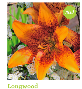
Height: 110cm A: £2.50 B: £1.75 C: £1.50