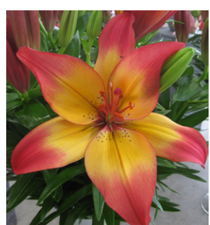
Heartstrings Height: 100cm A: £2.50 B: £1.75 C: £1.50