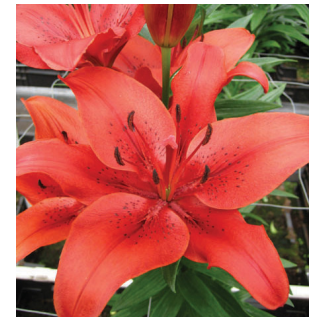
Original Love Height: 100cm A: £1.75 B: £1.20 C: £1.00