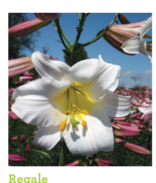
Height: 150cm A: £3.00 B: £2.50 C: £2.00