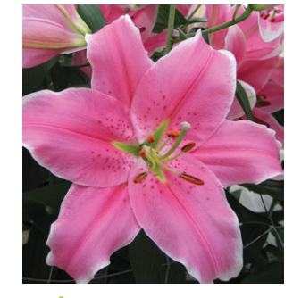
Sorbonne Height: 105cm A: £2.50 B: £1.75 C: £1.50