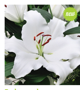
Bodyguard Height: 120cm A: £2.50 B: £1.75 C: £1.50