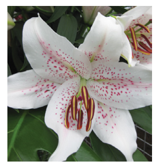
Extravaganza Height: 90cm A: £2.50 B: £1.75 C: £1.50