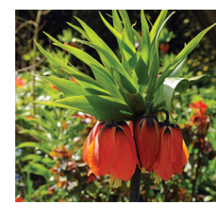
Imperialis Rubra Maxima

Height: 90cm Plant Depth: 15cm 3 FOR £10.00