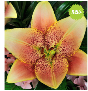
Sweet Desire Height: 100cm A: £2.50 B: £1.75 C: £1.50