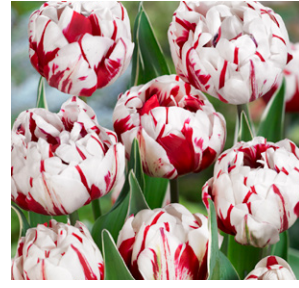
Carnival De Nice Height: 50cm Plant Depth: 10-12cm 20 FOR £7.50