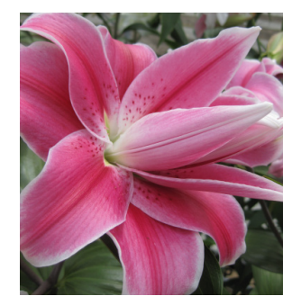
Sweet Rosy Height: 70cm A: £3.00 B: £2.50 C: £2.00

PAGE 10 Lily Bulbs / Spring Dispatch Tel: 01270 485379 www.hartsnursery.co.uk Lily Bulbs / Spring Dispatch PAGE 11