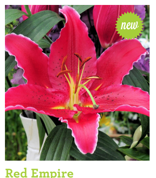
Height: 100cm A: £2.50 B: £1.75 C: £1.50