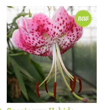
Height: 120cm A: £2.50 B: £1.75 C: £1.50