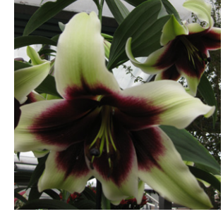
Kushi Maya (Nepalense Hybrid) Lankon Height: 1.5m £5.00 Each