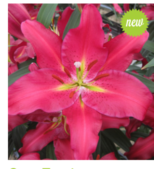
Gran Tourismo Height: 105cm A: £2.50 B: £1.75 C: £1.50