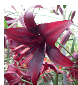
Night Flyer Height: 200cm A: £2.50 B: £1.75 C: £1.50