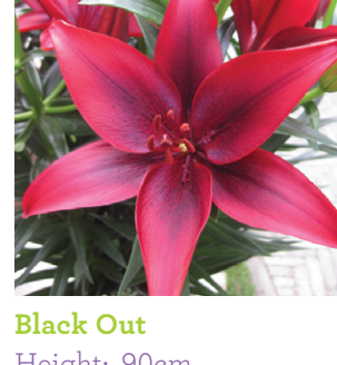
Height: 90cm A: £1.75 B: £1.20 C: £1.00