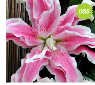
Fabiola Height: 80cm A: £3.00 B: £2.50 C: £2.00