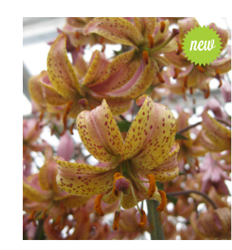
Chameleon Height: 160cm £7.50 EACH