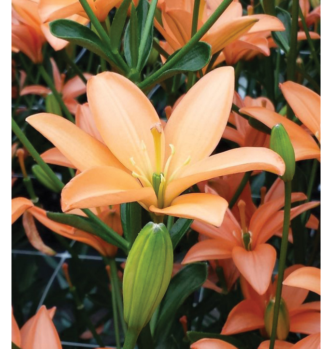
Orange Cocotte Height: 90cm A: £1.75 B: £1.20 C: £1.00