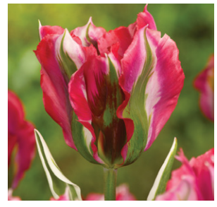
Esperanto Height: 30cm Plant Depth: 10-12cm 20 FOR £7.50