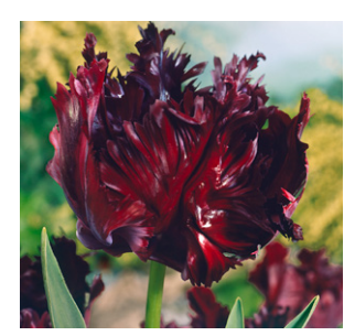
Black Parrot Height: 45cm Plant Depth: 10-12cm 20 FOR £7.50