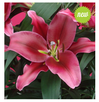
Palazzo Height: 120cm+ A: £2.50 B: £1.75 C: £1.50