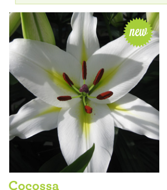
Height: 150cm+ A: £2.50 B: £1.75 C: £1.50