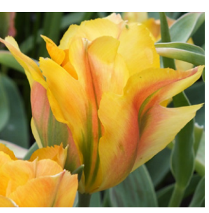
Golden Artist Height: 60cm Plant Depth: 10-12cm 20 FOR £7.50