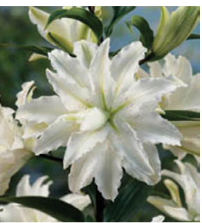
Polar Star Height: 100cm A: £3.00 B: £2.50 C: £2.00