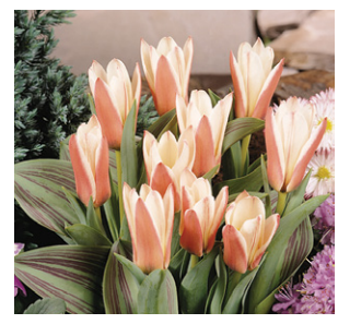
Heart's Delight Height: 20cm Plant Depth: 10-12cm 30 FOR £5.00