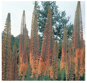
Cleopatra Height: 125cm Plant Depth: 5-10cm 3 FOR £5.00