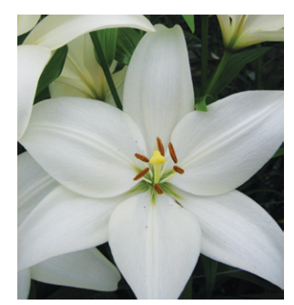
Bright Diamond Height: 100cm A: £1.75 B: £1.20 C: £1.00

C= Price per bulb if you purchase 5+ bulbs