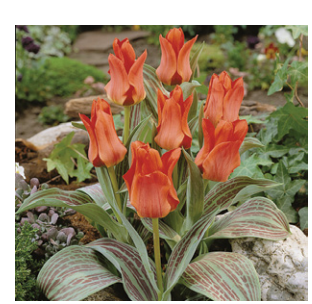
Red Riding Hood Height: 30cm Plant Depth: 10-12cm 30 FOR £5.00