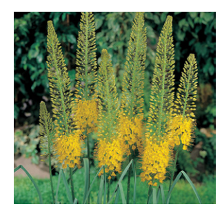
Bungei Height: 90cm Plant Depth: 5-10cm 3 FOR £5.00