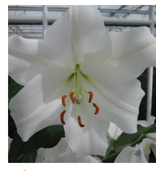
Polar Height: 110cm A: £2.50 B: £1.75 C: £1.50