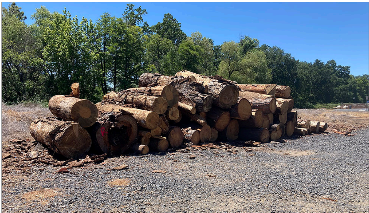
Photograph 3. Willows within the Developed Portion of the Project Site. Photograph Taken from the Center of the Project Site Facing West.