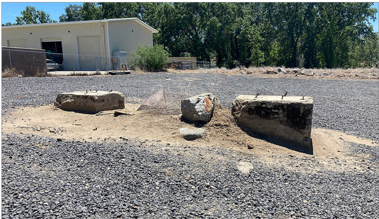
Photograph 1. Developed Portion of the Project Site. Photograph Taken from Western Edge of Project site Facing East.