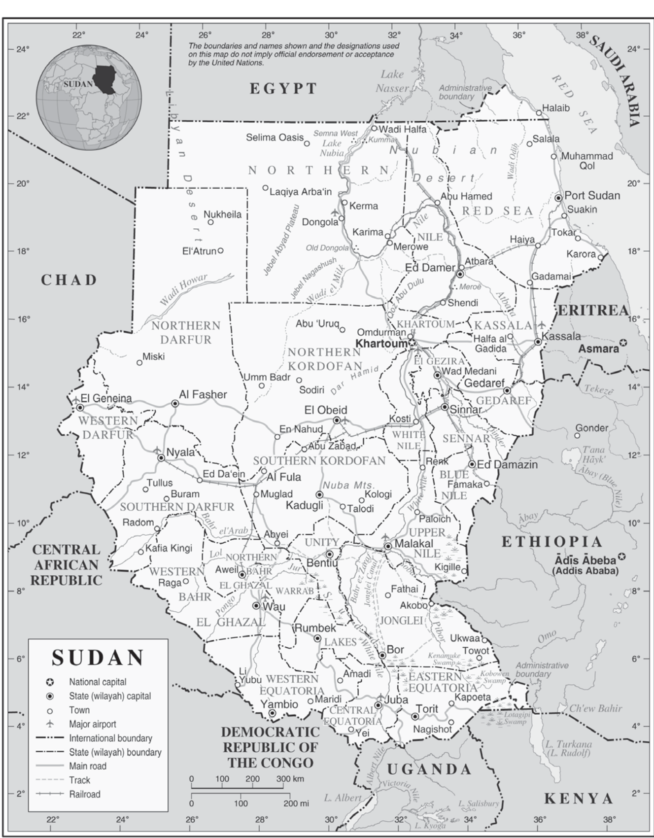
Map No. 3707 Rev. 10 UNITED NATIONS April 2007

Department of Peacekeeping Operations Cartographic Section