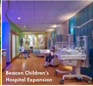
Beacon Children's Hospital Expansion