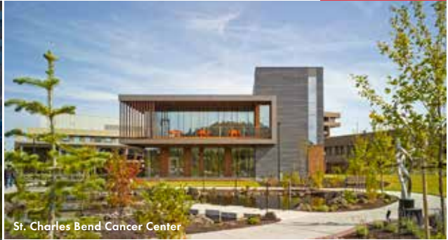
St. Charles Bend Cancer Center

Ann & Robert H. Lurie Children's Hospital of Chicago