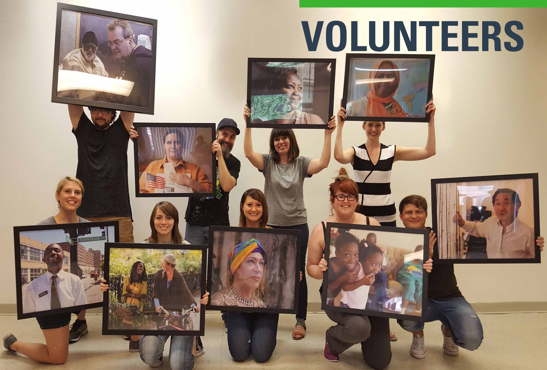
Volunteers from NogginLabs hanging framed art in the community room at The Leland, a Heartland Alliance supportive housing building in Uptown.