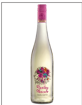
Deinhard Riesling Moscato.jpg