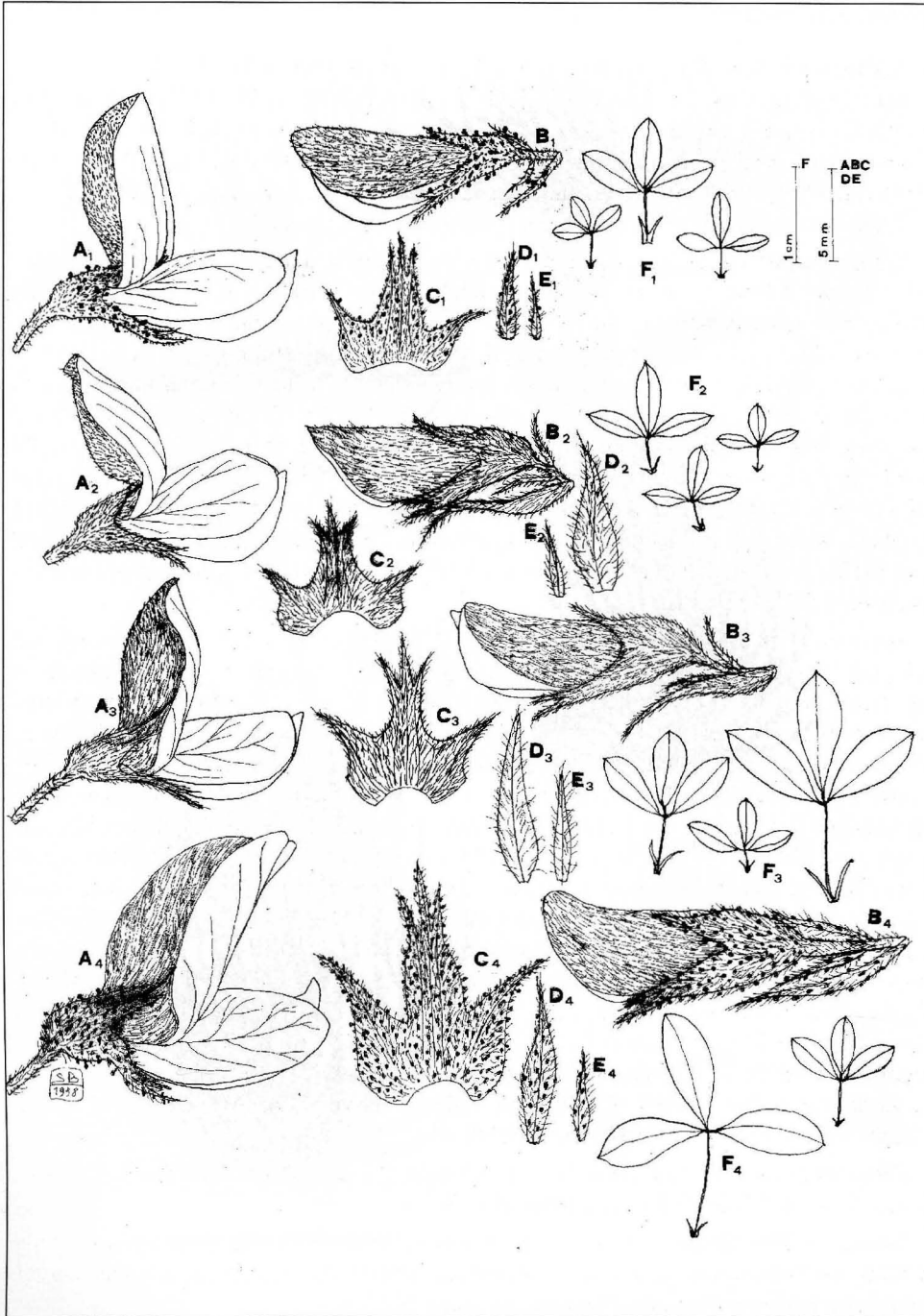
Fig. 1. Some significant morphological features of Adenocarpus bivonii (1), A. commutatus (2), A. brutius (3), A. samniticus (4). – A, flower; B, bud; C, open calyx; D, bract; E, bracteole; F, leaves.