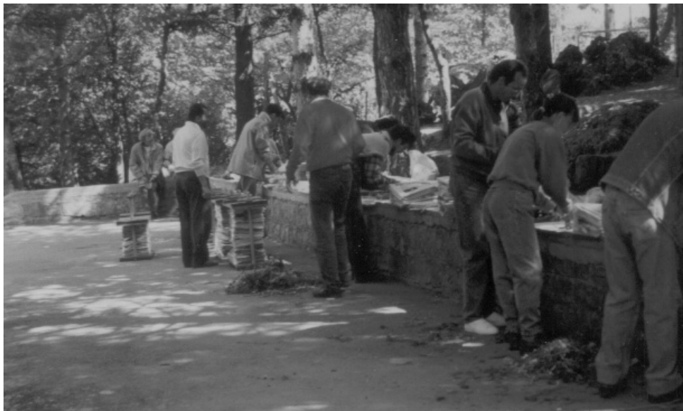
Fig. 1. Some participants busy with the presses to dry the plant material collected at Ficuzza-Busambra the previous day.

Collections were also carried out in the following localities: Faguarè, near Piano Battaglia, then at Canna, Passo delle Botte, Rocca di Mele, Pomieri, Portella Mandarini, Bozzolino, Scorzone, Catarineci, Geraci, Pollicino as well as in the neighbourhood of the Petralie and Castellana Sicula villages.