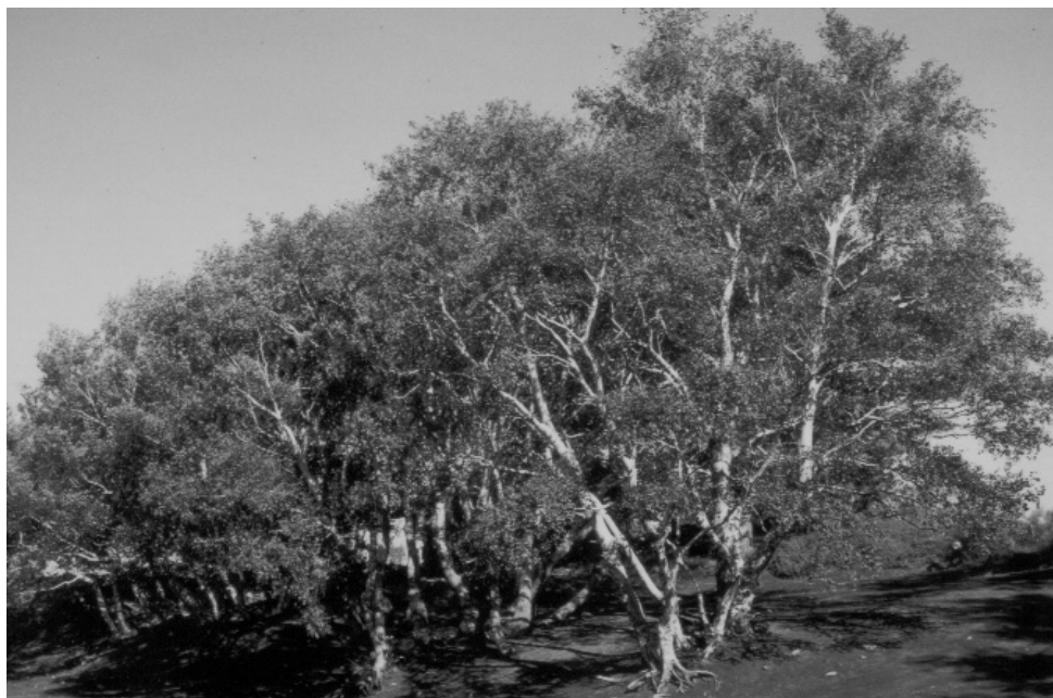
Fig. 3. The endemic Betula aetnensis on the Sartorius Mountains (Etna).