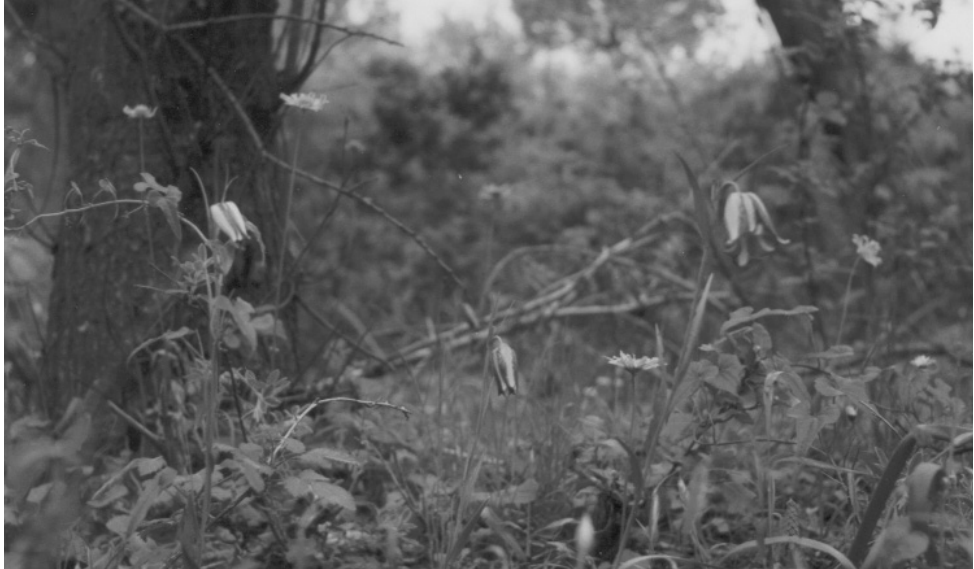
Fig. 5. The rare Fritillaria messanensis in the Peloritani Mountains.