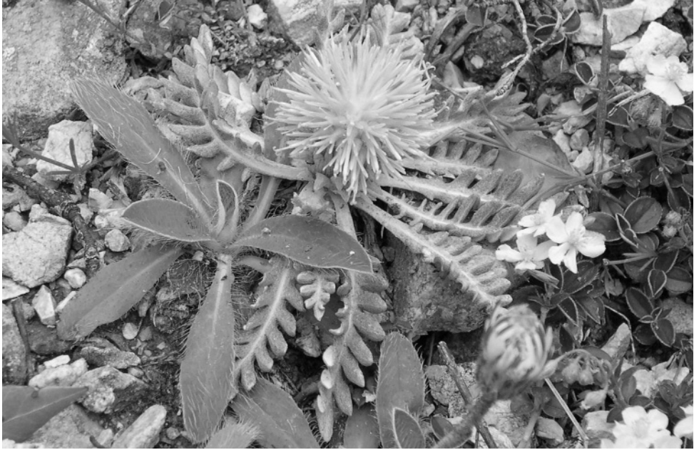
Fig. 2. Jurinea humilis subsp. bocconii (the plant inspired the cover logo of Bocconea) with Hieracium macranthum and Helianthemum canum in the carbonate habitat of the Madonie Mountains.

Milena (Caltanissetta), Montallegro, Ribera, Aragona (Agrigento). Among the collections, Capnophyllum peregrinum , Limonium catanzaroi , L. optima , Brassica villosa subsp. tinei , Tolpis altissima , Scabiosa dichotoma , Ammi crinitum , Parapholis pycnantha and Solanum eleagnifolium are worthy remembering. Instead, the collections made within the scheduled itinerary include Tanacetum balsamita , Celtis tournefortii , Stipa sicula and Echinophora tenuifolia .