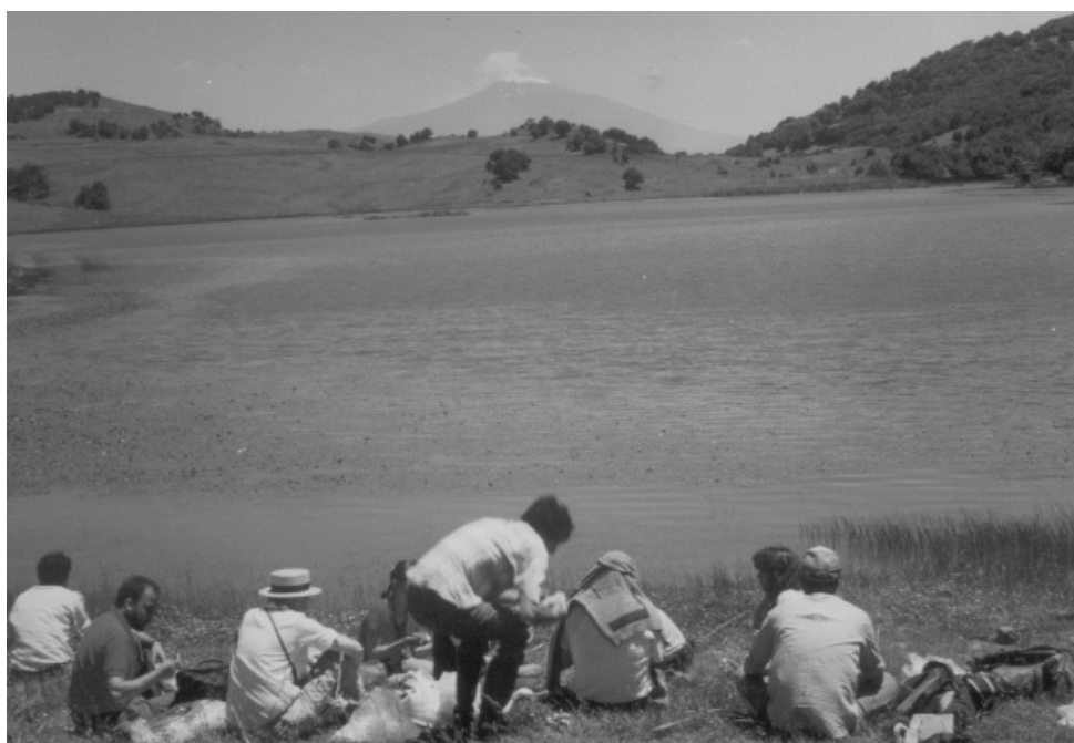
Fig. 4. The lake named "Biviere di Cesarò" (Nebrodi Mountains): some participants during the pic-nic.