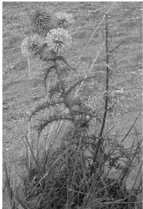
Fig. 7. Echinops spinosissimum in the sandy shore at Oliveri-Tindari (Messina Province).