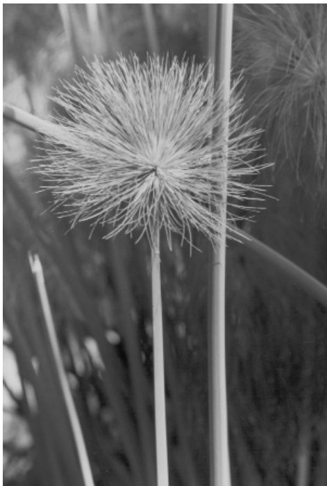
Fig. 6. The characteristic umbel of Cyperus papyrus which occurs wild in the Ciane River near Siracusa.