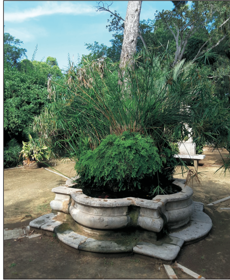
Fig. 3. The central fountain at the intersection of the main paths.