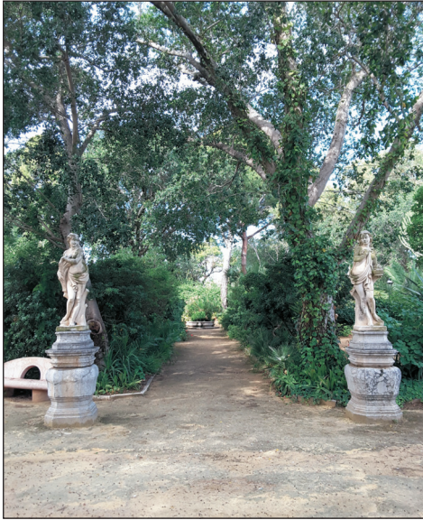
Fig. 2. The transversal path with two nineteenth century statues placed at the entrance. In the background the central fountain.