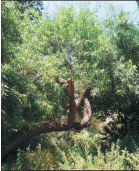
Fig. 5. The specimen of Rhus lancea unique in the historic Sicilian gardens.