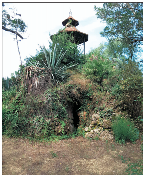
Fig. 4. The artificial hill surmounted by an iron pagoda-shaped gazebo and one of the accesses to the cave below.

formed, with the creation of flower beds and irregular paths, some of which mirrored with respect to the longitudinal axis that continues the road axis in front of the architectural complex along which the inhabited center developed. The nineteenth-century plant is a complete “romantic” landscape arrangement. It is probably the work of an amateur aware of the Anglo-Chinese models that interprets the taste of the landscape garden in a Mediterranean key. Of the previous geometric layout, the two orthogonal avenues, the fountain and the exedras were maintained, while other elements were introduced with the nineteenth century transformation. Among the subsequent additions we find the hill, slightly sloping, at the top of which is a characteristic Aspra stone bench, hidden among the rich tropical vegetation (Fig. 4). Remains of another bench the same as the one on the hill are located next to the characteristic artificial rock