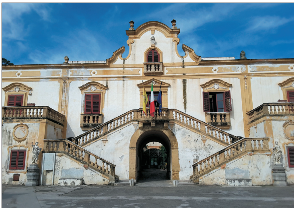
Fig. 1. The prospectus of the villa. Today the building is the seat of the administration of Santa Flavia.

Along the path marked by the axis, leaving behind the winter garden, hidden by the imposing front overlooking the village of Santa Flavia, you will discover the garden, a reality that was once used exclusively by the Filangeri family (Figs. 1-3). Inscribed in a