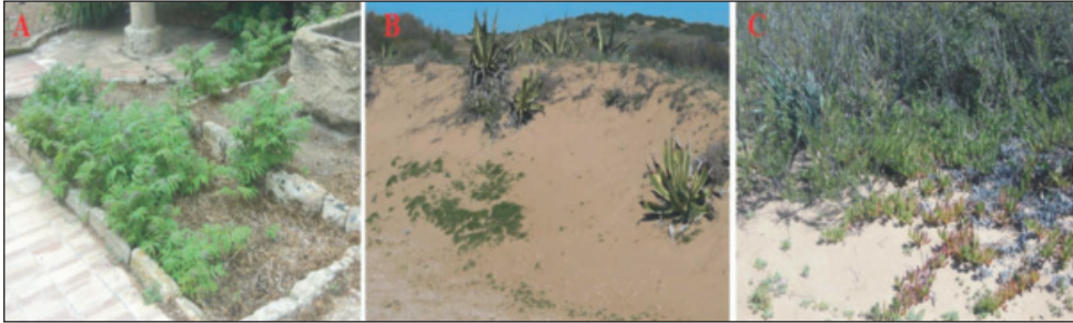
Fig. 4. Some alien taxa in the Archaeological Park of Selinunte: A) Ailanthus altissima ; B) Agave americana subsp. americana ; C) Carpobrotus edulis .

Our results confirm that this area is among the richest in biodiversity of the southern coast of Sicily as reported in Domina & al. (2018b). The present contribution has also highlighted the presence of the high number of alien species (29 taxa), mostly naturalized and sometimes more or less invasive (Fig. 4) such as: Ailanthus altissima (Mill.) Swingle, Carpobrotus edulis (L.) N. E. Br., Eucalyptus camaldulensis Dehnh. subsp. camaldulensis , Phoenix canariensis H. Wildpret. and Vachellia karroo (Hayne) Banfi & Galasso. Other alien species (13 taxa) are cultivated in the Archaeological Park for ornamental purposes.