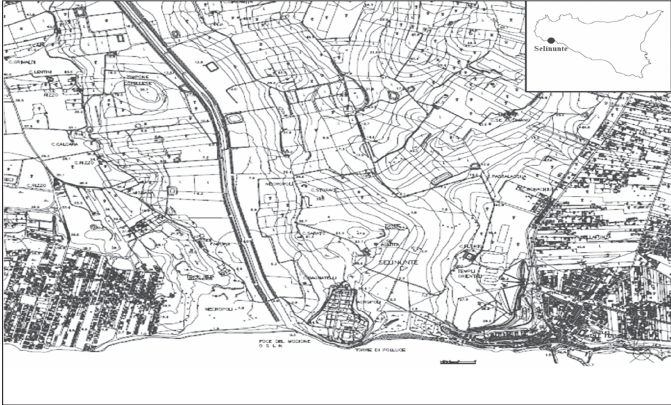
Fig. 1. Study area: the Archaeological Park of Selinunte (Sicily, Italy).

follow Bartolucci & al. (2018) and Galasso & al. (2018). Taxa are ordered alphabetically within each family. Life forms and chorological types of natural and alien taxa are according respectively to Raimondo & al. (2010) and Raimondo & al. (2005), while cultivated plant follow Bazan & al. (2005).