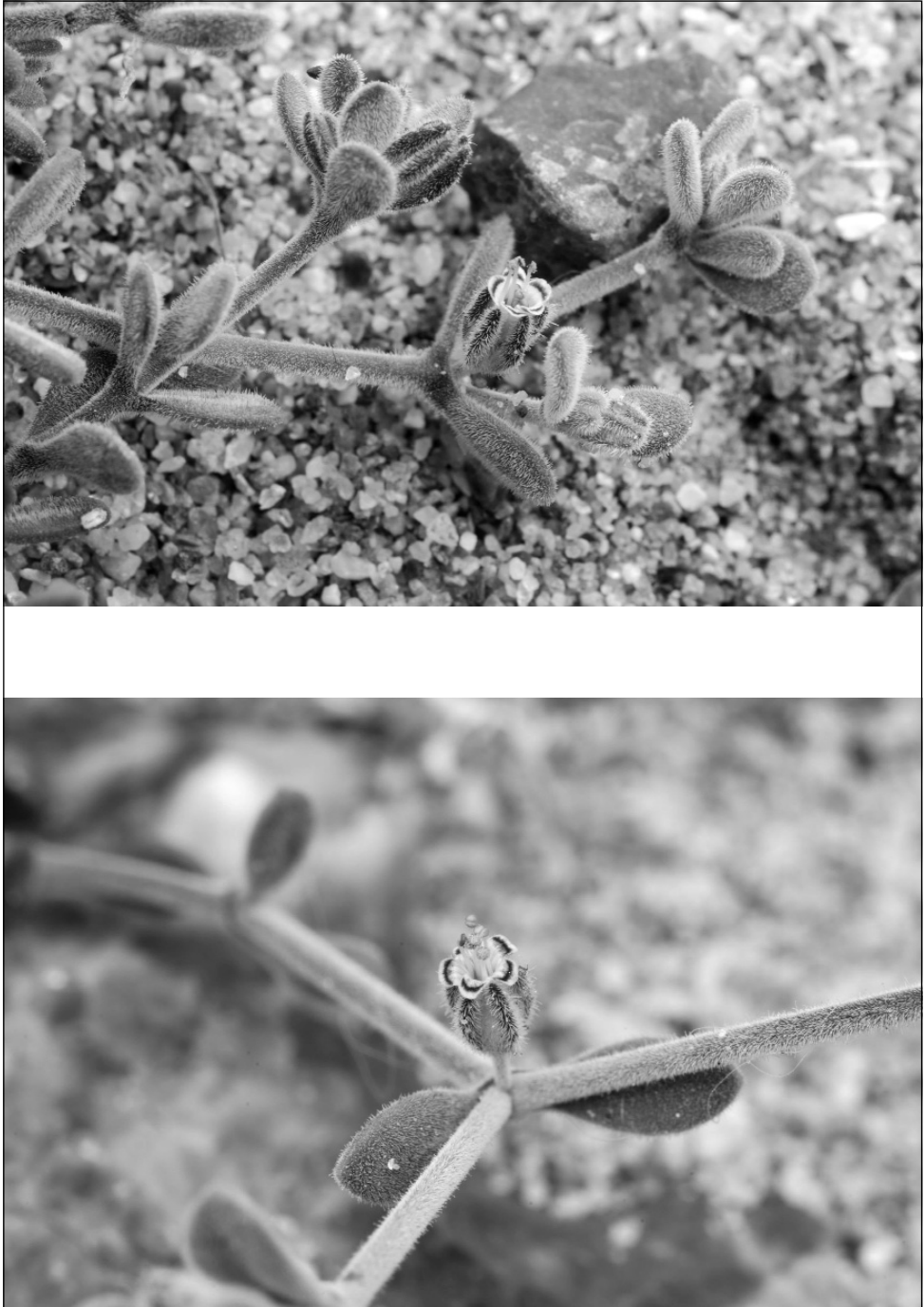
Fig. 1. Flowering shoots of Bolanthus creutzburgii subsp. zaffranii photographed at the type locality on 31 March 2009.