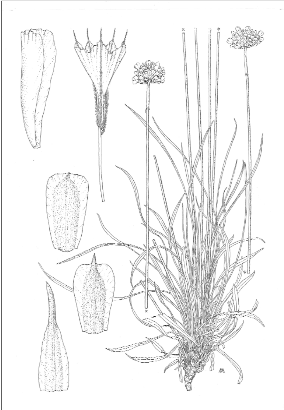
Fig. 3. Armeria garganica Arrigoni \times 0.59 . Details: Calix and scales \times 5.9 .