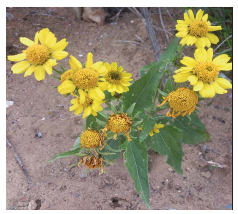
Fig.1. Verbesina encelioides subspecies encelioides at Hencha-Sfax, 20 August 2011.

Our observations allowed to deduce that auricles are semi-ovate which borne on petioles of most leaves, achene wing apices are acute and phyllaries (bracts) mostly averaging more than 12 mm long. Accordingly, we conclude that the collected specimens belong to the subspecies encelioides (Fig. 1).