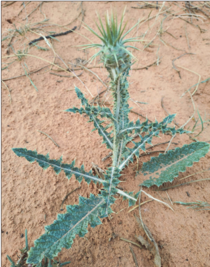
Fig. 1. Habit of Onopordum ambiguum (April 2021).

The range of O. ambiguum extends from the eastern Mediterranean to Iraq and the Arabian Peninsula. It is present in the following countries: Egypt, Iraq, Palestine, Saudi