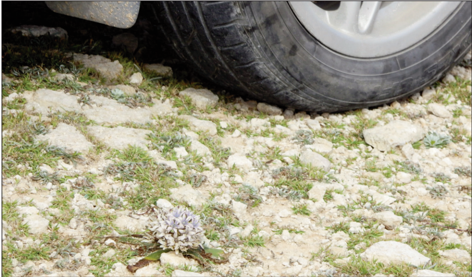
Fig. 3. Example of a direct threat from tourism on the natural population of Oncostema dimartinoi in Lampedusa Island.