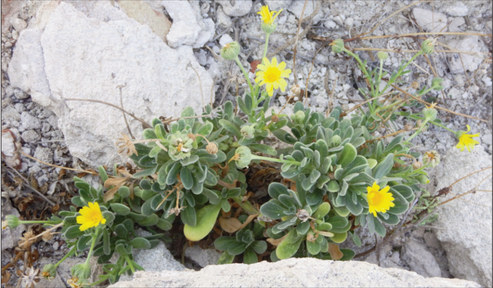
Fig. 2. Calendula suffruticosa subsp. maritima along the coast of Trapani (NW Sicily) growing on construction waste.

On the contrary, only a small number of taxa (3.9%) have, instead, shown a worsening of their risk categories and this is to be related to the deterioration of their growth habitat, this is true above all for wetlands and coastal habitats (Domina & al. 2018, 2020; Sciandrello 2020). For example, in the case of Oncostema dimartinoi (Brullo & Pavone) F. Conti & Soldano, geophyte endemic to Lampedusa (Pelagie Islands) (Fig. 3), the increase in tourism over the years is a threat to the expansion of the species.