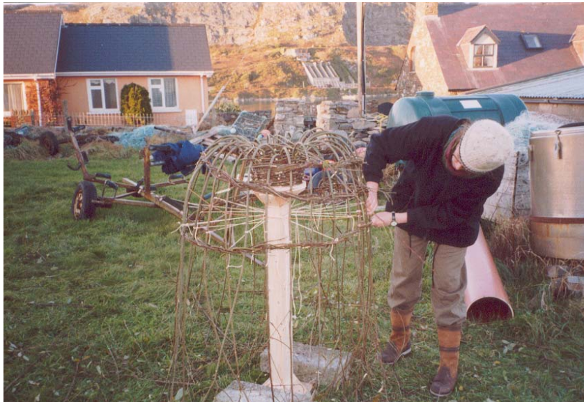
Cliona O'Carroll making a traditional lobster pot, West Cork, November 2003