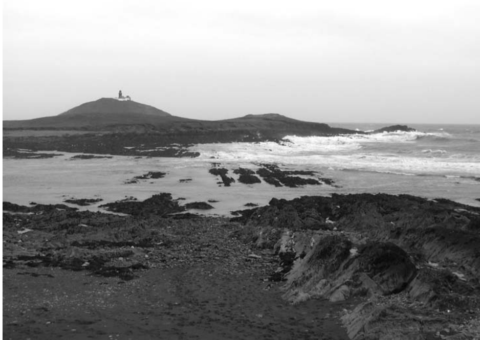
Ballycotton Lighthouse, Co. Cork