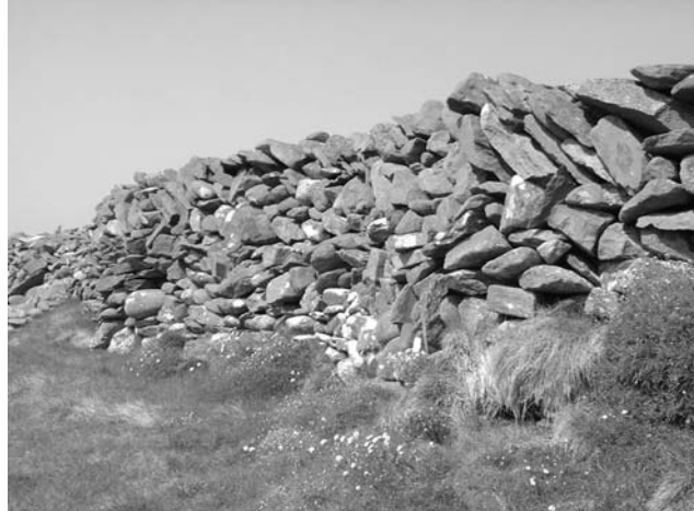
Coastal Stone Wall

References within BiblioMara are sorted in alphabetical order by the name of the first author and a unique citation number is assigned to each entry. Each reference contains information on reference type, authors, editors, and publisher and includes a short abstract describing the reference.