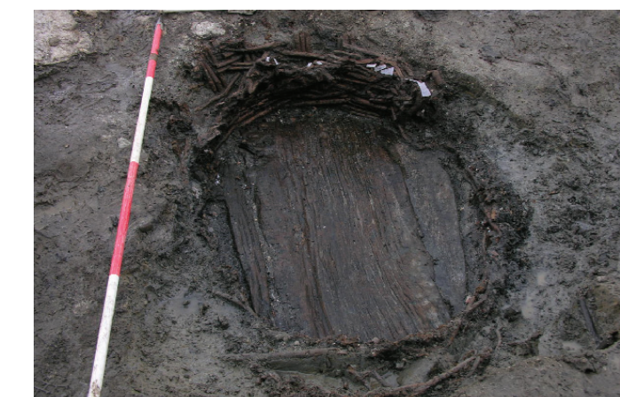
A wooden trough found during archaeological excavation of a fulachta fiadh at Ballyclogh near Redcross.