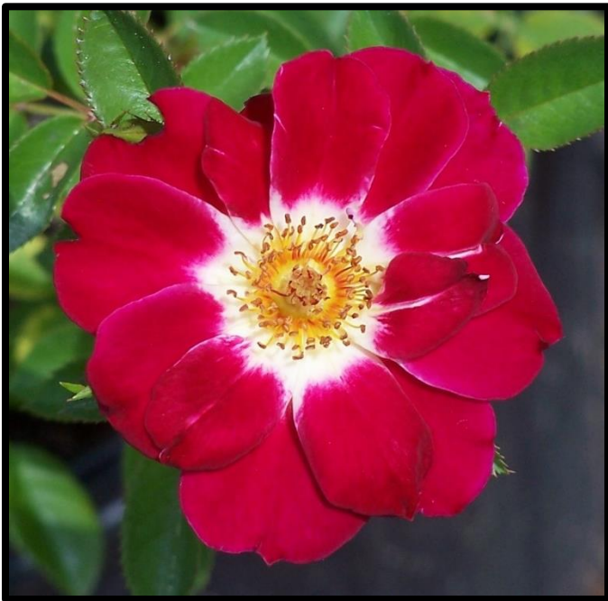
'Redhot' - F