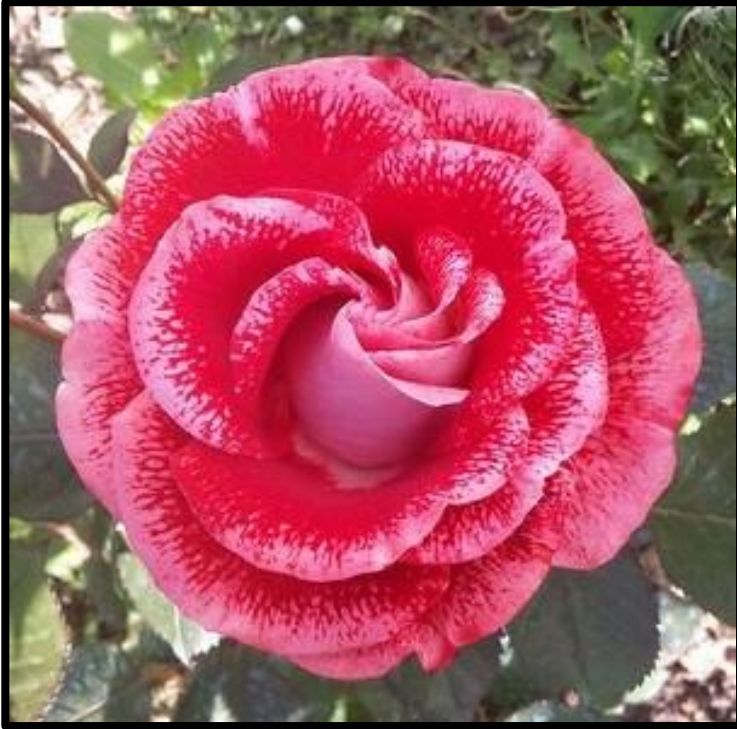
‘Maestro’ - HT

rose, then known as MACspash (SPANish SHawl), was “just right.” A good deal of pressure was applied to hastily release it despite reservations on his part. It was given the name ‘Sue Lawley’ after a prominent British television personality and won the Gold Star of the Pacific award in New Zealand. Reportedly difficult to propagate and somewhat prone to black spot, this is probably another rose for the collector or the rose grower living in a relatively black spot free climate