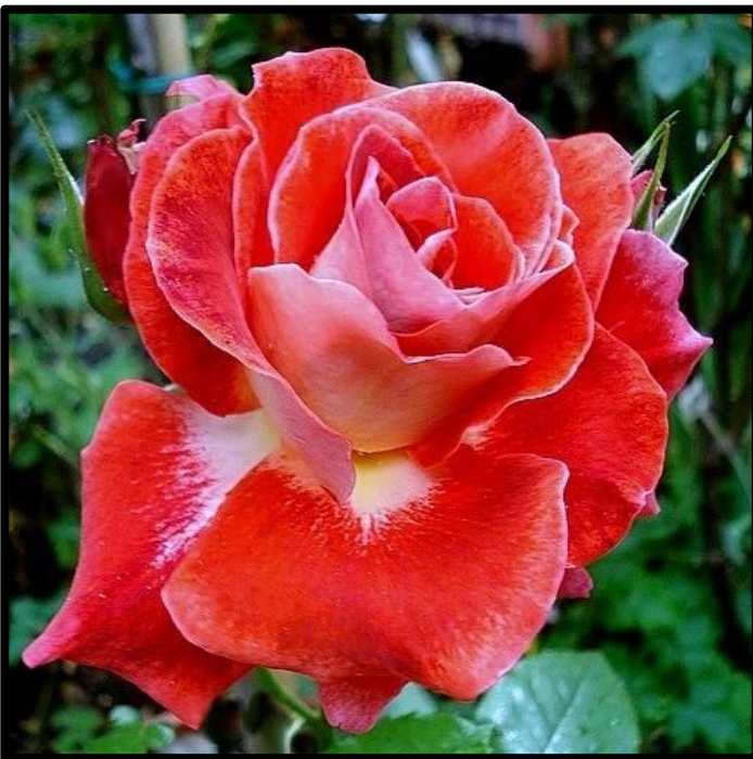
'Pat Shanley' - HT; Hyb. by Viru Viraraghavan