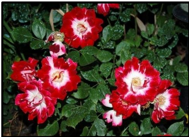
'War Dance' - F