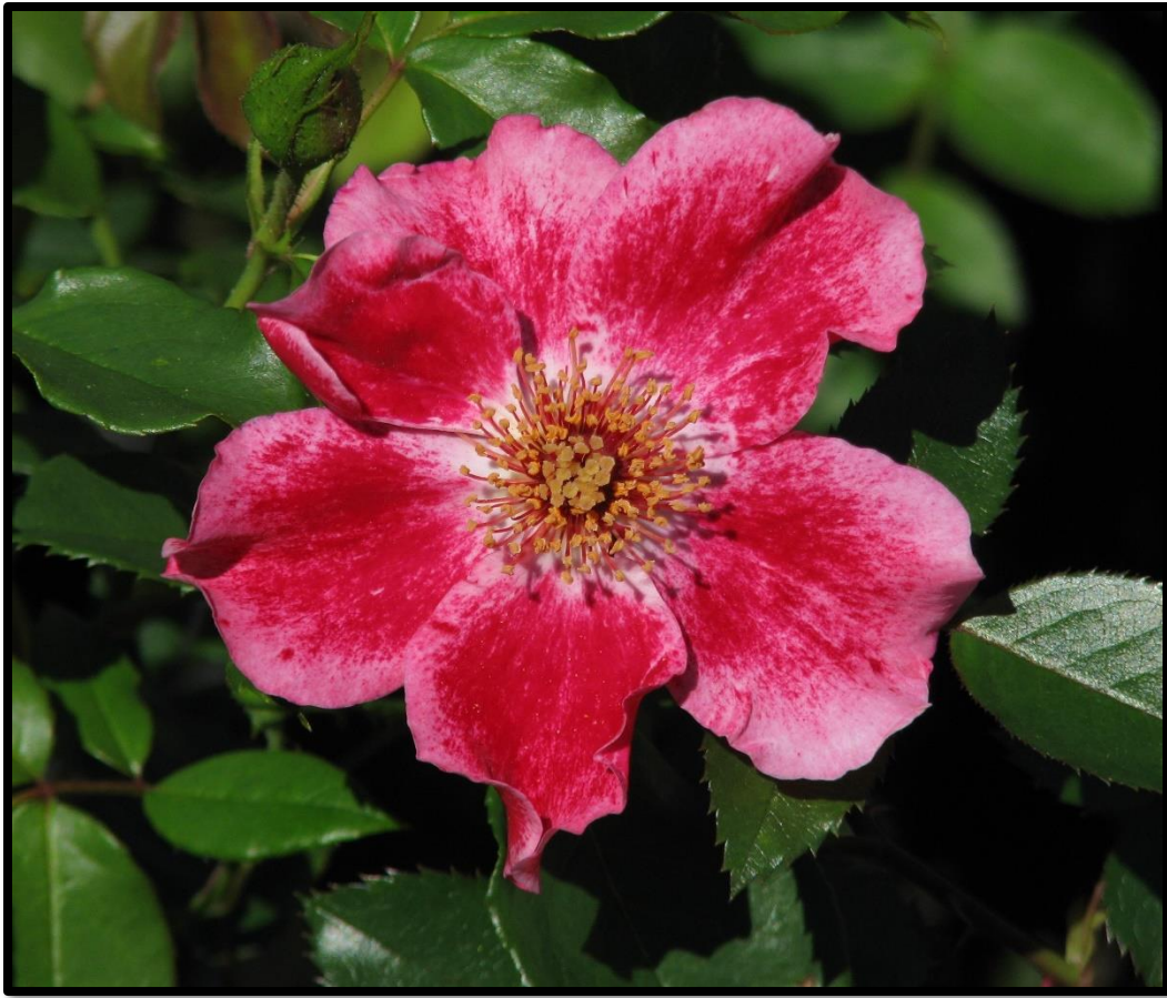
'Starberry' - Shrub