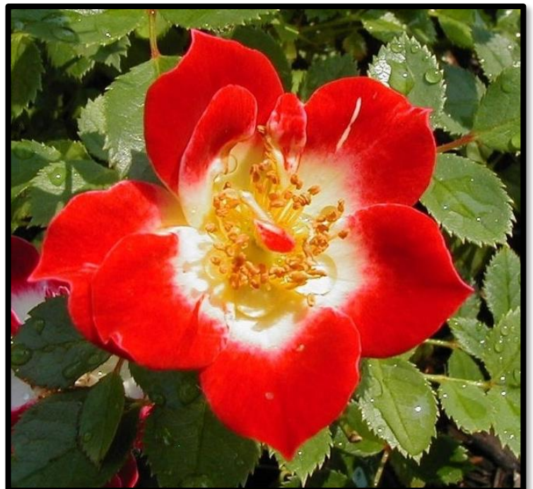
‘Little Artist’ - Min

In 1984 Sam introduced another Miniature named ‘Ragtime.’ Its family tree has ‘Anytime,’ ‘Orangeade,’ ‘Picasso,’ and ‘Eye Paint’ in its heritage. In color, its twenty plus petals range from coral to red with white edges, similar to ‘Matangi.’ Australian and New Zealand rose growers praised it for its vivid color and considered it at its best as an