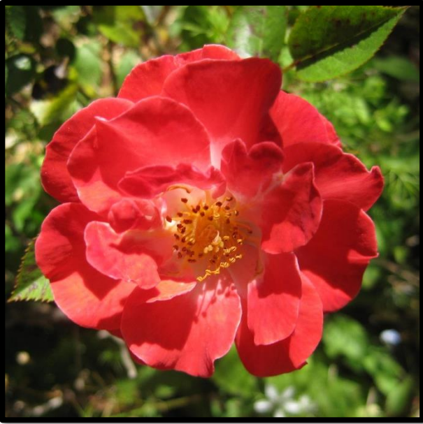
'Ragtime' - M