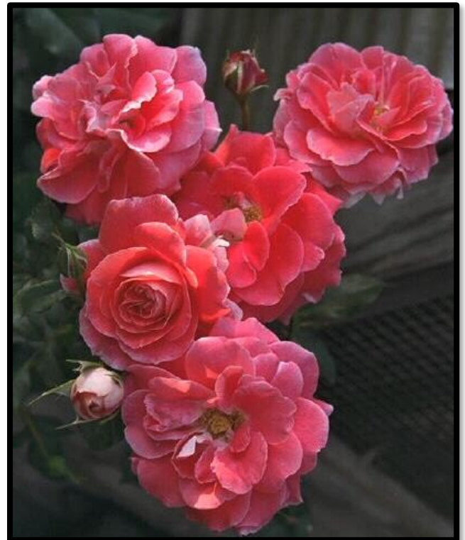
'Matangi' - Fl; Photo unattributed

'M1974 saw the introduction of the next hand-painted cultivar, 'Matangi.' It resulted from a cross of a vigorous seedling featuring bright orange flowers with a prominent yellow eye, codenamed MACyeeye, and 'Picasso.' Its twenty or so petals are fiery vermilion or coral orange, depending on the weather, with narrow margins of white, a white center, and a startling white reverse. One early reviewer noted that it stood out like a neon sign in the garden. Its name came from a native folk song Sam heard performed by Maori operatic bass/baritone Inia Te Wiata. After moving to New Zealand, he discovered Matangi was also the name of a nearby village. From Maori to English the word is translated "gentle breeze." 'Matangi' was Sam's first important New Zealand introduction, winning not only a prestigious Certificate of Merit in New Zealand rose trials, but also the President's International Trophy in the U.K., gold medals in Rome and Bagatelle, and awards in Baden-Baden and Belfast.