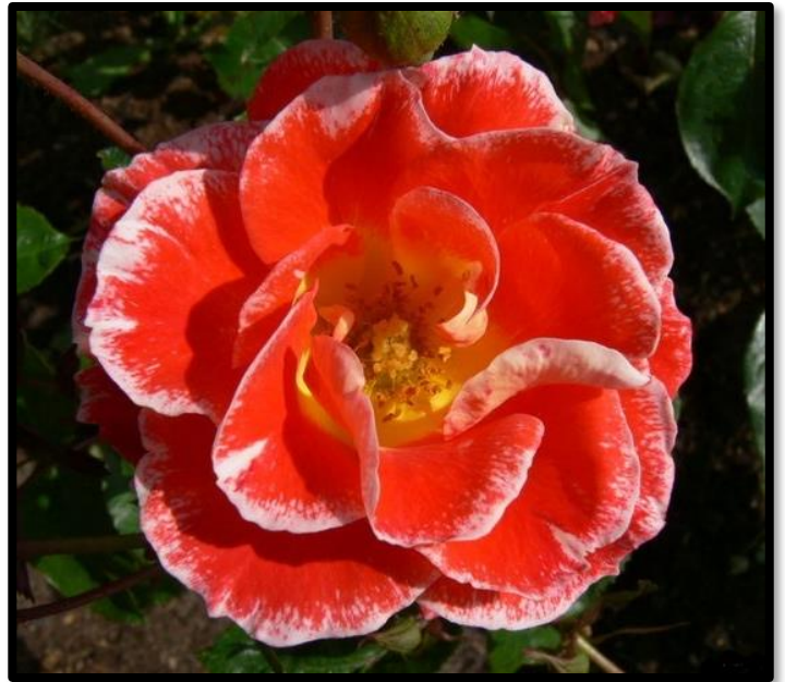
'Stretch Johnson' - F