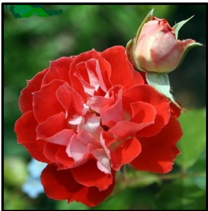
'Blastoff' - Fl; Hyb. by Ralph Moore