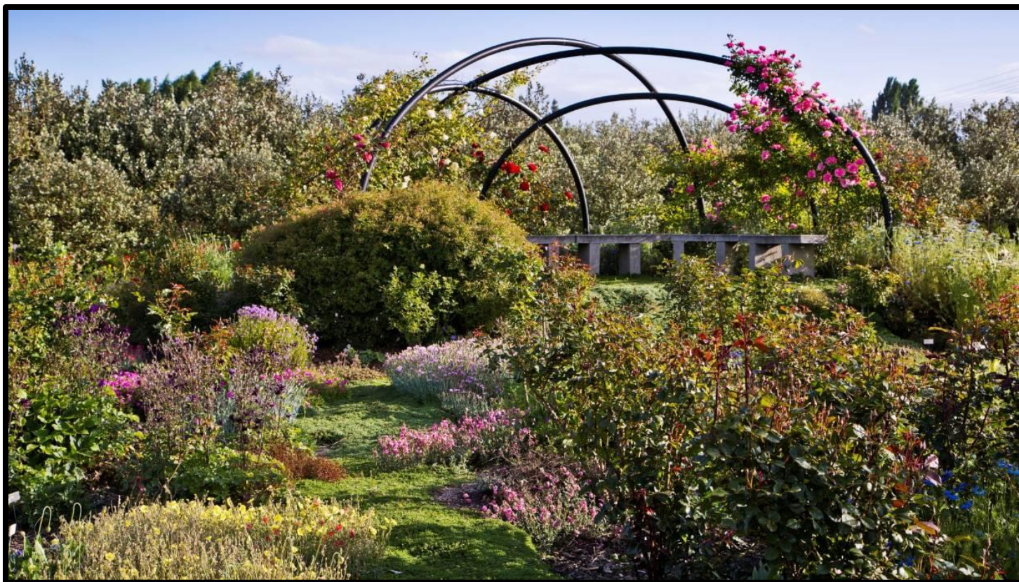
Cheops Garden, Hastings, New Zealand