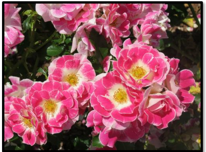
'Picotee' - Patio; Hyb by Rob Somerfield