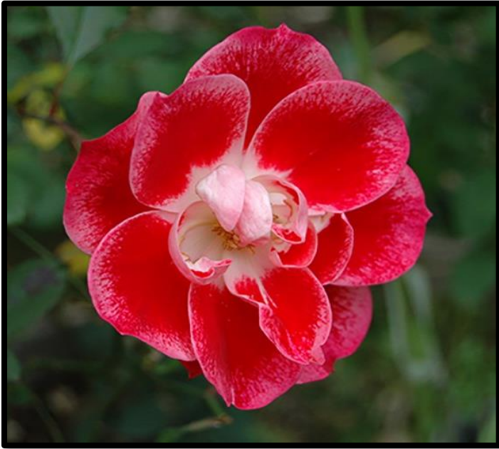
'Picasso' - Fl