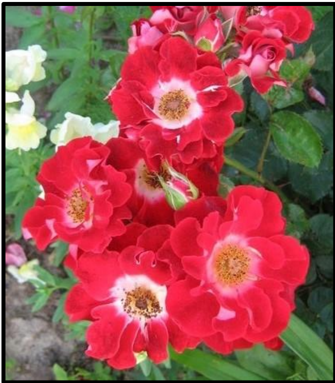
'Mighty Mouse' - FI; Photo Unattributed