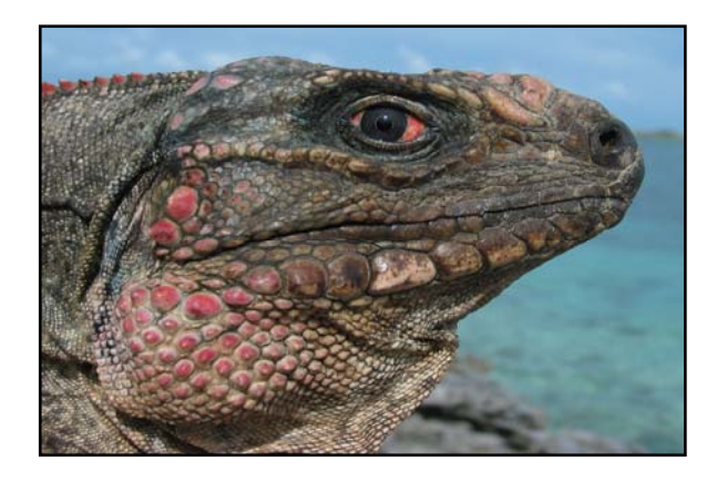
FIGURE 1 . Northern Bahamian Rock Iguana ( Cyclura cychlura ) from Flat Rock Reef Cay in the northern Exumas of The Bahamas.

The Caribbean is composed of a series of island nations in which economies are heavily dependent upon tourism, and The Bahamas conforms to this trend with nearly half of its GDP derived from tourism (US Department of State. 2011. Background Note: The Bahamas. Available from http://www.state.gov/r/pa/ei/ bgn/1857.htm [Accessed 1 April 2011]). The 120-mile long Exuma Island chain of The Bahamas has historically been a destination for cruisers and other relatively low impact visitation, but, at the encouragement of government, tourism, and related development, has been increasing steadily since the 1970's (Lowe and Sullivan-Sealey 2003; Knapp et al. 2011). One of the wildlife attractions of the Exumas is the Northern Bahamian Rock Iguana (Cyclura cychlura), which inhabits a few of the islands within the chain (Fig. 1). These lizards are endemic to The Bahamas and are listed as Vulnerable on the IUCN Red List (IUCN Red List of Threatened Species. 2010. Cyclura cychlura. Available from www.iucnredlist.org [Accessed 27 December 2010]). Cyclura cychlura in the Exumas occur in two disjunct populations, located in the north and south of the chain. They are genetically distinguishable from the population of the same species occurring on Andros Island (C. c. cychlura), but are not genetically distinguishable from each other despite traditionally being placed in separate subspecies, C. c. inornata in the north and C. c. figginsi in the south (Malone et al. 2003).