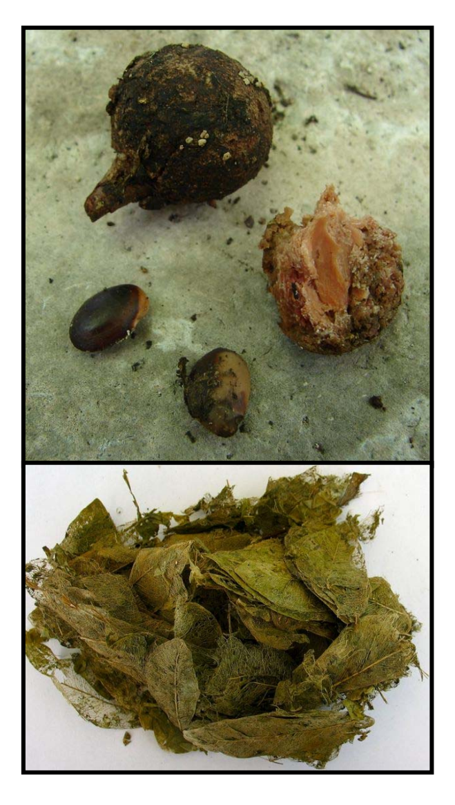
FIGURE 5. Natural scat items; Wild Dilly ( Manilkara bahamensis ) fruits and seeds (above) and Buttonwood ( Conocarpus erectus ) leaves (below). (Photographed by Kirsten N. Hines).

marine sponge), and sand, often in large quantities dried to a cement-like consistency (Fig. 7). Peopleinfluenced items were only present in scat collected from feeding areas of the two most heavily visited islands. Of the scat samples collected on visited islands, 12.5% contained people-influenced items as opposed to 0% on non-visited islands (U = 1311, Z = 2.04, P = 0.0414). Within visited islands, 25.4% of scat samples collected in feeding areas contained people-influenced items versus 0% in non-feeding areas of the islands (U = 630, Z = -2.95, P = 0.0032). While some marine debris (e.g., marine flora and fauna) is occasionally ingested by iguanas regardless of humans, its incidence in scats on visited islands has substantially increased in the last 2-4 years (unpubl. data). I have only found sand in scat on