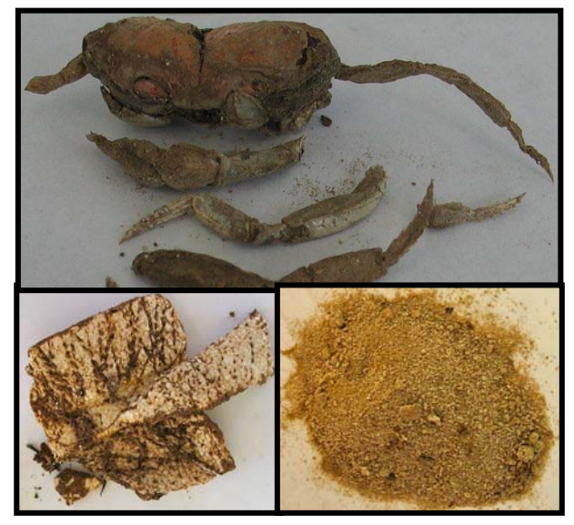
FIGURE 6. People influenced scat items: clockwise from top; swimming crab, sand, styrofoam. (Photographed by Kirsten N. Hines).

marine sponge), and sand, often in large quantities dried to a cement-like consistency (Fig. 7). Peopleinfluenced items were only present in scat collected from feeding areas of the two most heavily visited islands. Of the scat samples collected on visited islands, 12.5% contained people-influenced items as opposed to 0% on non-visited islands (U = 1311, Z = 2.04, P = 0.0414). Within visited islands, 25.4% of scat samples collected in feeding areas contained people-influenced items versus 0% in non-feeding areas of the islands (U = 630, Z = -2.95, P = 0.0032). While some marine debris (e.g., marine flora and fauna) is occasionally ingested by iguanas regardless of humans, its incidence in scats on visited islands has substantially increased in the last 2-4 years (unpubl. data). I have only found sand in scat on