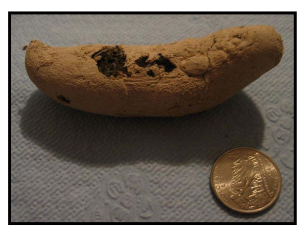
FIGURE 7 . Scat with a cement-like coating of dried sand compared with a US quarter (29 mm diameter). (Photographed by Kirsten N. Hines).