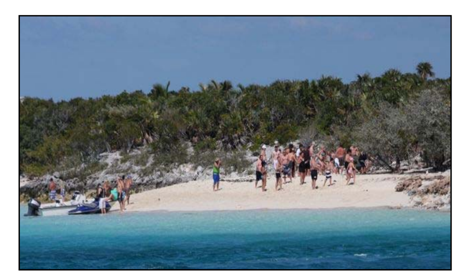
FIGURE 2. Tourists feeding Northern Bahamian Rock Iguanas ( Cyclura cychlura ) at the landing beach on Leaf Cay, northern Exumas of The Bahamas.